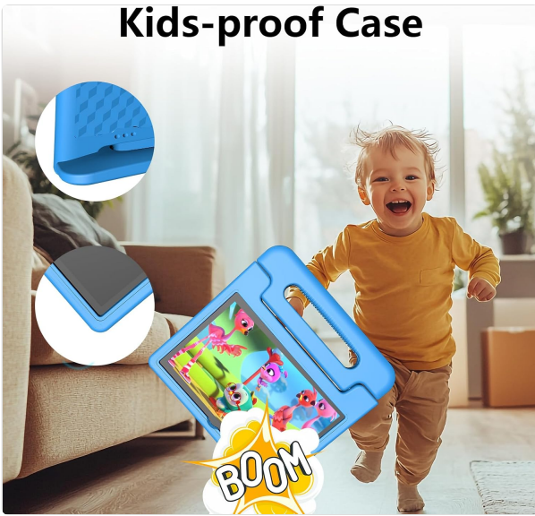
Image 7.1: The tablet's durable case with its integrated stand for hands-free viewing.