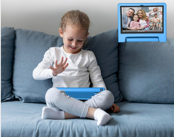
Image 7.2: Detail of the HD dual cameras (2MP front, 5MP rear) for photos and video calls.