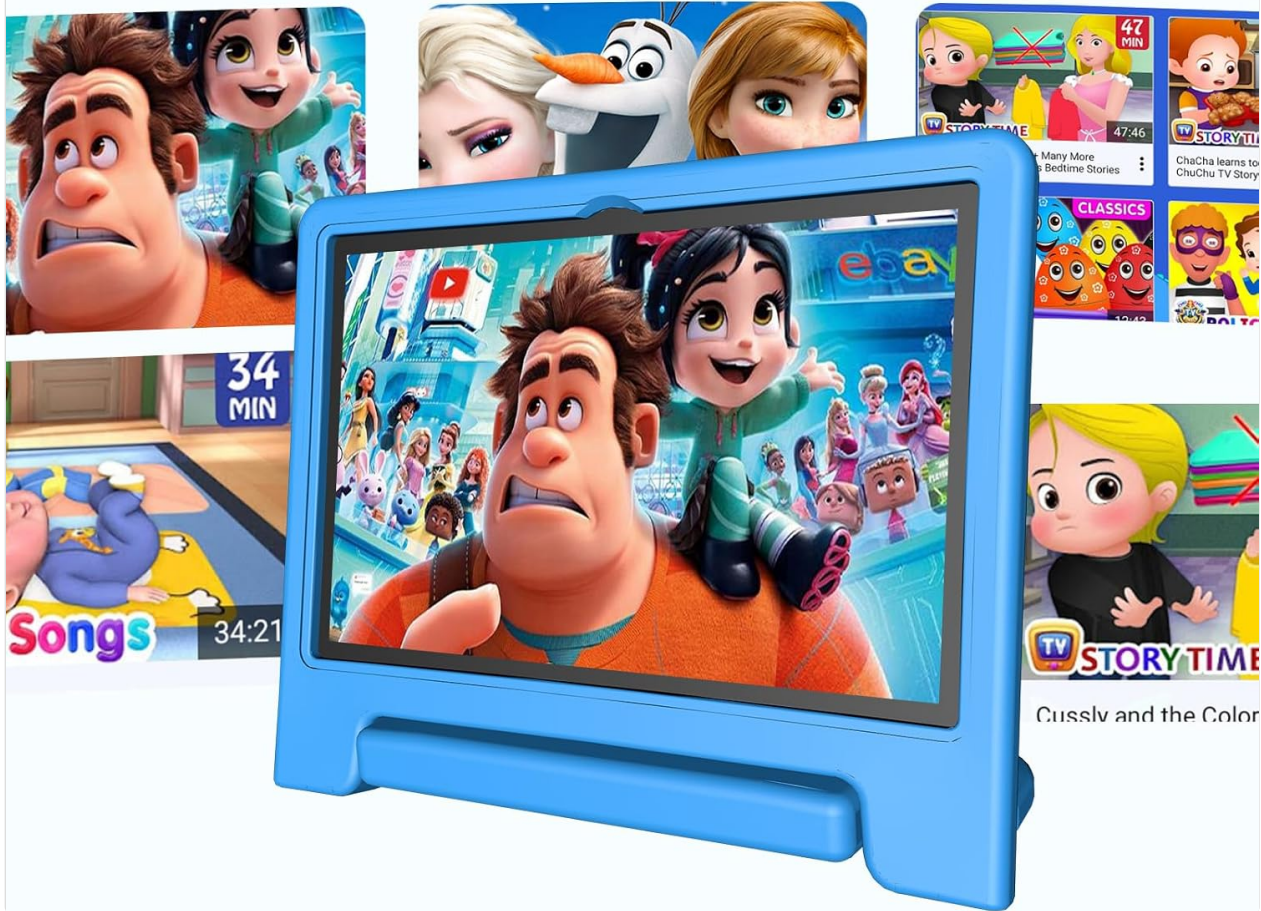
Image 1.1: JREN Tablet for Kids with its protective case, showcasing the display.

Octa-Core CPU | 4GB RAM+4GB Virtual | 64GB ROM