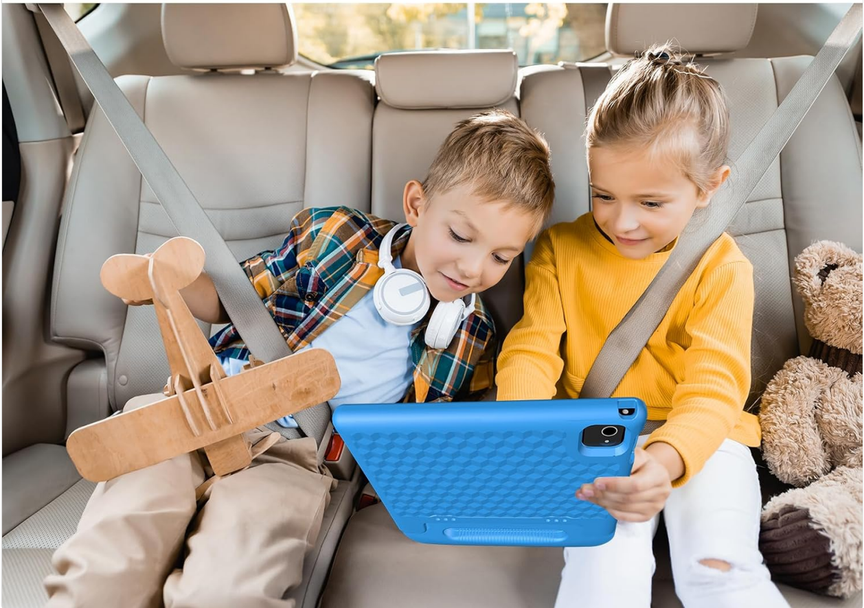
Image 3.1: Visual representation of the tablet's long-lasting battery performance.