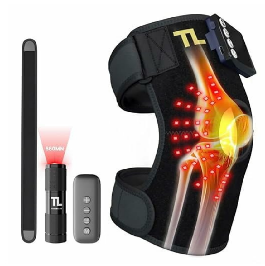
Image: Overview of the ThermoLife 3-in-1 Red Light Therapy Knee Massager and its included accessories.