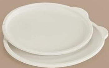
Couvercle de rangement pour réfrigérateur de 20 cm/18cm