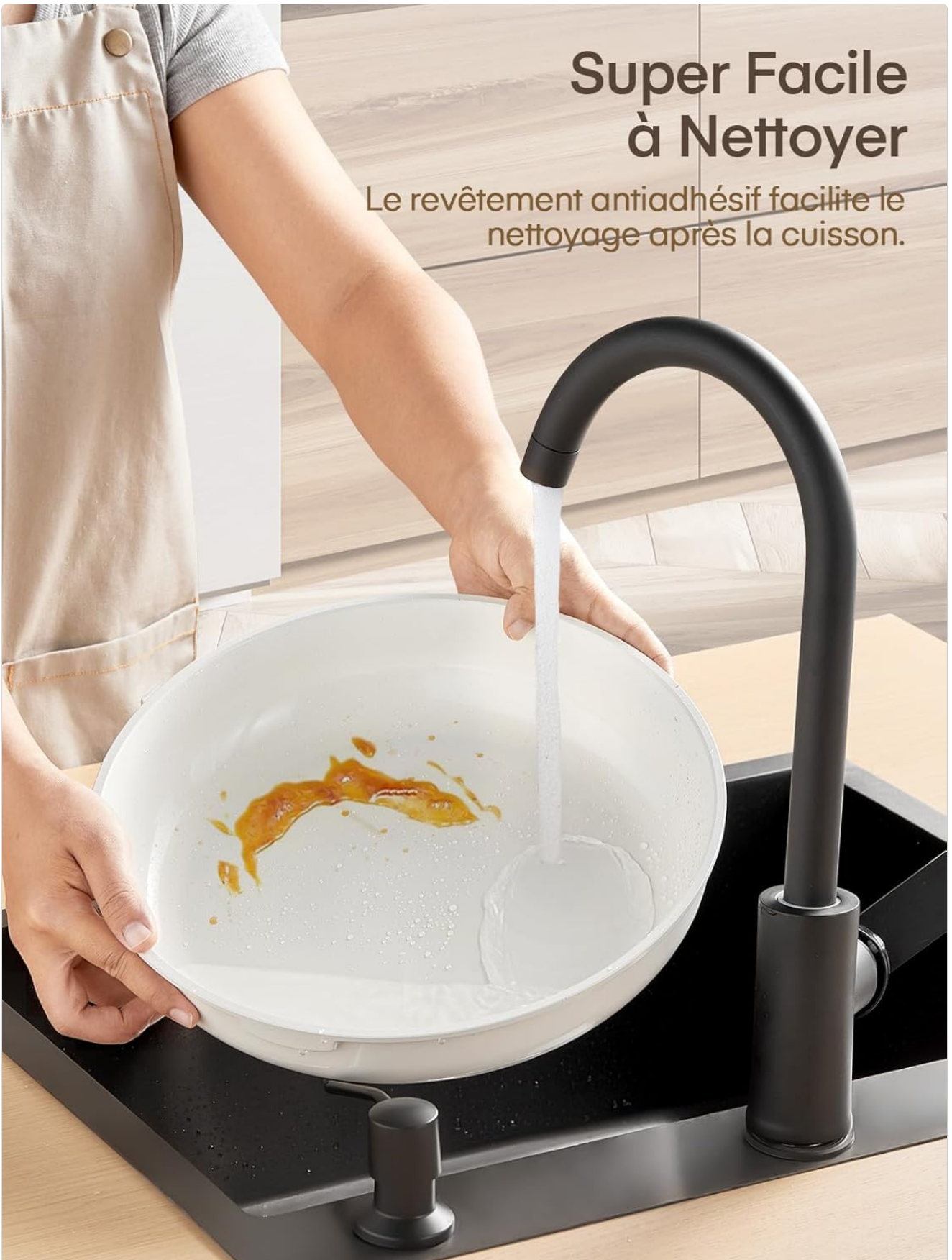
Image: A hand rinsing a frying pan under a faucet, demonstrating how easily food residue washes off the non-stick surface.

Le revêtement antiadhésif facilite le nettoyage après la cuisson.