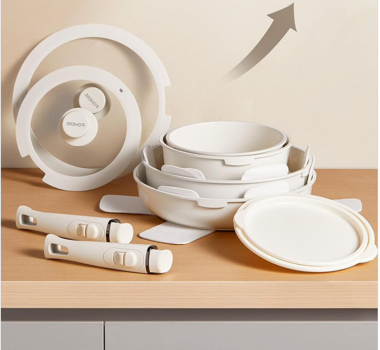
Image: The cookware set stacked neatly, illustrating its space-saving design. An arrow indicates 70% space saving.