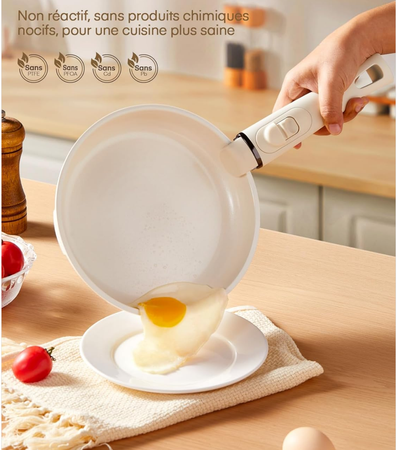
Image: A frying pan with an egg sliding off, demonstrating the professional ceramic non-stick coating. Labels indicate it is free from PTFE, PFOA, lead, and cadmium.