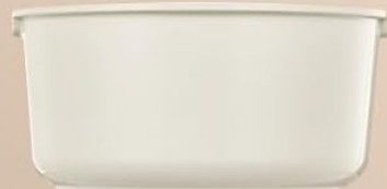
Casserole de 20 cm*1