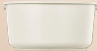
Casserole de 18 cm*1