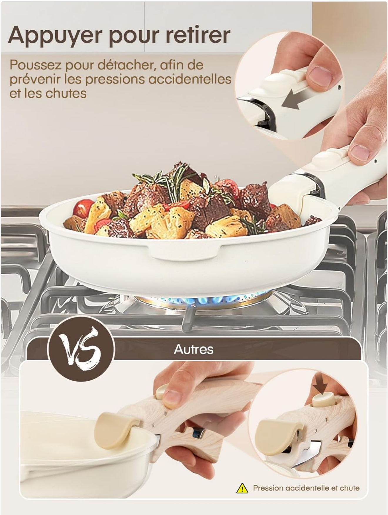
Image: A hand demonstrating how to press the button to detach the handle from a frying pan, emphasizing the secure mechanism to prevent accidental detachment.

Poussez pour détacher, afin de prévenir les pressions accidentelles et les chutes