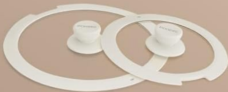
Couvercle en silicone 26cm/20cm