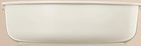
Poêle à frire profonde de 26 cm*1