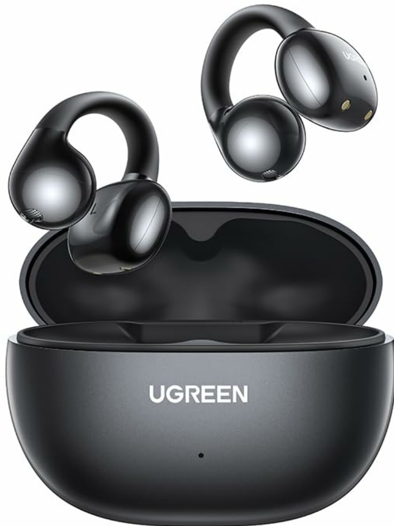
Figure 2.1: Generic HiTune S3 Open Ear Clip Wireless Earbuds and Charging Case.

The package includes the earbuds and their charging case. The earbuds are constructed from PVC and Metal materials.