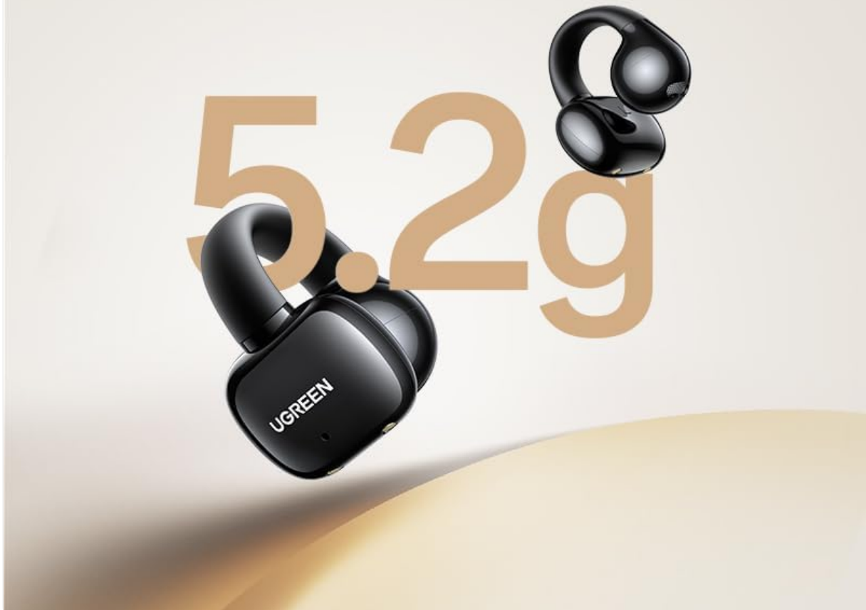
Figure 6.1: The lightweight design of the earbuds, making them easy to maintain and carry.

zero gravity | Cloudy and comfortable | Cloudy and light Stable and unbreakable | Skin-friendly and ear-friendly