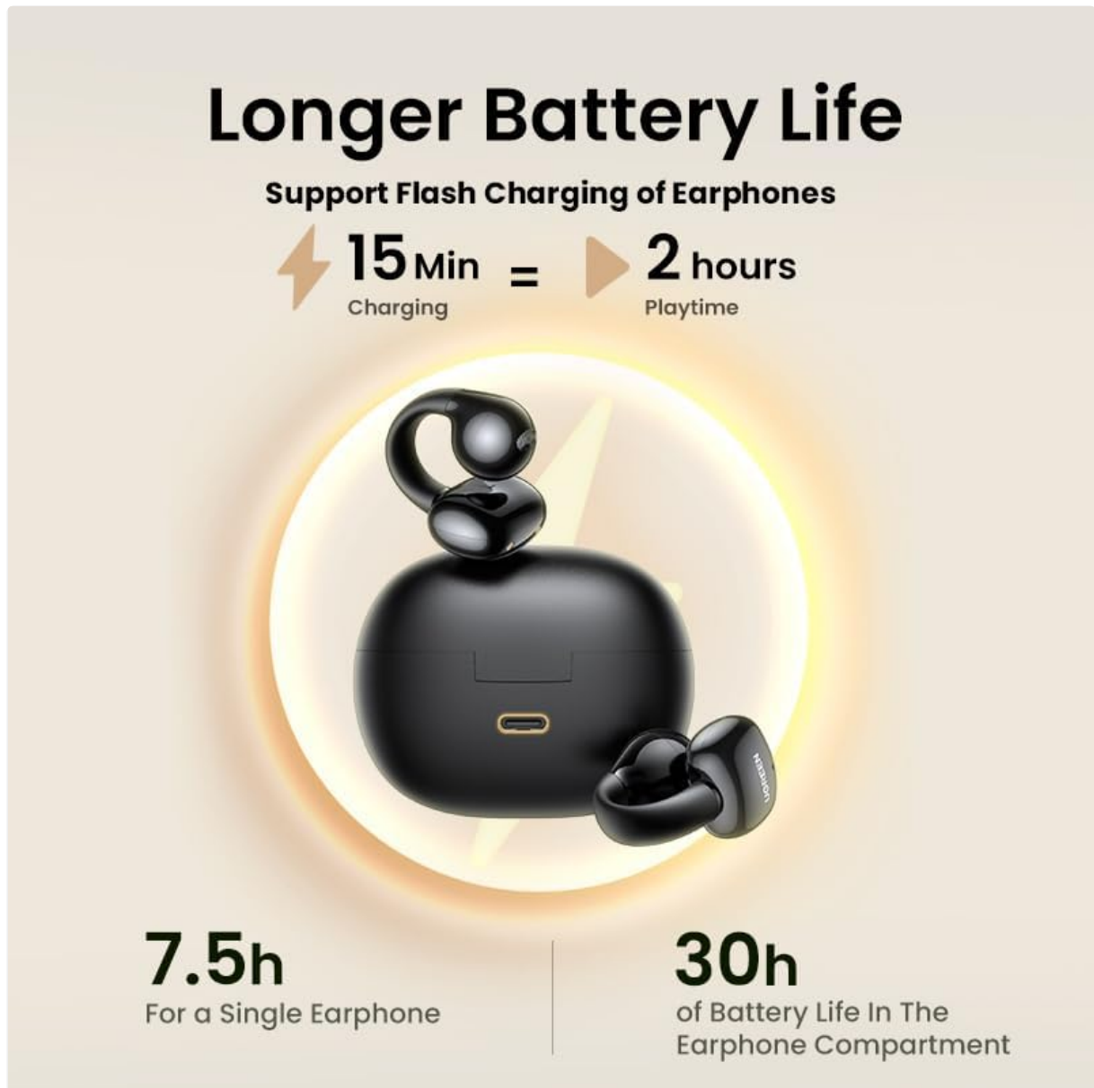
Figure 4.1: Illustration of charging process and battery life. A 15-minute charge can provide approximately 2 hours of playtime, with a single earbud offering up to 7.5 hours and the case providing up to 30 hours of total battery life.