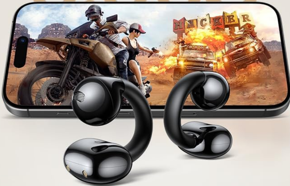
Figure 5.3: Earbuds providing stable and accurate audio synchronization for an enhanced experience.