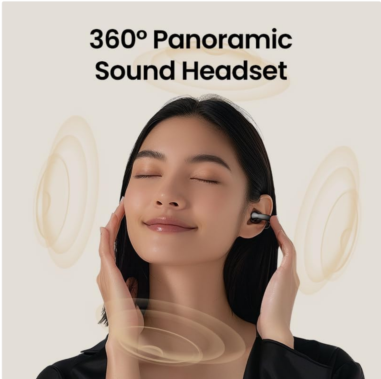
Figure 5.1: Example of wearing the open-ear clip earbuds for a secure fit.