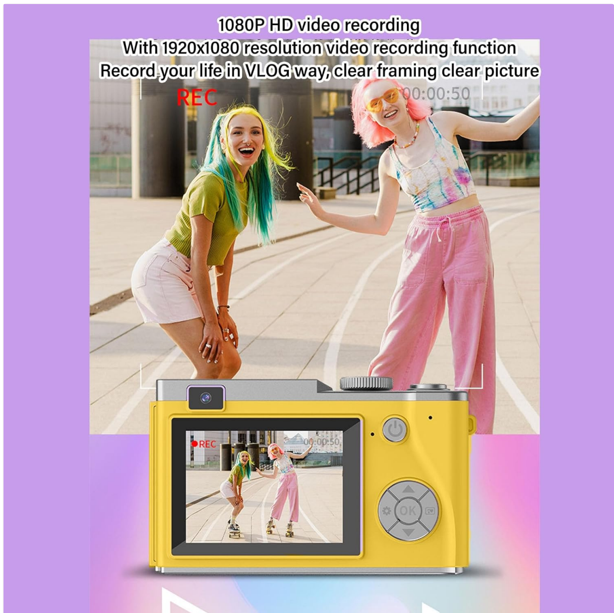
The camera screen showing 1080P HD video recording in progress.