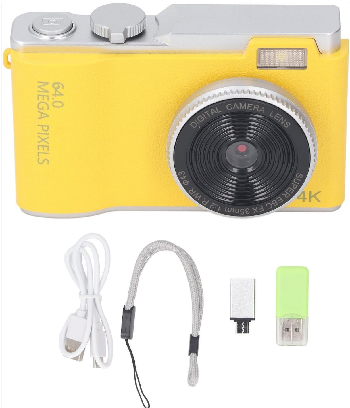
Image showing the Zopsc Digital Camera and its included accessories.