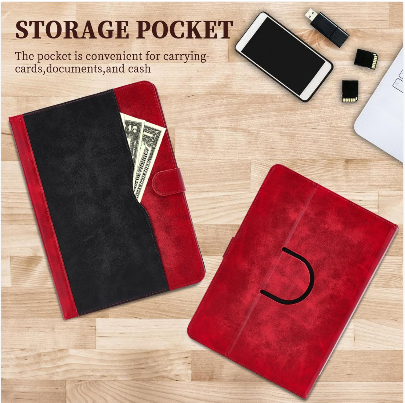
Image: The tablet case open, displaying the integrated storage pocket with cards and cash placed inside, demonstrating its utility.

The pocket is convenient for carrying cards, documents, and cash