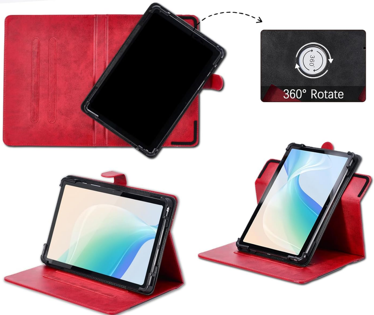
Image: A series of illustrations showing the tablet rotating 360 degrees and being set up in various stand positions for different viewing angles.

Supports multiple viewing angles with 360° free rotate