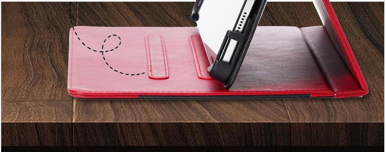
Image: The tablet case folded into a stand, with a close-up of the anti-slip stripe on the interior, ensuring the tablet remains stable at various angles.