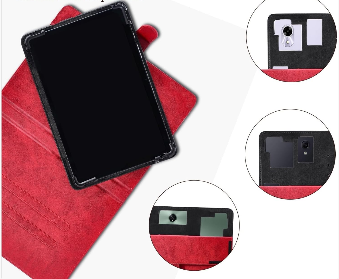
Image: Close-up of the case's camera cutouts. The case features multiple pre-cutouts to accommodate different camera positions on various tablets, ensuring camera functionality.

The 3 pre-cutouts can be used by tablets with different camera positions