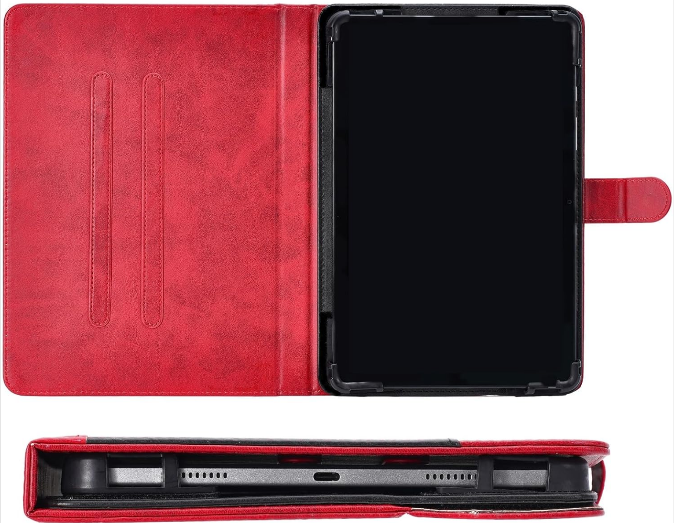
Image: The tablet case open, with a tablet positioned to be inserted. This illustrates how to check compatibility and ensure a proper fit for your device.

Please kindly check your tablet size before purchase as shown