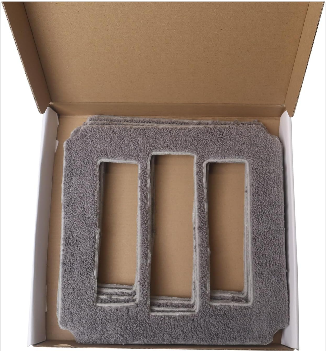
Image showing the interior of the HUTT Cleaning Cloth box, revealing four gray microfiber cleaning pads neatly stacked.