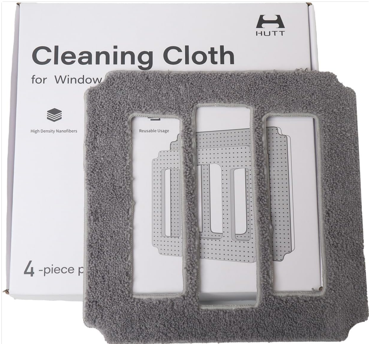
Image of a single HUTT W9 cleaning pad placed on top of its product box, highlighting its design and texture.