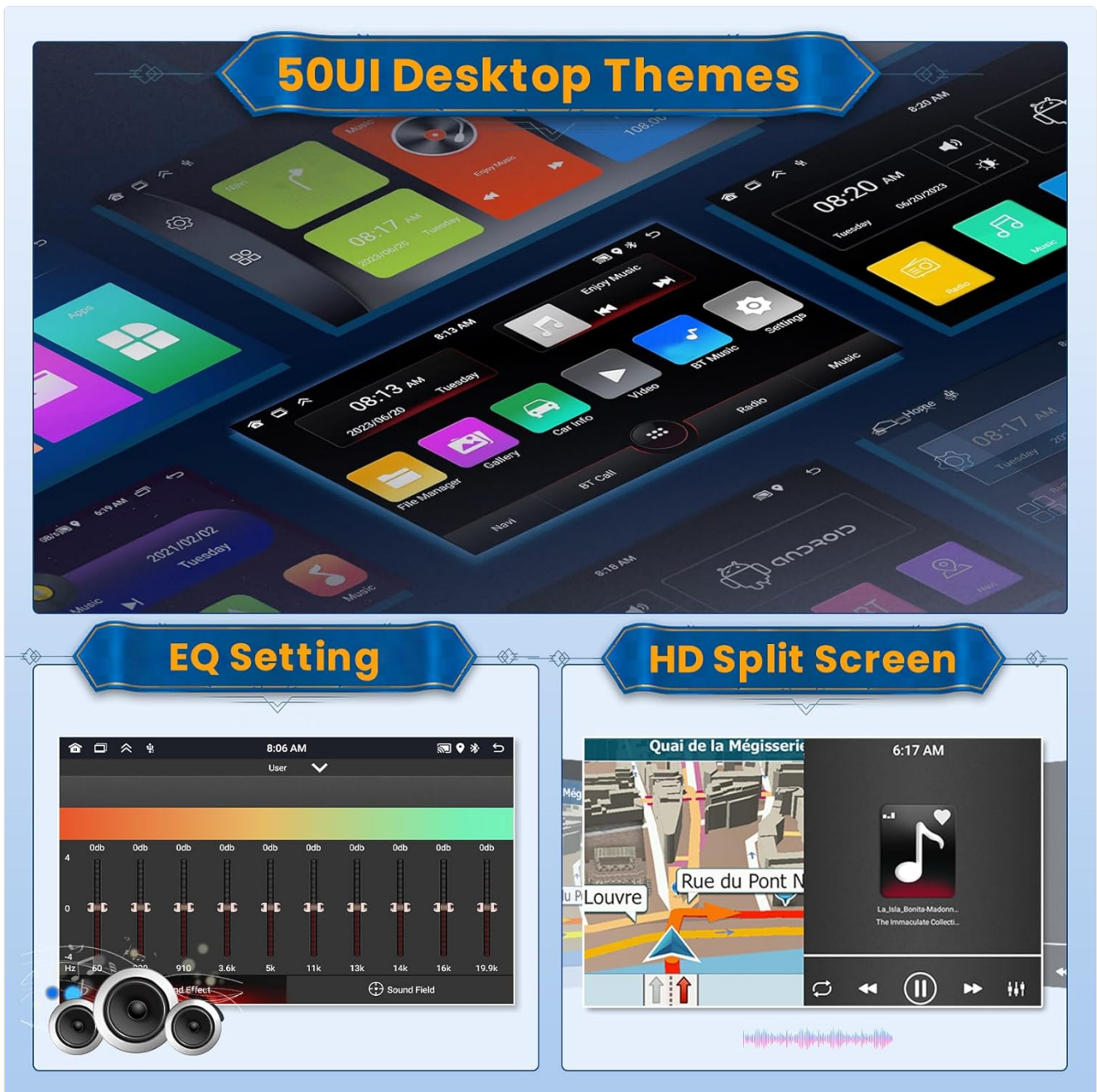
Image: Demonstrates the customizable UI themes, detailed EQ settings, and the practical split-screen function.