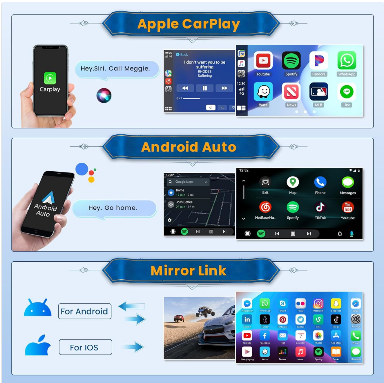
Image: Visual representation of Apple CarPlay and Android Auto functionality, including navigation and media playback.