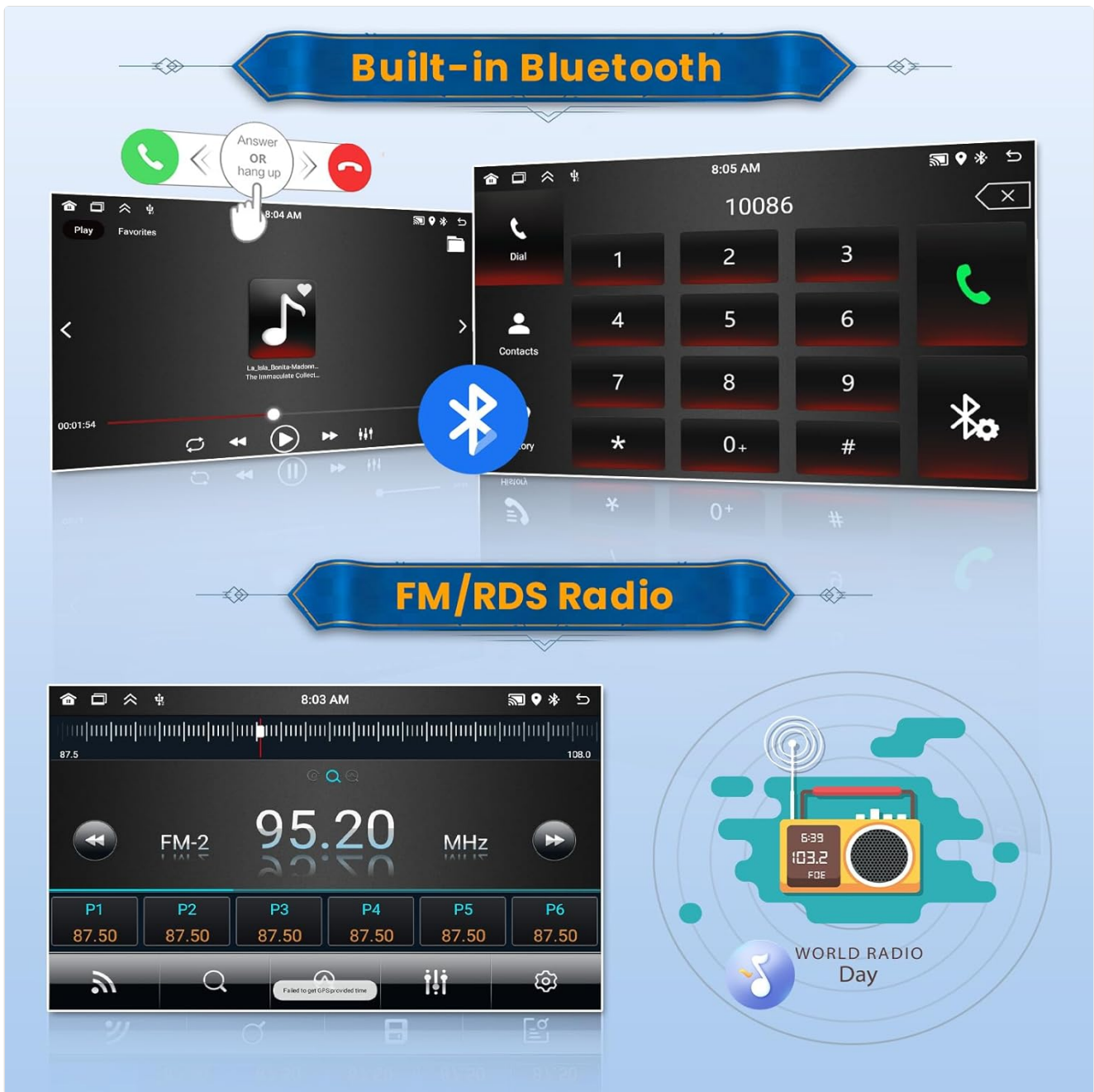
Image: Bluetooth interface for hands-free calling and music streaming, and the FM/RDS radio display.