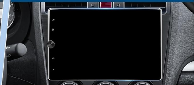
Image: Comparison of the car dashboard before and after installation, highlighting the integrated 10.4-inch rotatable touch screen.