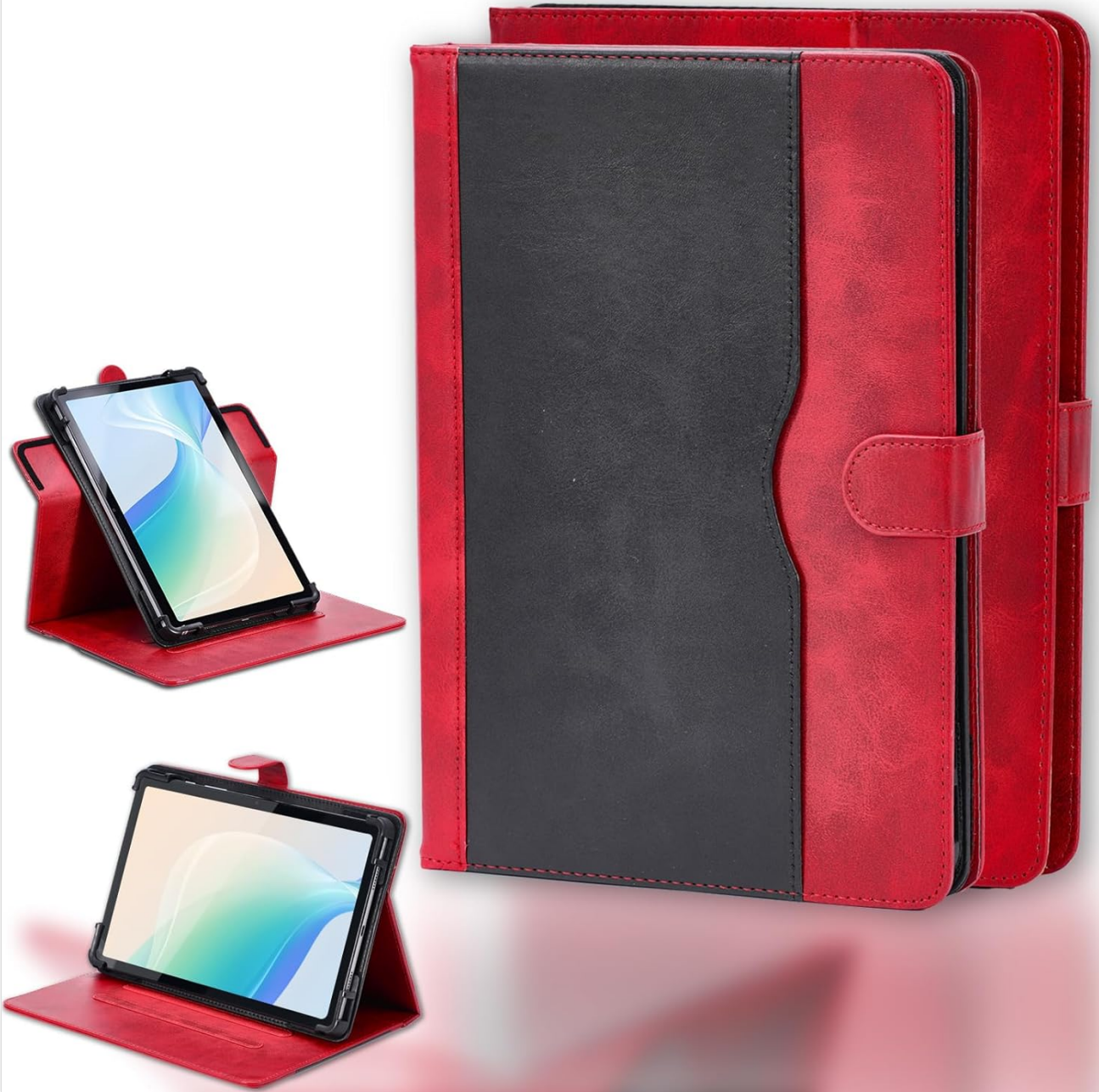
Image: The case can be folded into a stand, providing multiple viewing angles for your tablet. The anti-slip strip helps maintain stability.