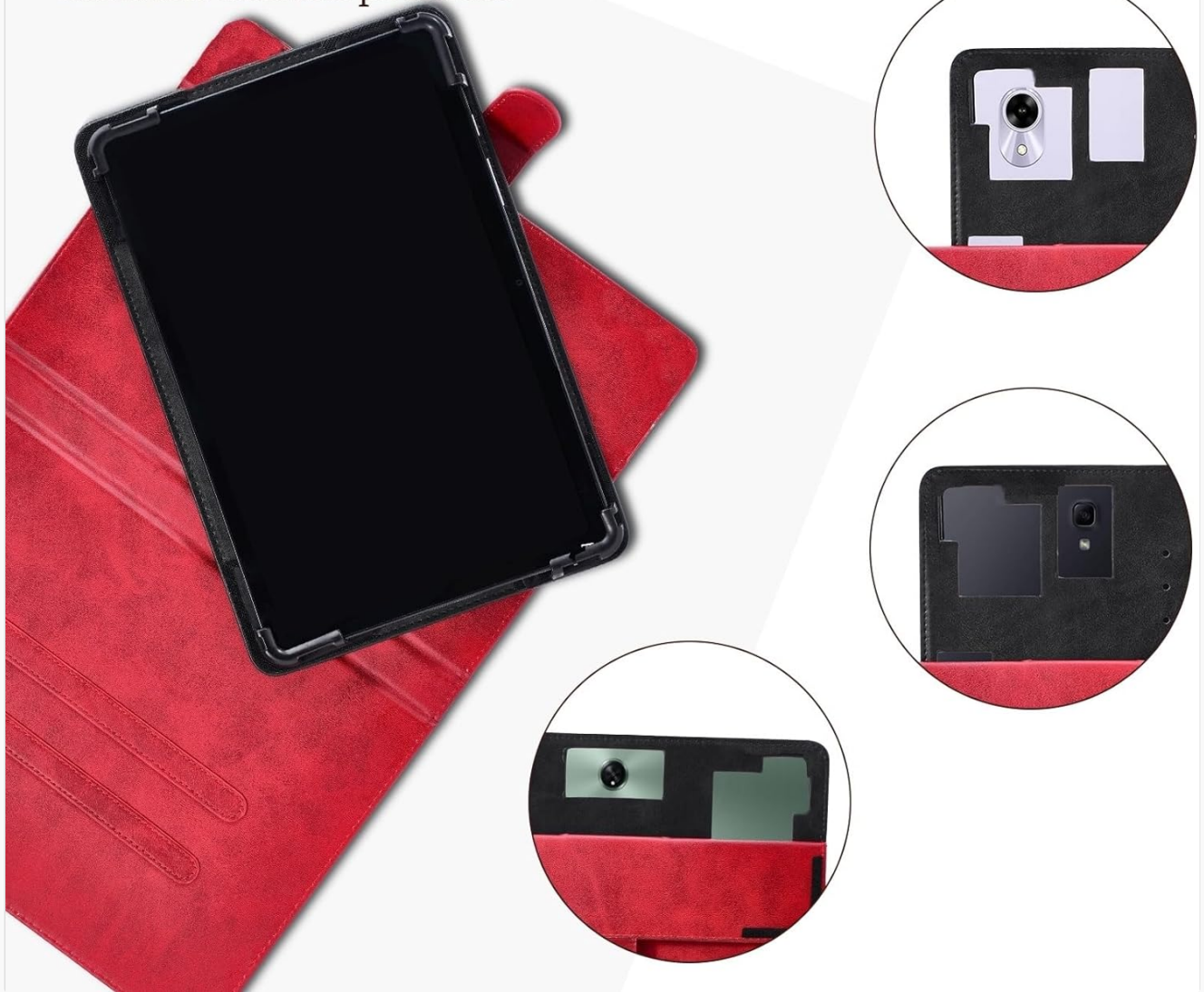
Image: The tablet case features multiple camera cutouts to ensure compatibility with various tablet camera placements. Verify your tablet's camera aligns with one of these openings.

The 3 pre-cutouts can be used by tablets with different camera positions