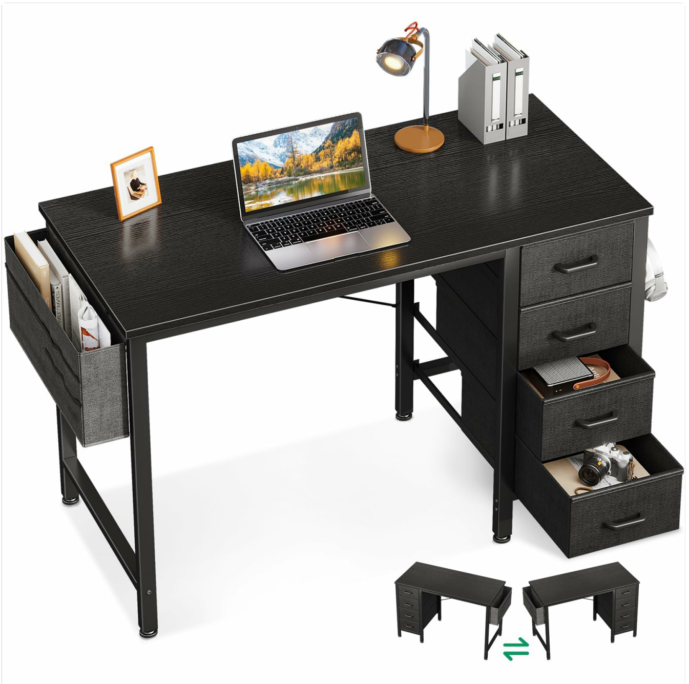
Figure 3: Casaottima desk in use. This image shows the desk set up with a laptop, demonstrating its functionality as a computer desk and the use of its storage features.