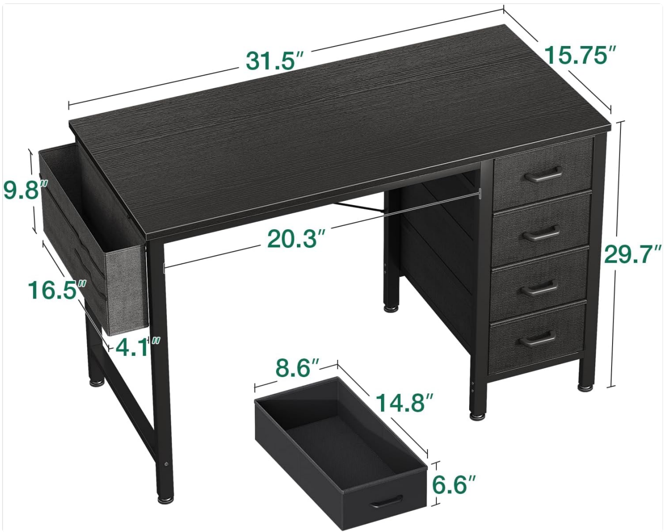
Figure 1: Desk dimensions and component overview. This image illustrates the overall size of the desk (31.5"L x 15.75"W x 29.7"H) and the individual dimensions of the fabric drawers and side storage bag, aiding in assembly planning and space allocation.