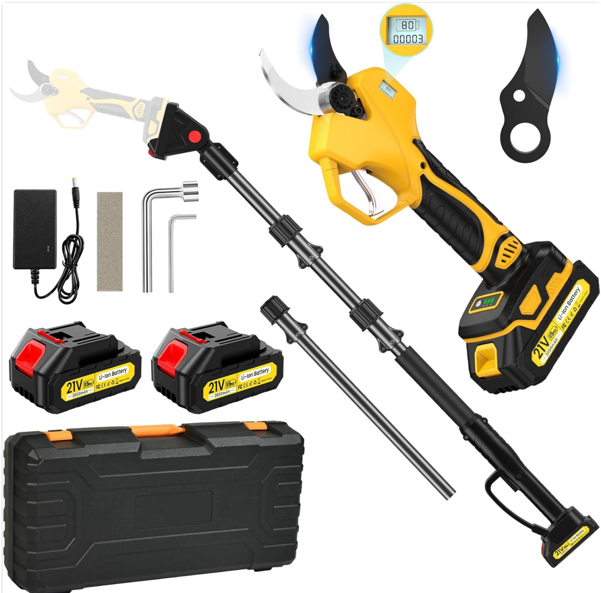
Image: Complete package contents including the electric pruning shears, two batteries, charger, tools, replacement blade, telescopic pole, and carrying case.