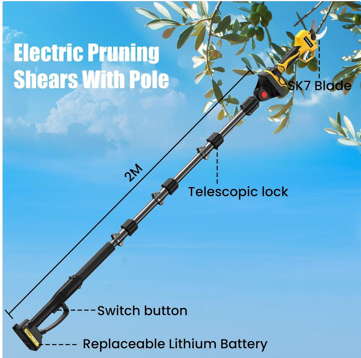
Image: Detailed view of the electric pruning shears attached to the extension pole, highlighting the SK7 blade, telescopic lock, switch button, and replaceable lithium battery location.