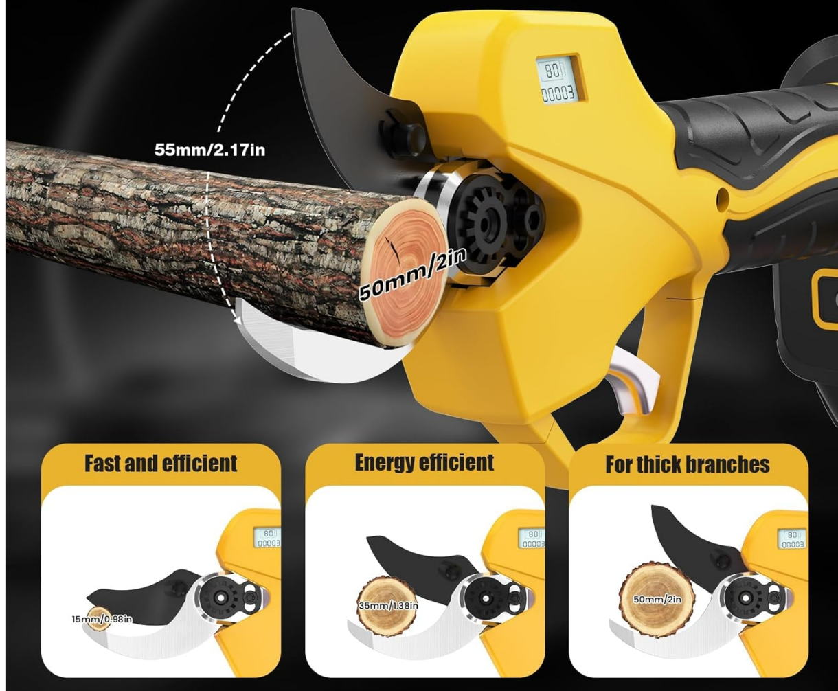
Image: Close-up of the pruning shears blades demonstrating the three adjustable cutting opening sizes: 15mm for fast and efficient cuts, 35mm for energy efficiency, and 50mm for thick branches.

Update 3 gear modes for specific applications