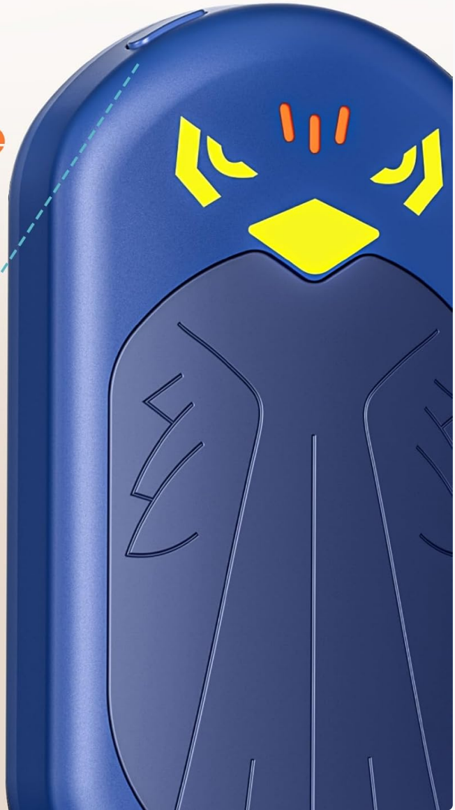
Image: This image highlights the simple one-button operation for turning the device on/off and adjusting heat levels.