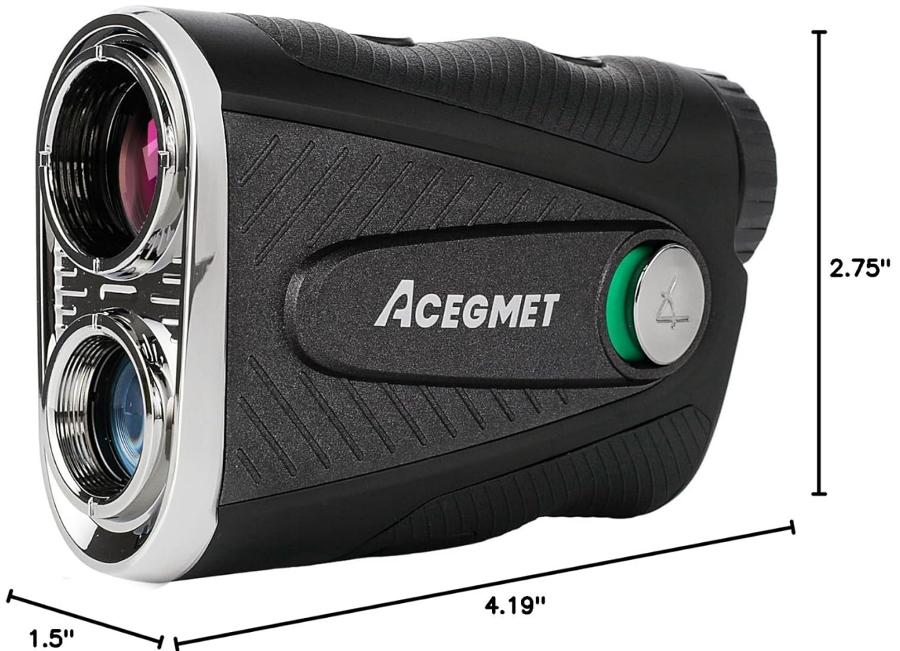
Image: Technical drawing showing the length, width, and height dimensions of the ACEGMET PF2C Golf Rangefinder.