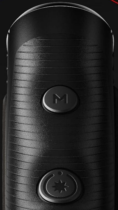
Image: The ACEGMET PF2C Golf Rangefinder shown with its protective soft case, magnetic belt clip, and other accessories.