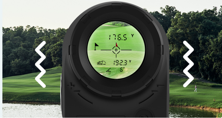
Image: The rangefinder's display showing a flag target locked at 176.5 yards, demonstrating the fast flag-lock feature.