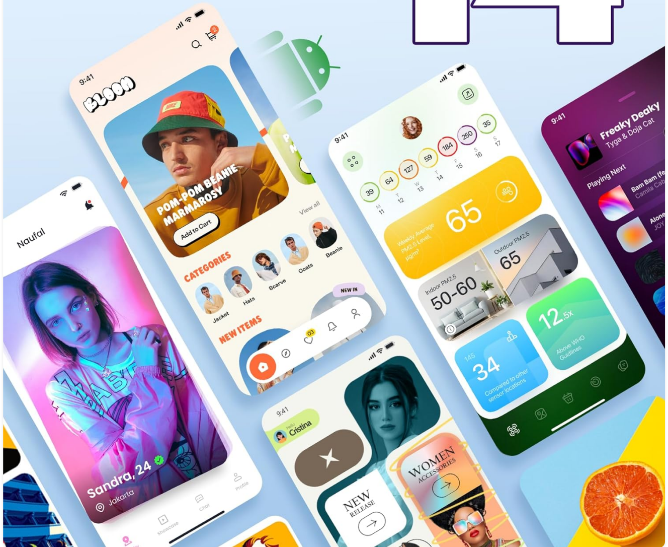
Figure 3.1: Android 14 operating system interface.