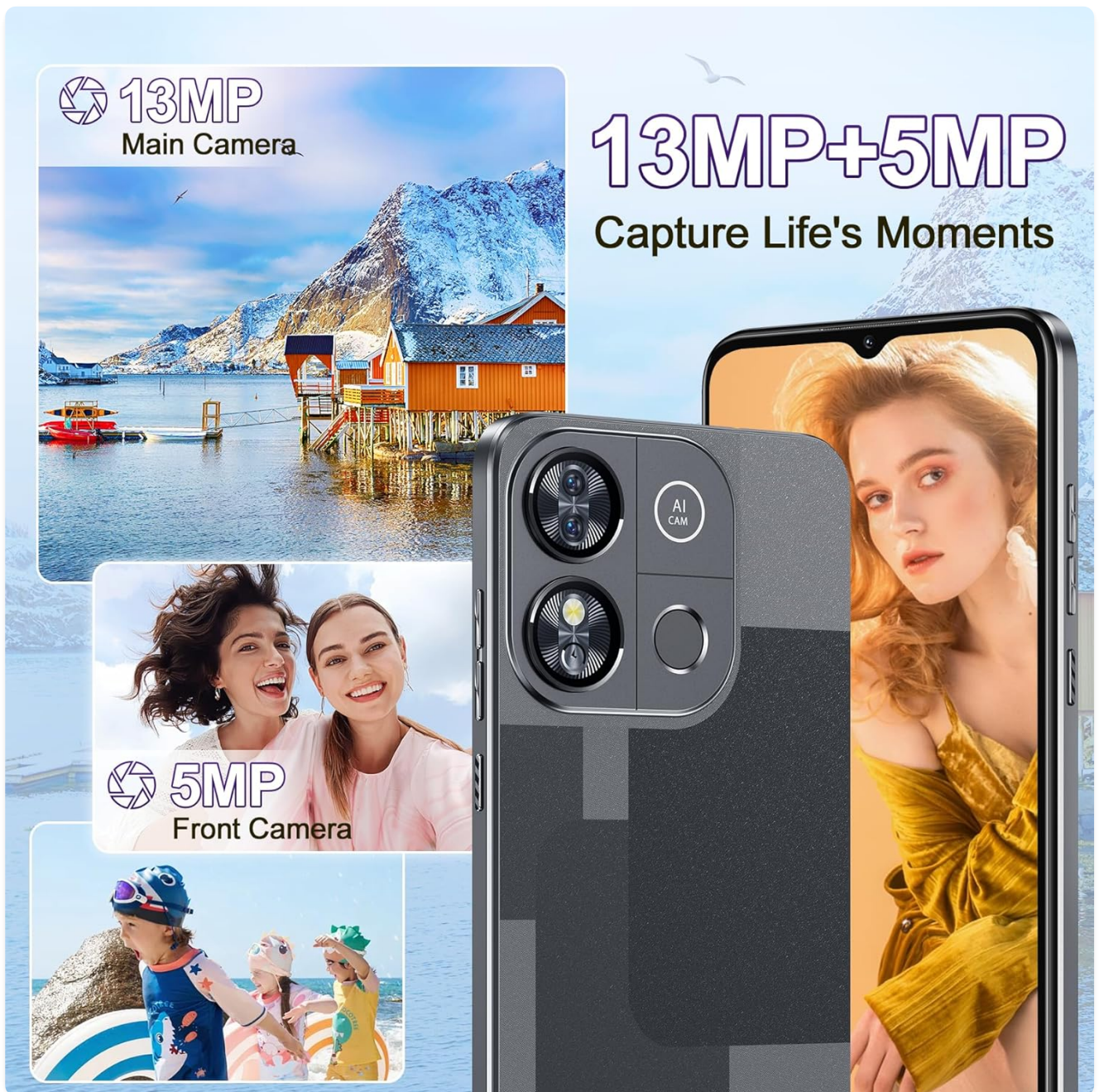
Figure 4.1: Main and front camera details.