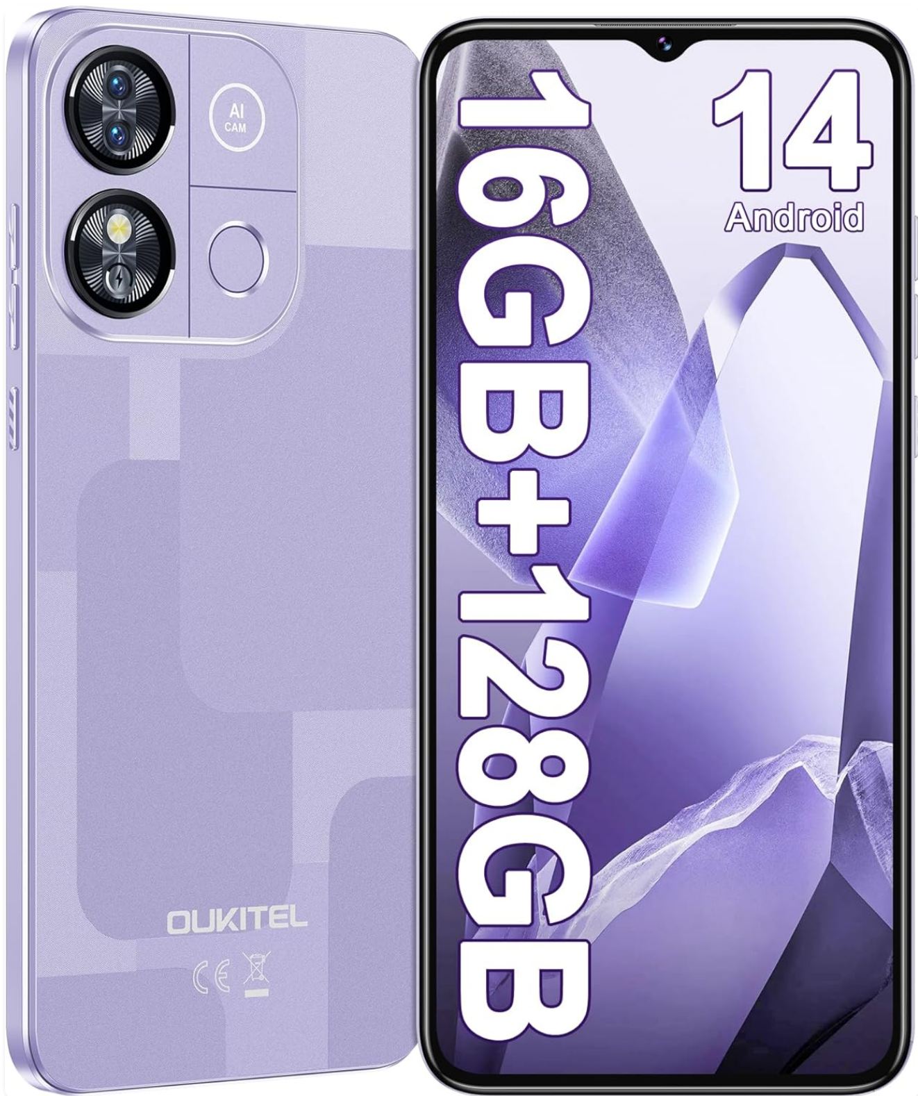
Figure 1.1: OUKITEL C57 Pro Mobile Phone (Purple variant).