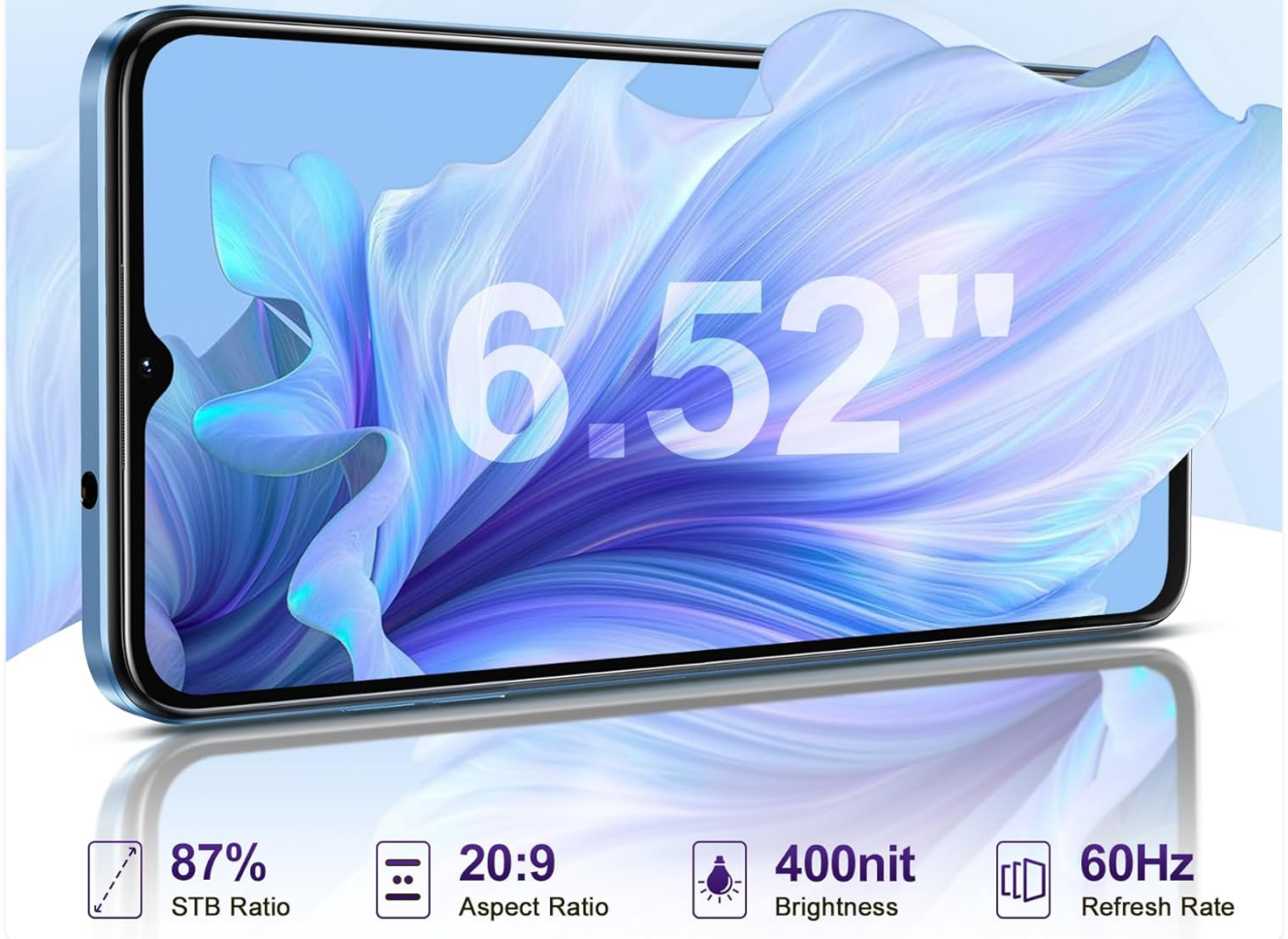
Figure 6.4: The 6.52-inch HD display.