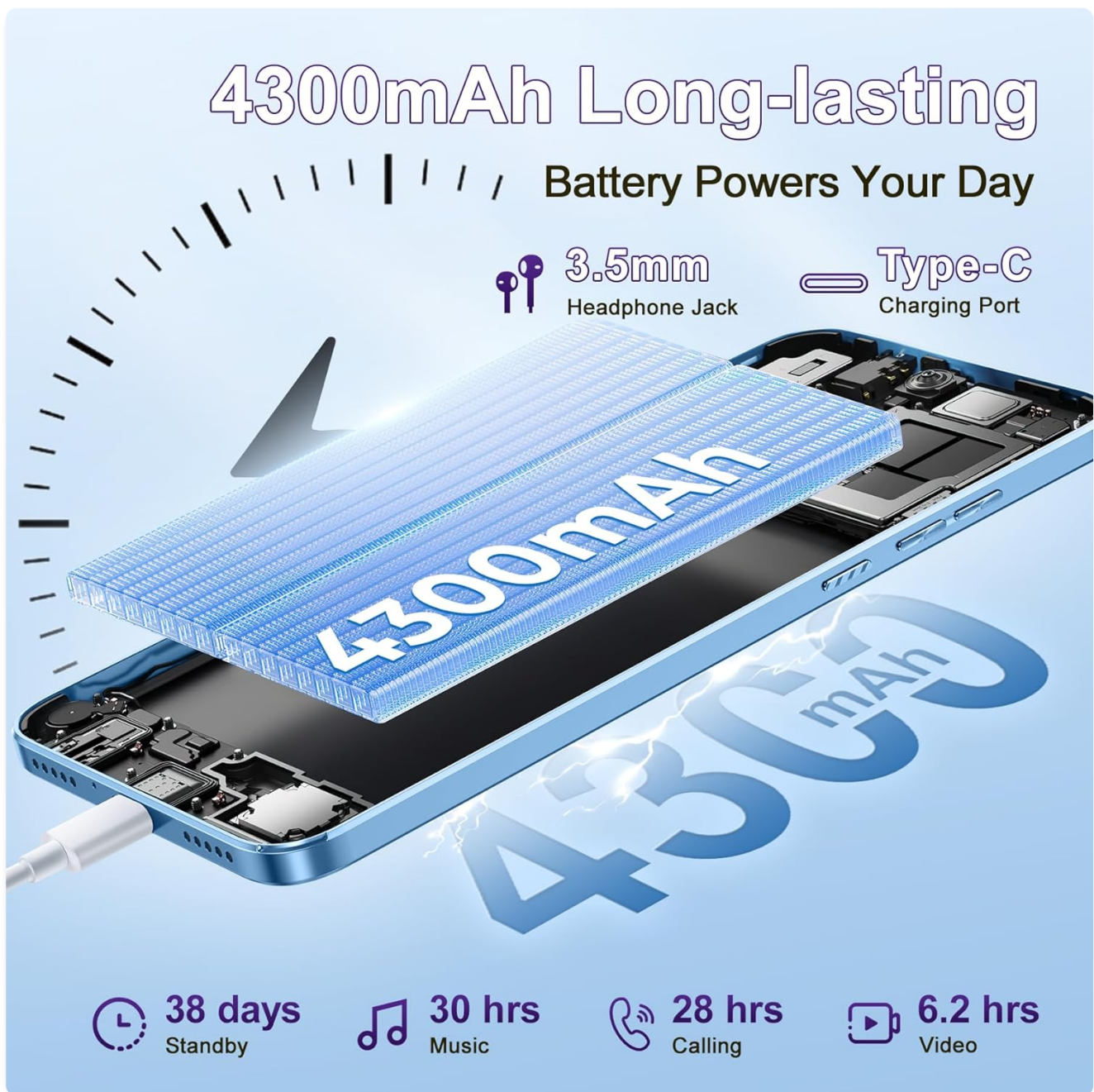
Figure 5.1: Battery capacity and estimated usage times.