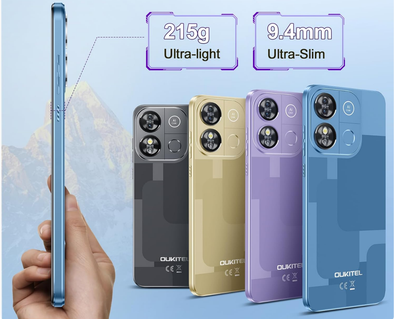
Figure 6.3: Dimensions and weight of the OUKITEL C57 Pro.