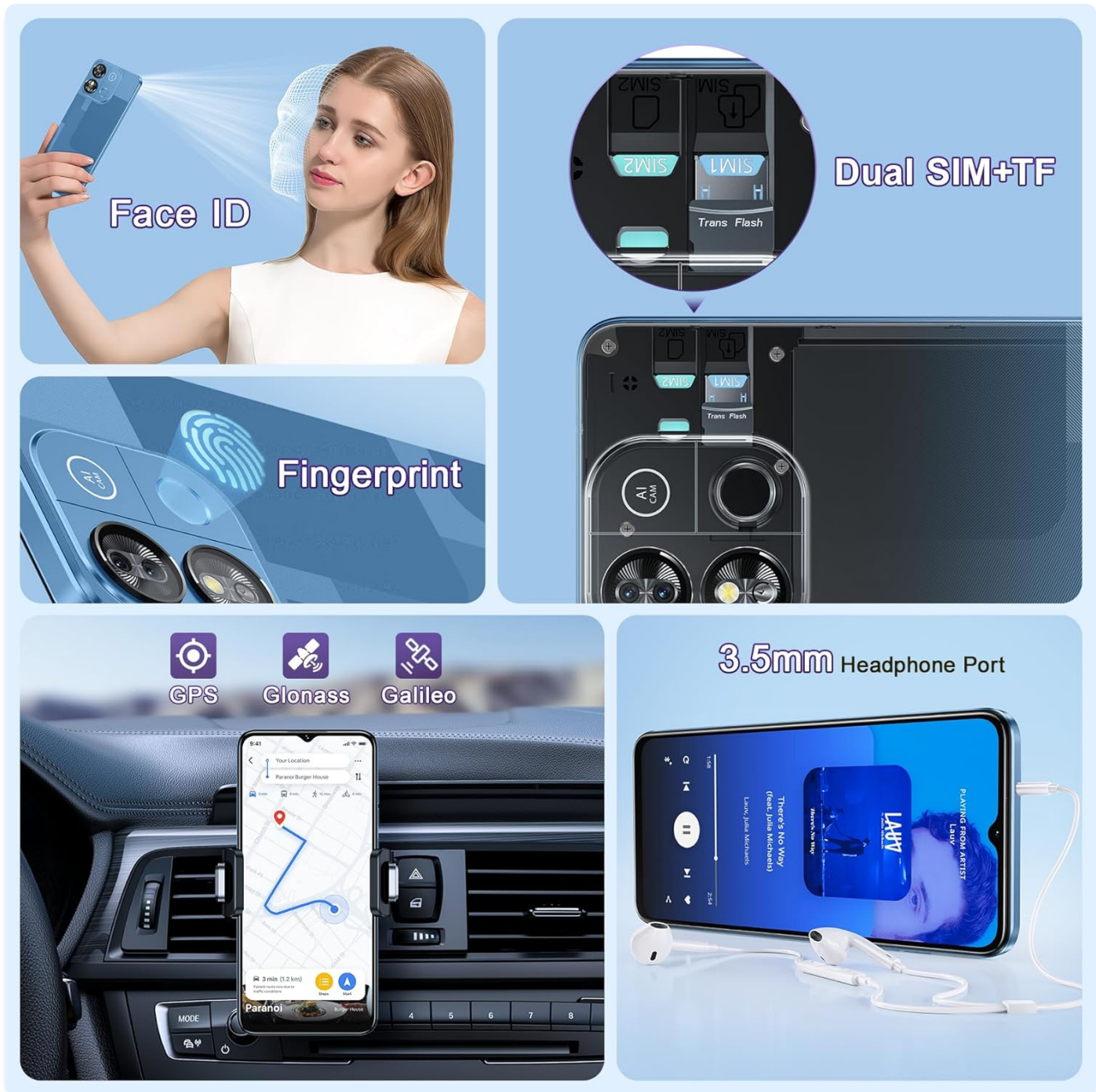
Figure 2.2: Illustration of Dual SIM and TF card installation.