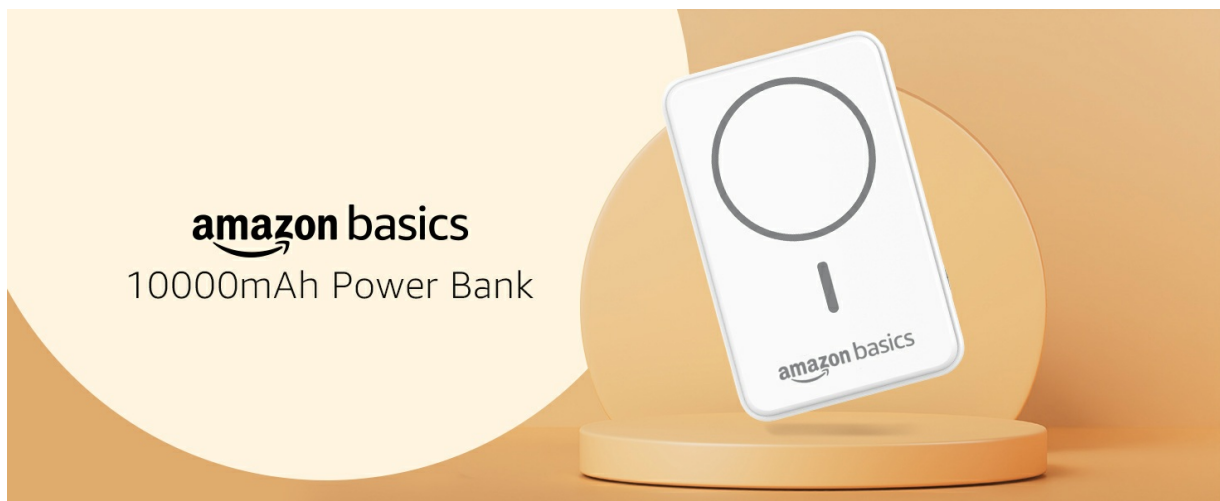
Image: Banner displaying the Amazon Basics 10000mAh Power Bank logo and product.

Thank you for choosing the Amazon Basics 10000mAh 20W Fast Charging Power Bank with 15W Wireless Output. This manual provides essential information for the safe and efficient use of your device. Please read it thoroughly before operation and retain it for future reference.