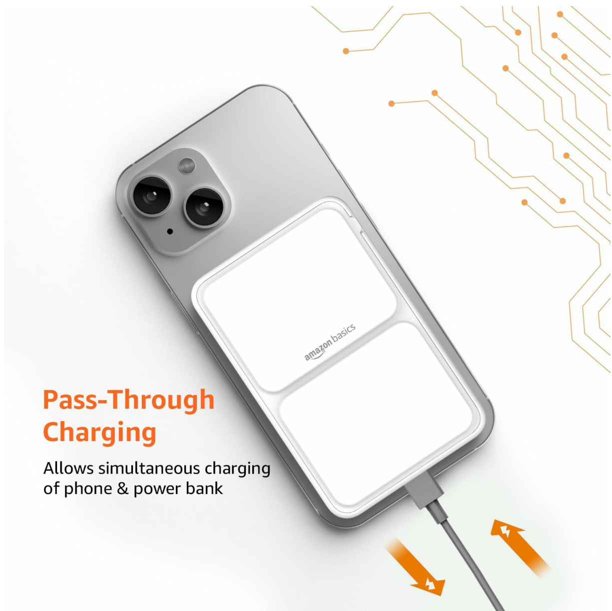
Image: A smartphone connected to the power bank, which is itself connected to a charging cable, illustrating simultaneous charging.