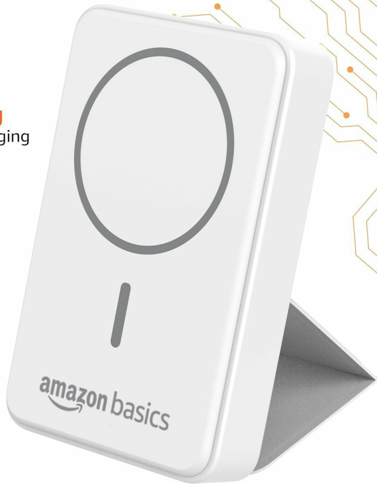
Image: Illustration highlighting safety features such as protection against short-circuit and overcharging.