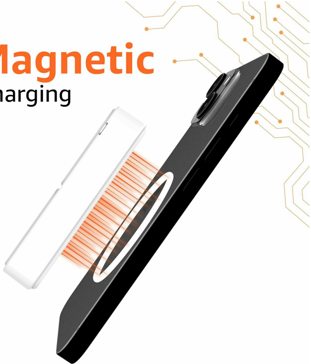
Image: An illustration demonstrating the magnetic alignment for wireless charging between the power bank and a smartphone.