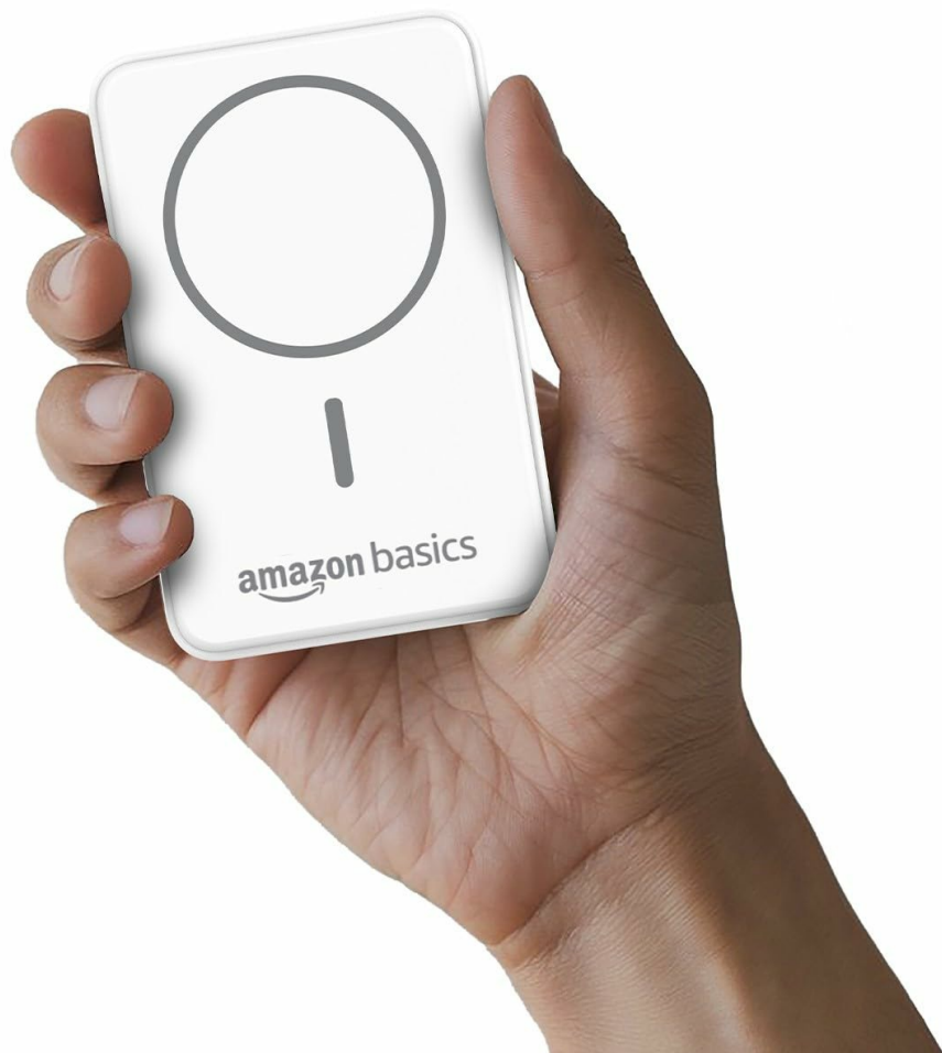
Image: A hand holding the white Amazon Basics 10000mAh Power Bank, showcasing its compact size and magnetic charging area.