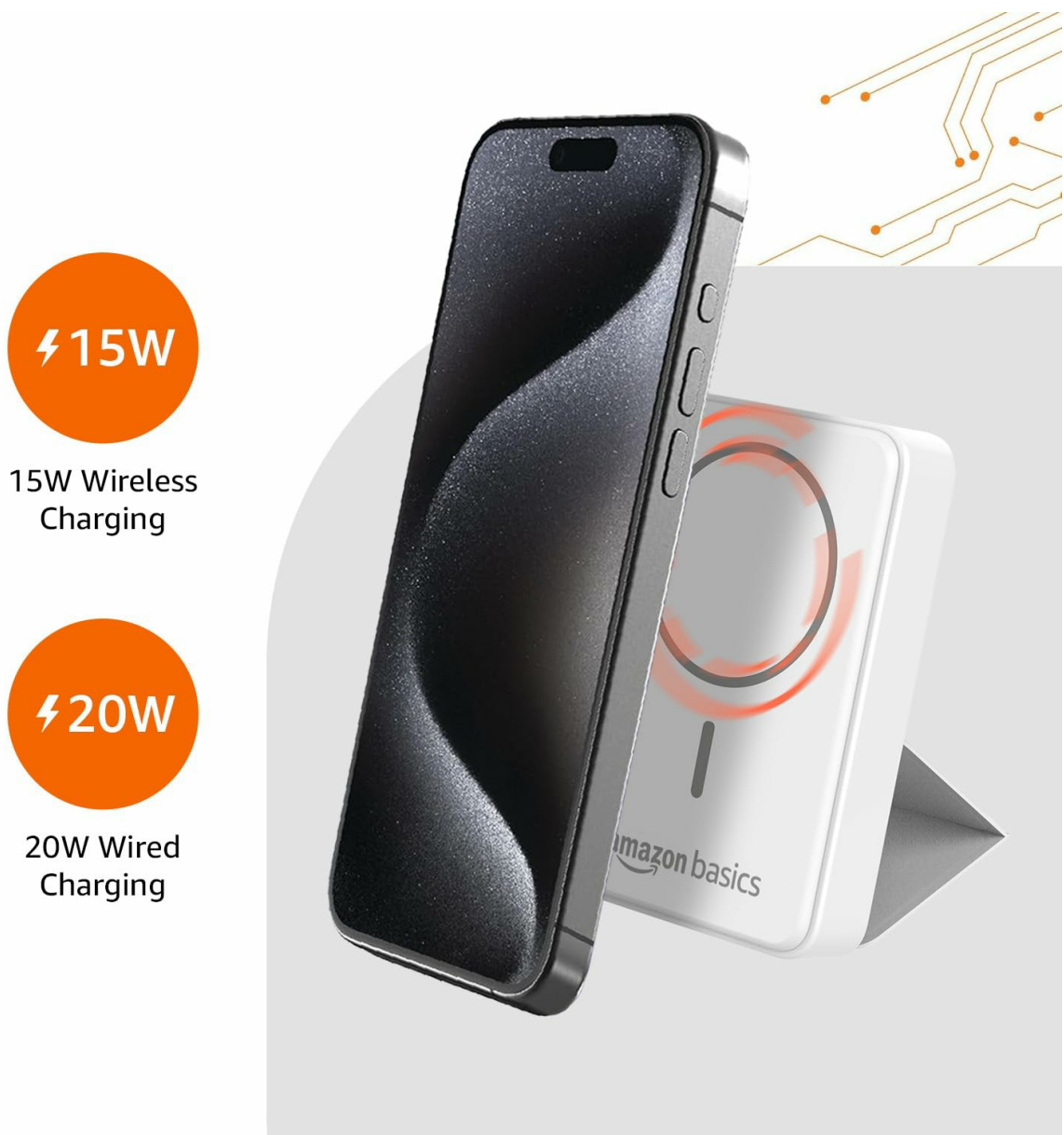
Image: Visual representation of the power bank's 15W wireless charging and 20W wired charging capabilities.