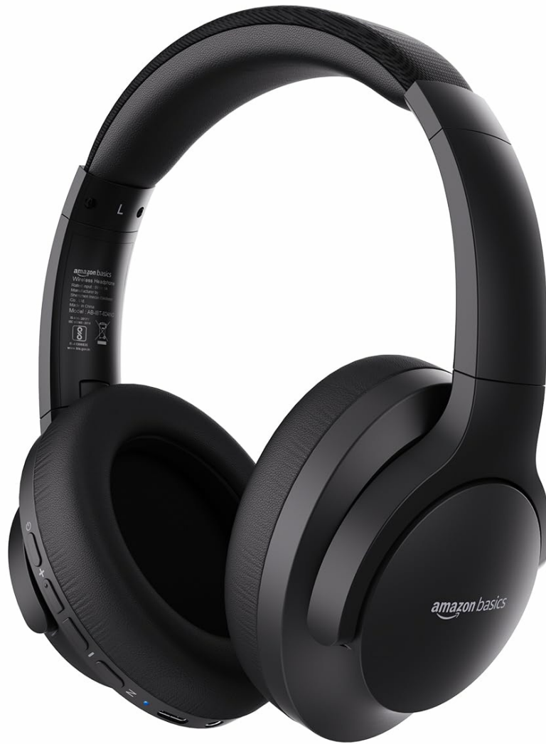
Image: The Amazon Basics Pro Series Wireless Noise Cancelling ANC Over Ear Headphone in black, showcasing its sleek design.