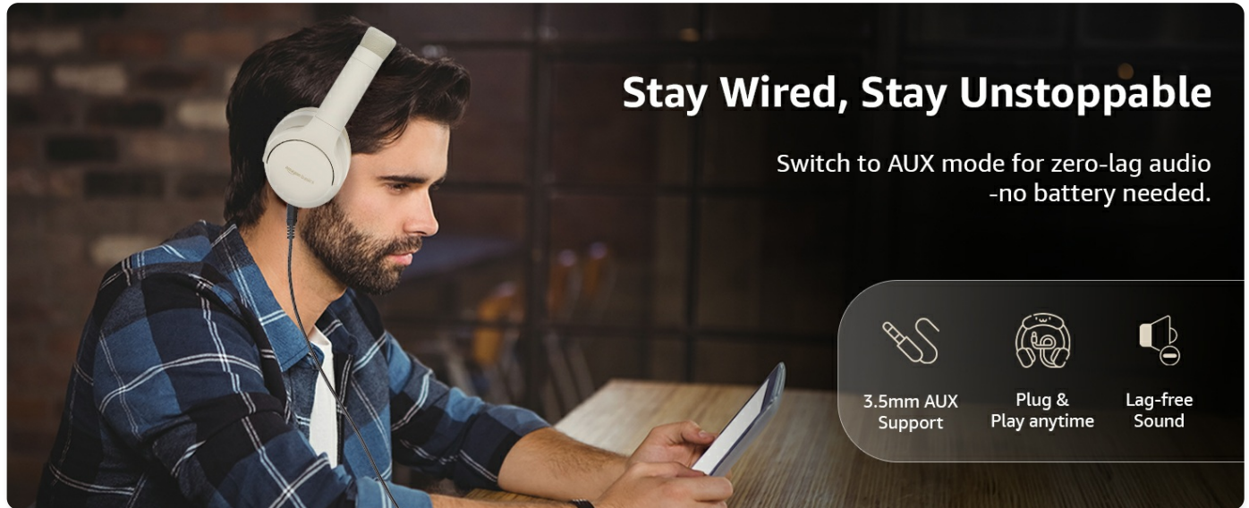
Image: A user demonstrating the wired AUX connection, emphasizing lag-free audio without needing battery power.

For a wired connection, plug the 3.5mm AUX cable into the headphone's AUX port and the other end into your audio device's 3.5mm jack. This mode does not require battery power.