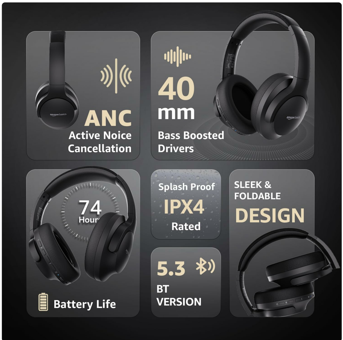
Image: An infographic highlighting key features, including the sleek and foldable design of the headphones for easy storage.