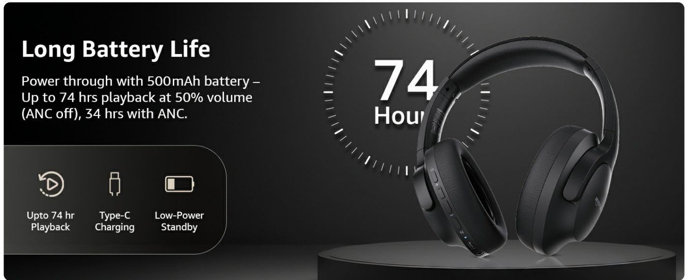
Image: An illustration highlighting the long battery life of the headphones, indicating up to 74 hours of playback.

A full charge provides up to 74 hours of playback at 50% volume with ANC off, or 34 hours with ANC on.