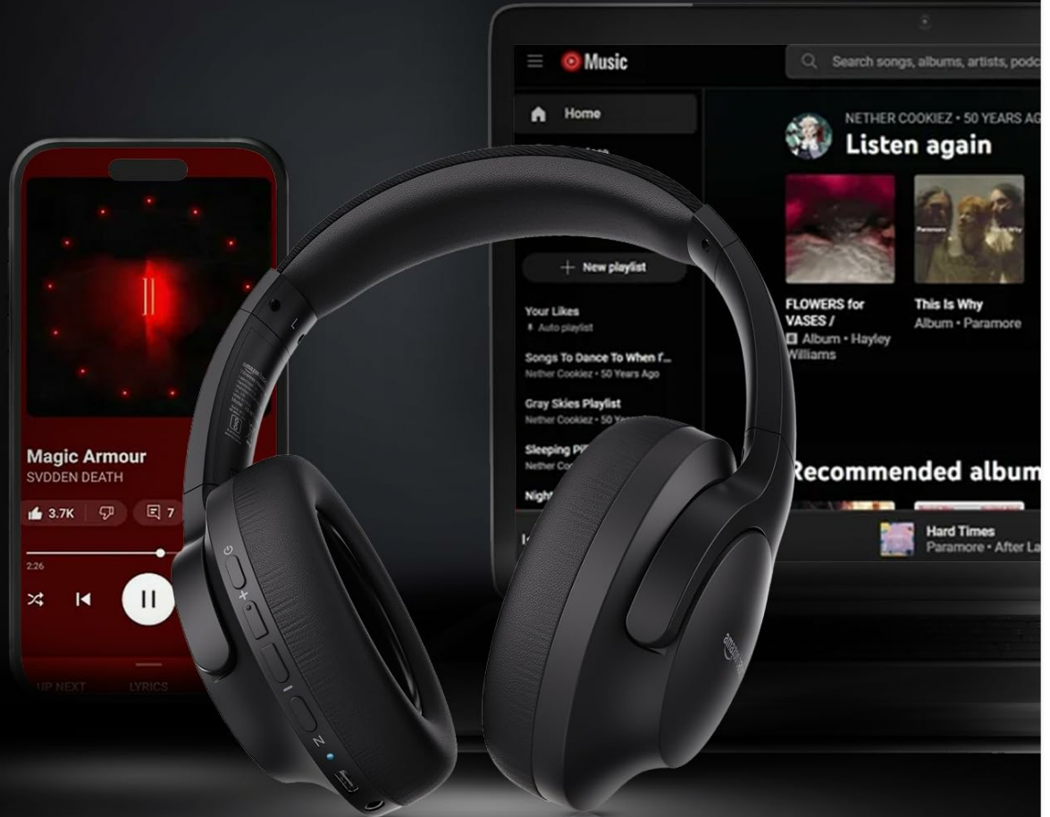
Image: The headphones shown connected to both a smartphone and a laptop, illustrating the multi-pairing capability.

Dual pairing with a stable 10m Bluetooth range for uninterrupted multitasking.