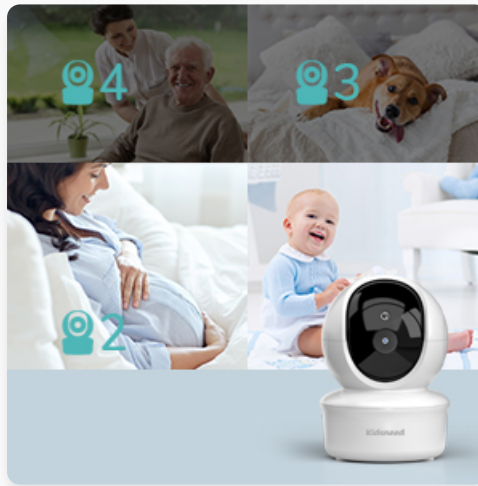
Image: A graphic illustrating the capability to connect and monitor up to four cameras simultaneously, showing different scenarios like monitoring a baby, an elderly person, or a pet.