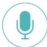
Two Way Communication