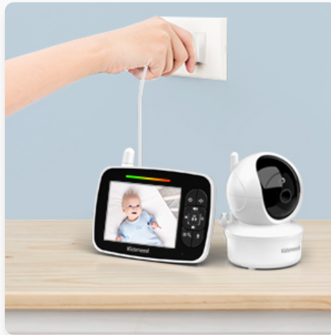
Image: A hand plugging the power adapter into the parent unit, illustrating the charging process.

Before first use, fully charge the parent unit for approximately 8 hours. Connect the small end of the power adapter to the parent unit's charging port and the other end to a power outlet.