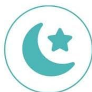
Infrared Night Vision