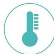
Room Temperature Display