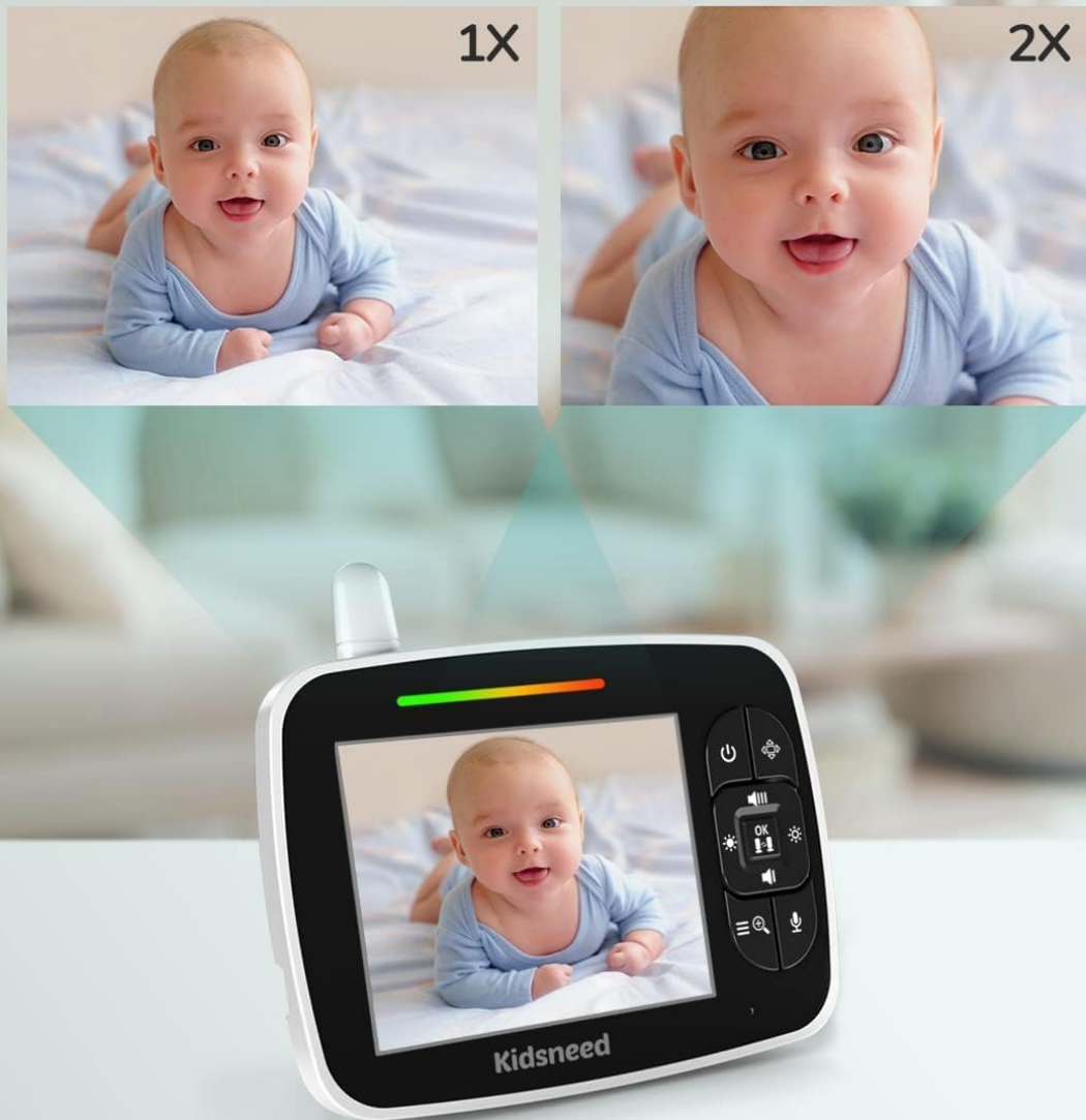
Image: A visual comparison on the parent unit screen, showing a baby at 1x zoom and then at 2x zoom, illustrating the digital zoom function.