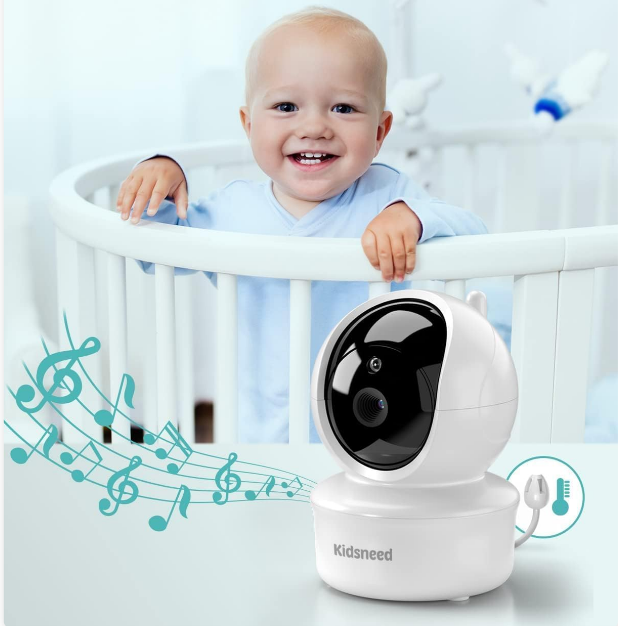
Image: A baby camera unit with musical notes emanating from it, indicating the lullaby function, and a thermometer icon, representing the temperature sensor.