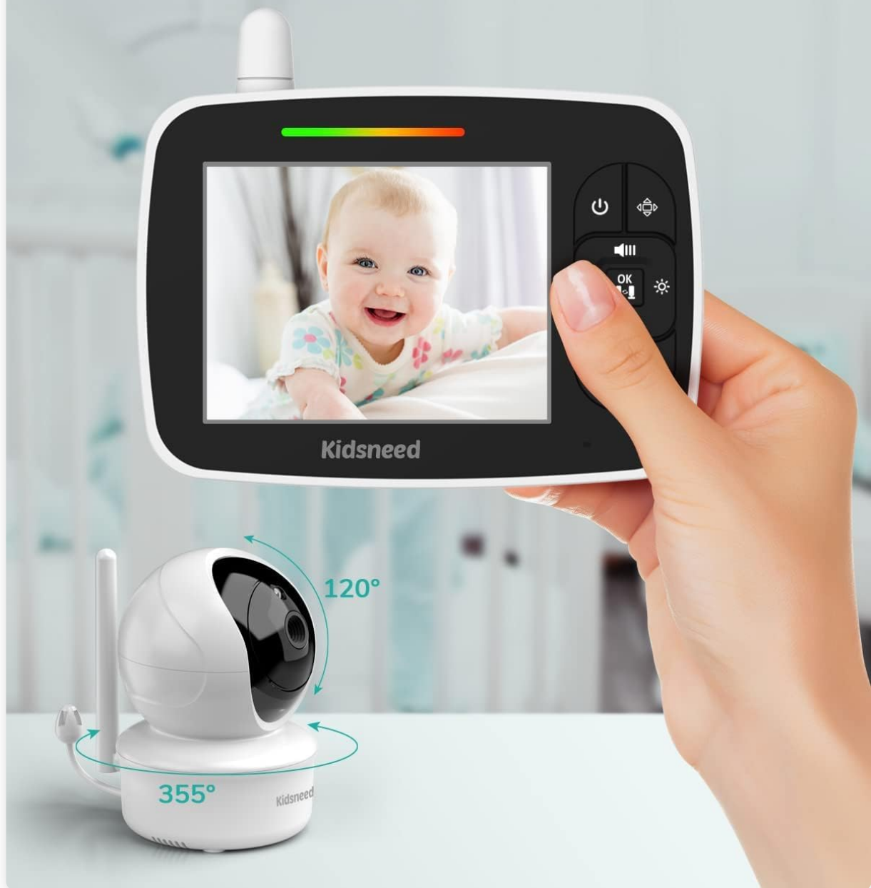
Image: The parent unit displaying a baby, alongside a camera unit with arrows indicating its 355-degree pan and 120-degree tilt capabilities, demonstrating comprehensive room coverage.