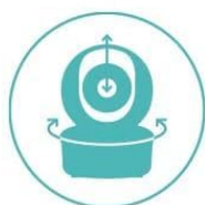
Remote Pan Tilt Zoom