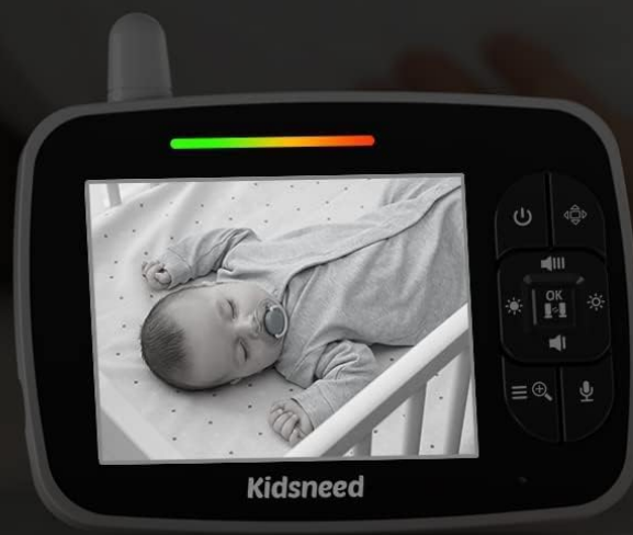
Image: The parent unit screen showing a baby sleeping in a crib, depicted in clear greyscale, demonstrating the automatic night vision feature in a dark room.