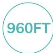
Up to 960 ft Range