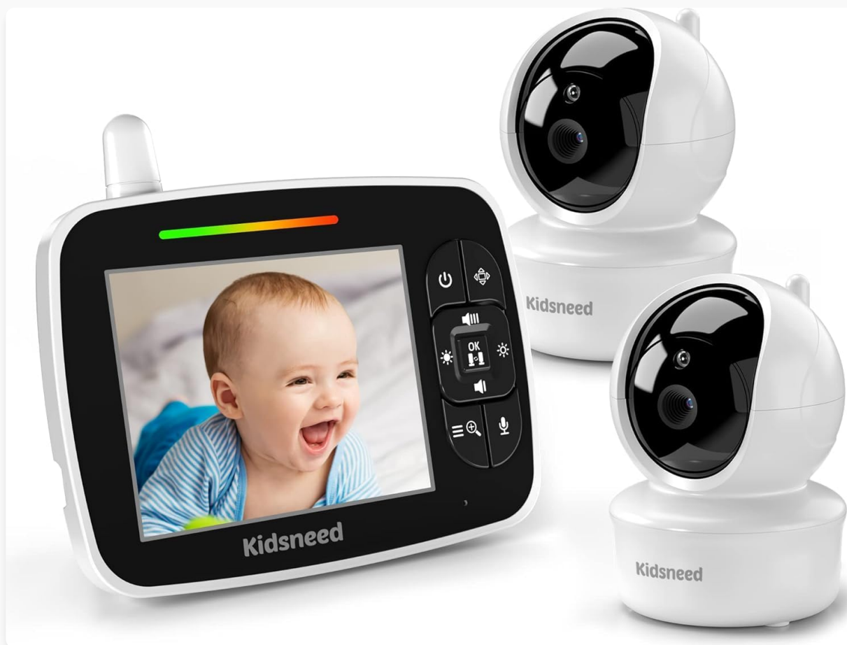
Image: The Kidsneed Baby Monitor system, featuring the parent unit (monitor) and two baby cameras.

Thank you for choosing the Kidsneed Baby Monitor with 2 Cameras. This manual provides detailed instructions for setting up, operating, and maintaining your baby monitor system. Please read this manual thoroughly before use to ensure proper functionality and safety. This system is designed to help you monitor your baby with high-resolution video, two-way audio, and various smart features.