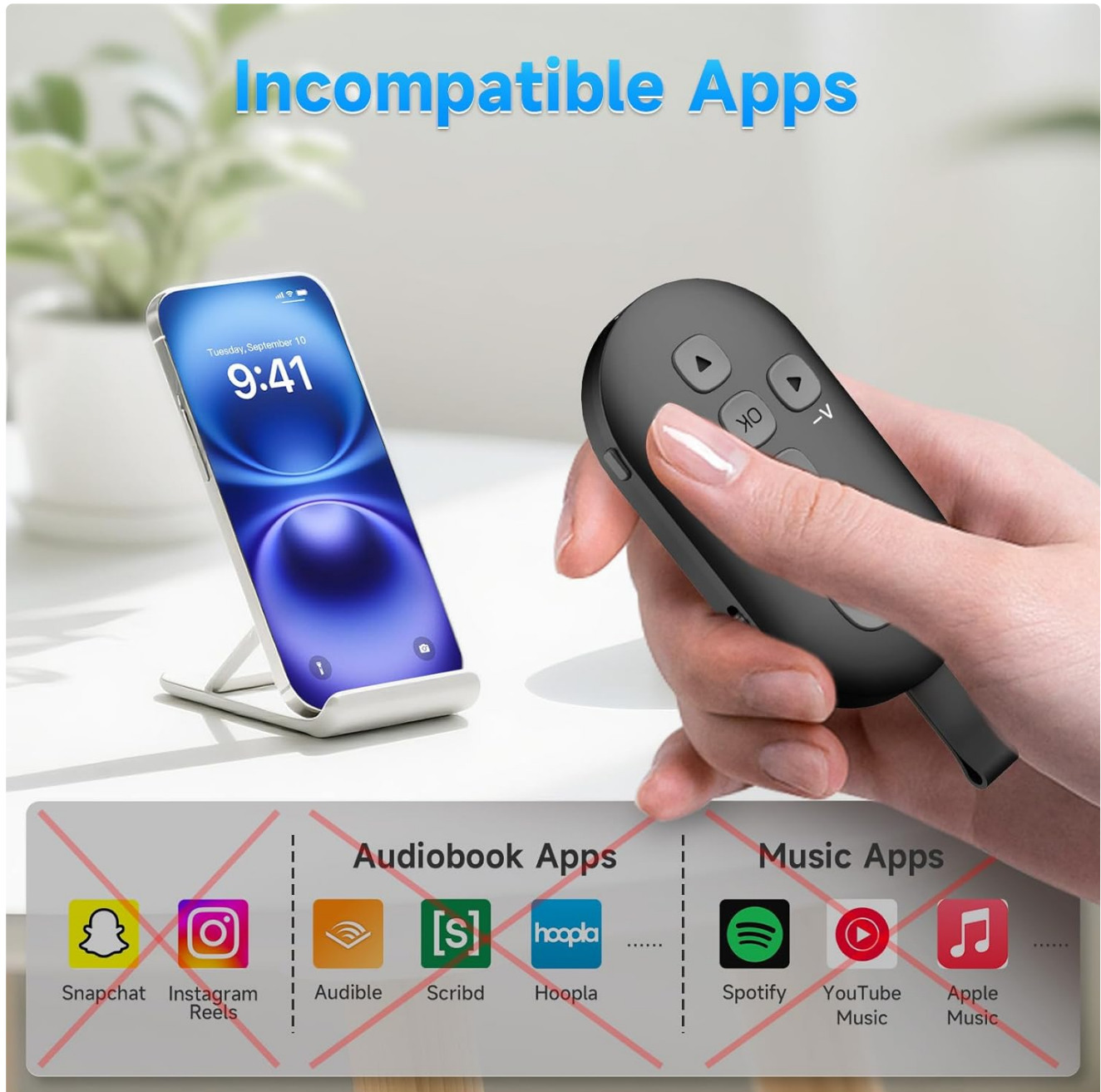
Image: A visual representation of applications and device types that are not compatible with the R1 remote control, including various music and audiobook apps.