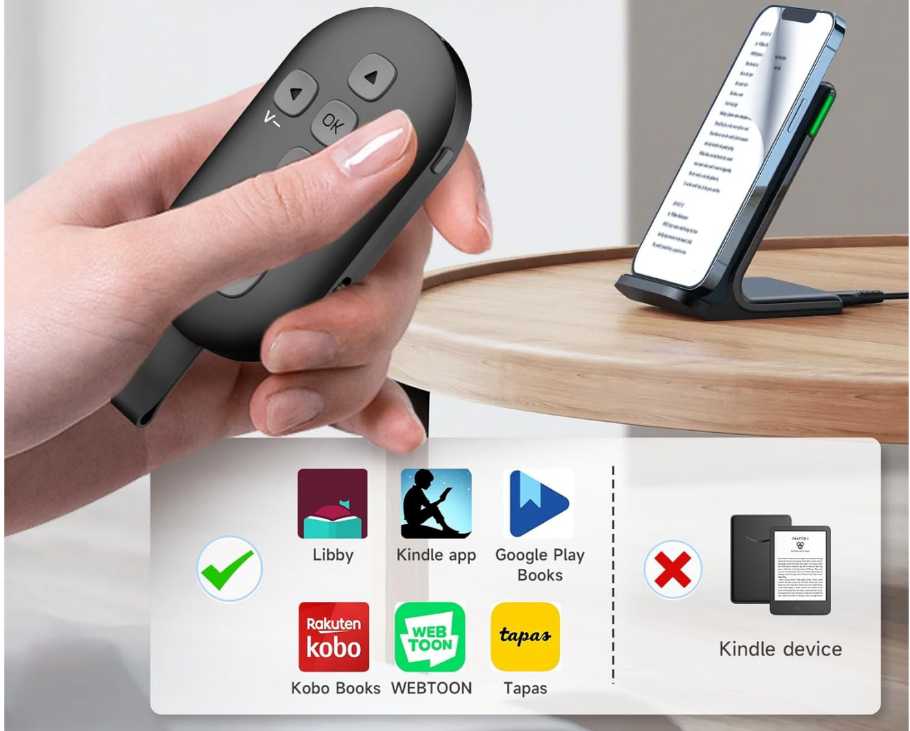
Image: The R1 remote control shown with a list of compatible eBook applications, highlighting its use as a page turner.