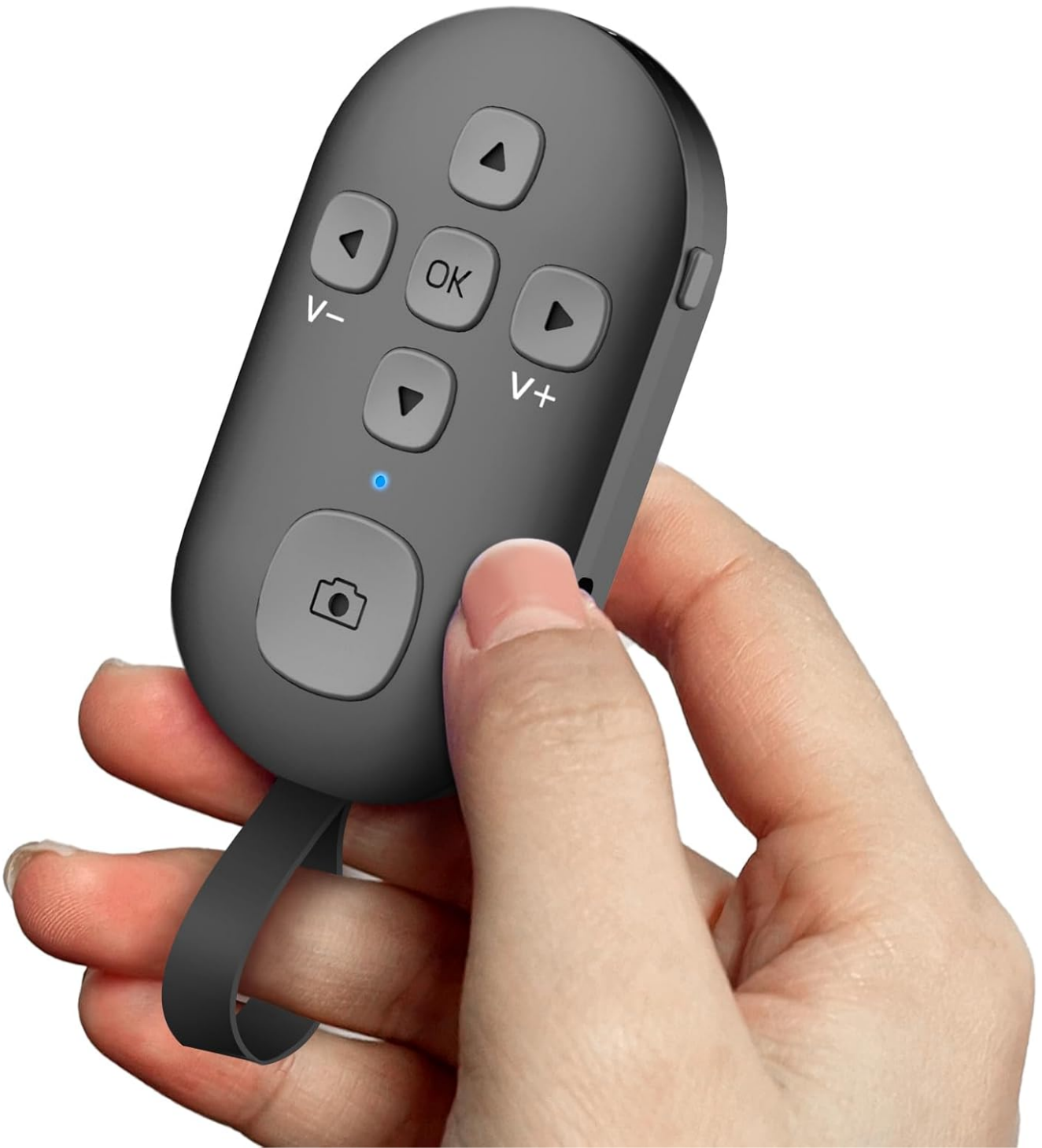
Image: A graphic illustrating the various features of the R1 remote, including TikTok scrolling, liking, eBook page turning, camera shutter, and advanced functions requiring manual setup.