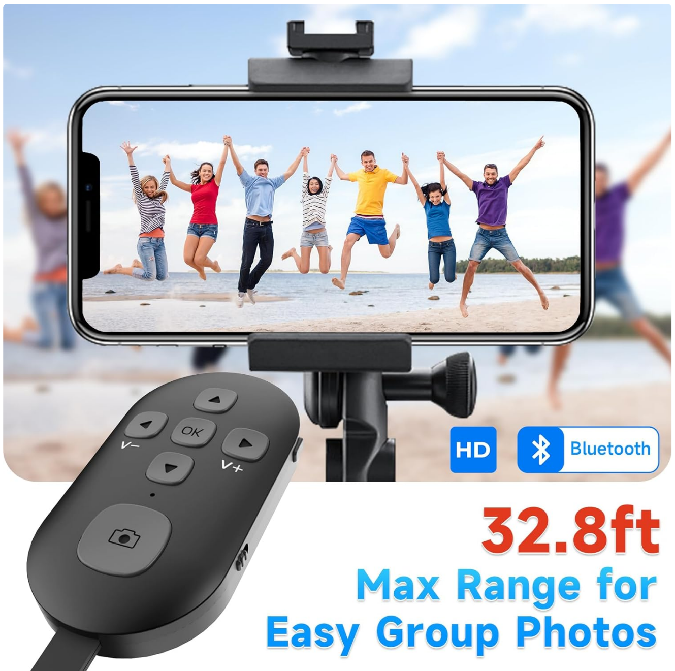
Image: The R1 remote control positioned in the foreground, with a smartphone on a tripod in the background capturing a group photo, emphasizing its 32.8ft maximum range for camera control.