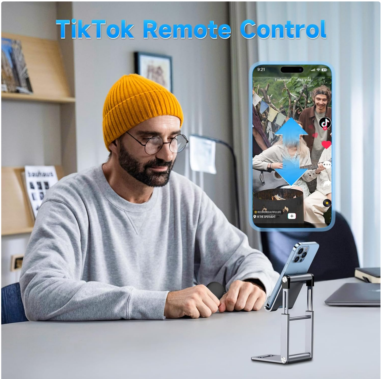
Image: A person using the R1 remote control to scroll through TikTok videos on a smartphone, demonstrating hands-free operation.