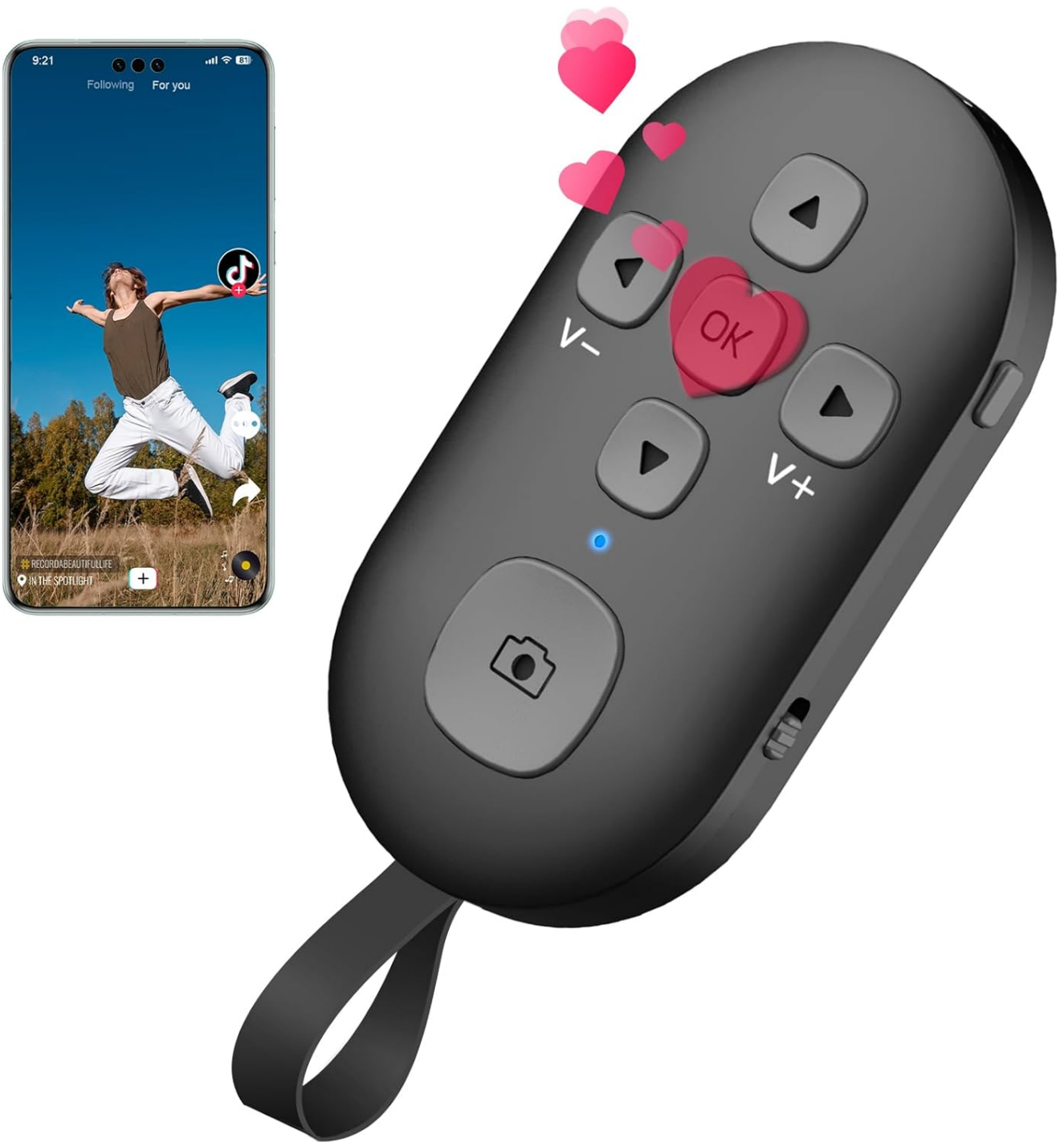
Image: The SEANCHEER R1 remote control shown alongside a smartphone displaying a TikTok video, illustrating its primary use.