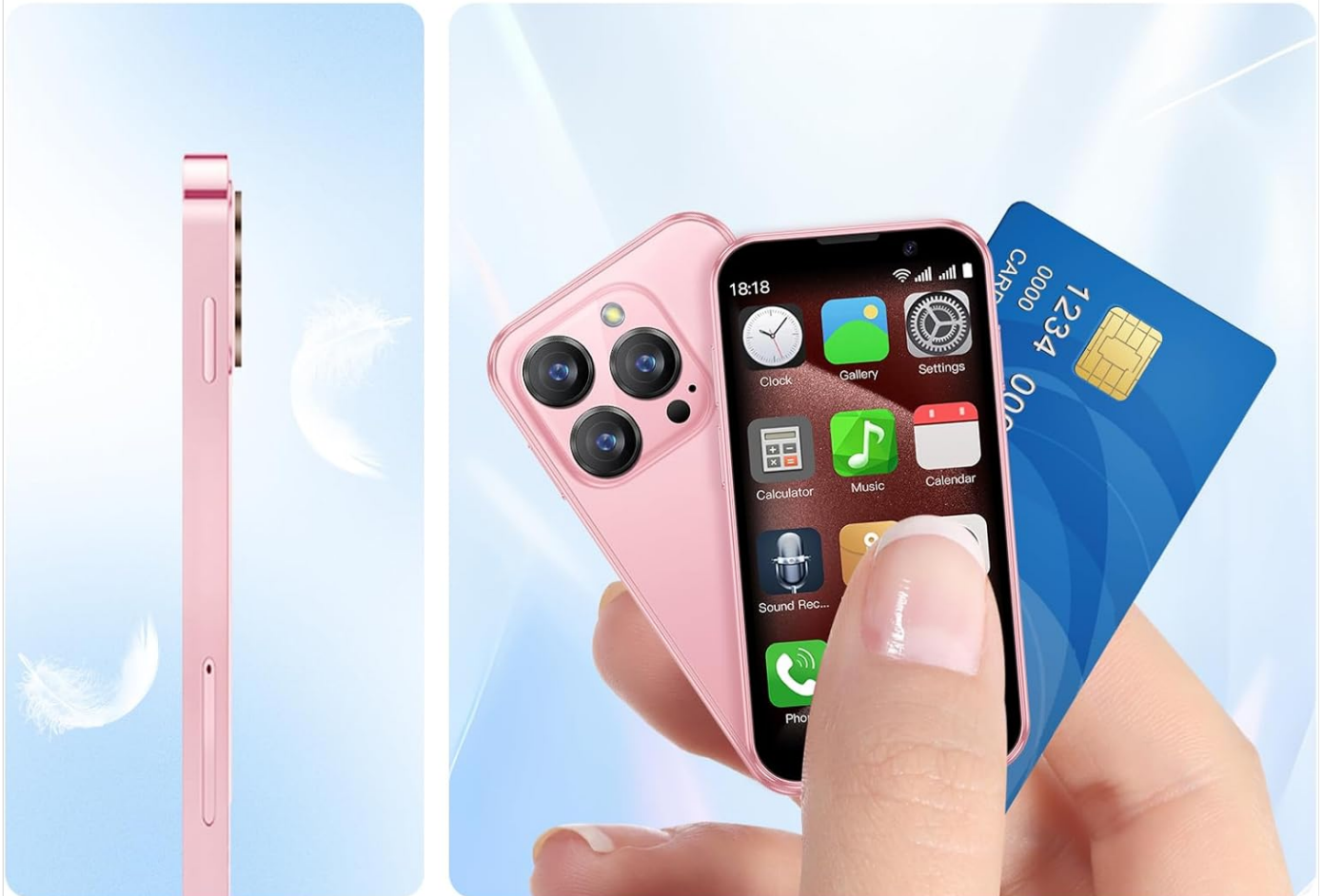
Image: Side view of the smartphone, illustrating its slim profile (10.5mm thickness).