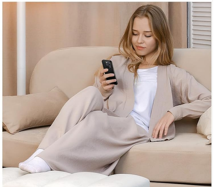
Image: The smartphone connected to a Type-C charger, indicating charging status.