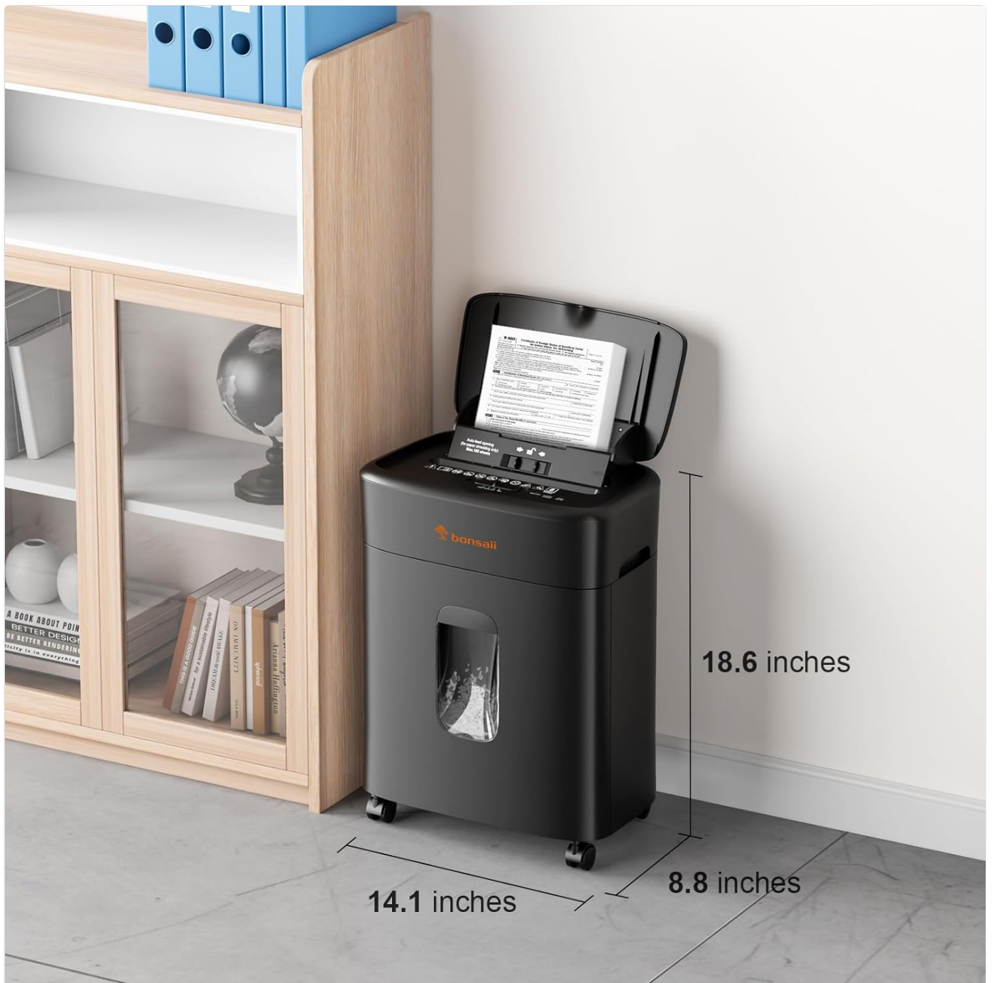
Image: The Bonsai C231-D shredder positioned next to a wall, with dimensions labeled as 18.6 inches height, 14.1 inches width, and 8.8 inches depth.