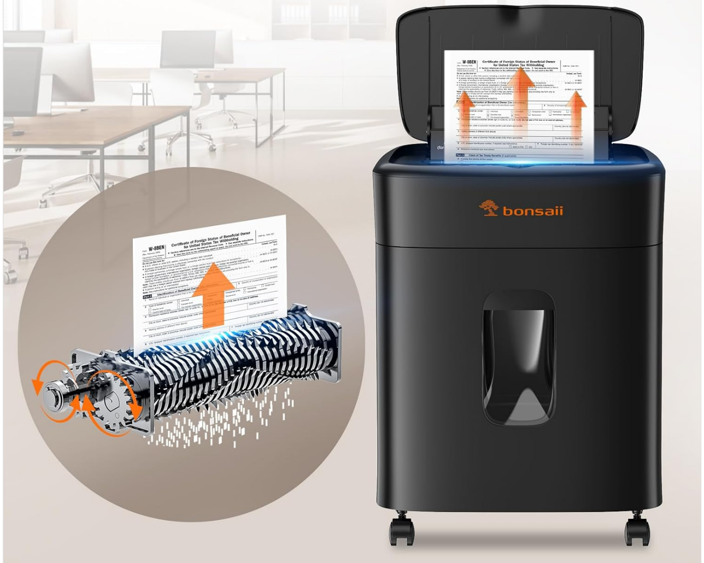
Image: Diagram illustrating the automatic reverse function of the Bonsai C231-D shredder, showing paper being ejected to clear a jam.

Clears paper jams, reducing the likelihood of paper jams