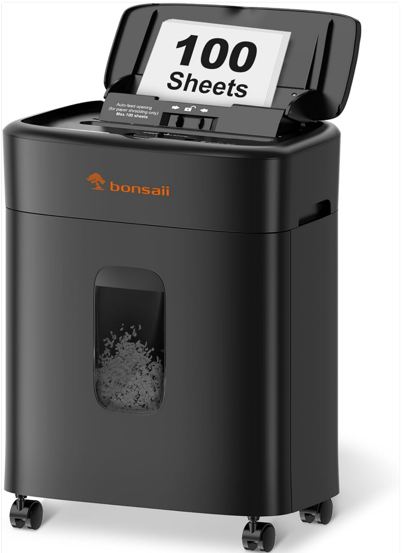
Image: Front view of the Bonsaii C231-D Paper Shredder, showcasing its auto-feed tray loaded with 100 sheets and the transparent window for viewing shredded paper.