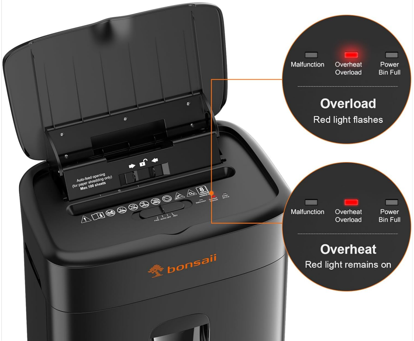
Image: Close-up of the Bonsaii C231-D shredder's control panel, highlighting the red indicator lights for Overload (flashing) and Overheat (solid) conditions.

Provide users with great operating experience