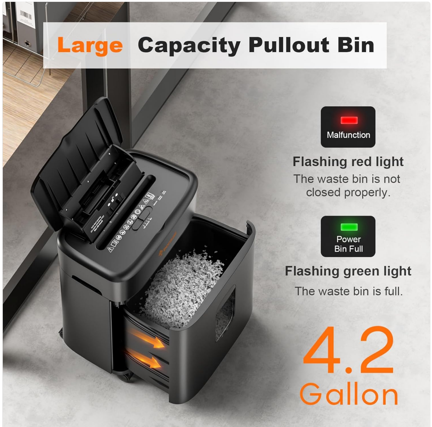
Image: The Bonsai C231-D shredder with its 4.2-gallon pull-out bin partially removed, showing shredded paper inside. Indicator lights for Malfunction (flashing red) and Power/Bin Full (flashing green) are visible.

The shredder features a 4.2-gallon pull-out bin. When the bin is full, the "Power/Bin Full" indicator light will flash green. To empty: