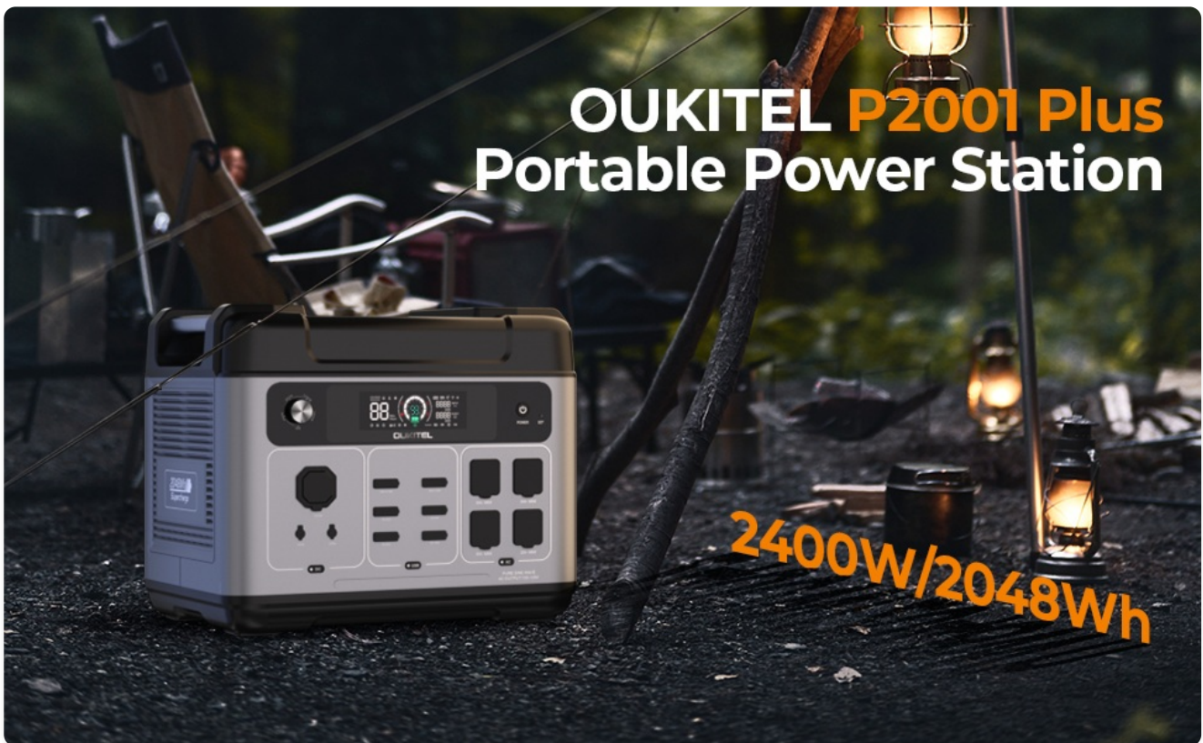
Image: The OUKITEL P2001 Plus Solar Generator is capable of powering a wide range of home appliances, suitable for 99% of typical household power needs.

The OUKITEL P2001 Plus is a high-capacity portable power station designed to provide reliable electricity for various applications, including home emergency backup, outdoor activities, and professional work sites. Featuring a robust LiFePO4 battery and multiple output options, it ensures your devices remain powered wherever you are.