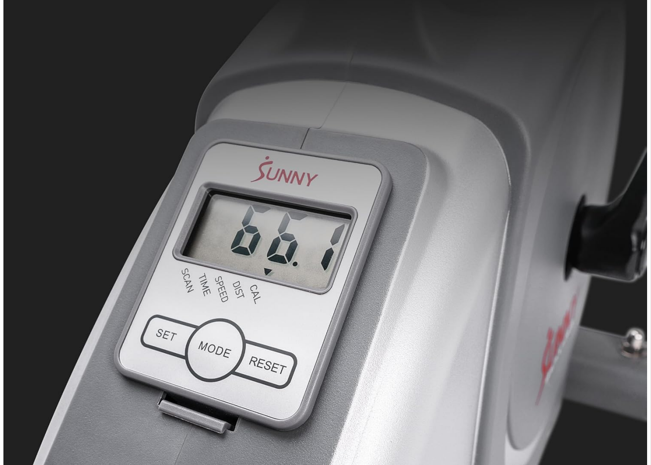
Image: The digital monitor, providing real-time feedback on workout metrics such as time, speed, distance, and calories burned.

The digital monitor clearly displays key metrics such as calories burned, time, distance , and more. Effortlessly track your performance to optimize your workouts and watch your progress