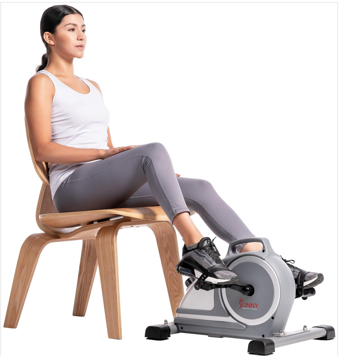
Image: The Under-Desk Bike Trainer positioned for leg exercise, demonstrating its compact design and ease of use in a seated

Place the Under-Desk Bike Trainer on a flat, stable surface. The unit features slip-resistant feet to prevent movement during use. It can be used under a desk for leg exercises or placed on a table for arm exercises.