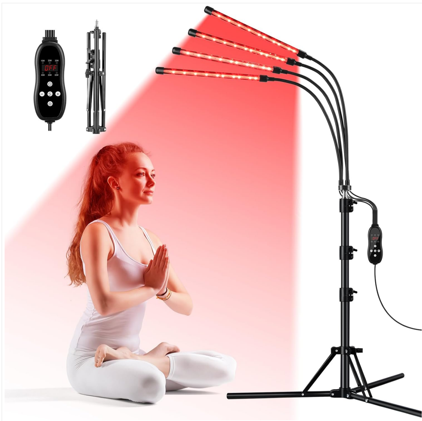
Image: The Cozion Infrared Heat Lamp with Stand, illustrating its use during a meditation session. The lamp features four flexible heads emitting red light, positioned on an adjustable stand, with a remote control visible.