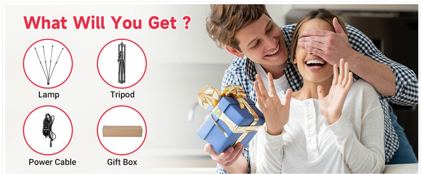
Image: An illustration detailing the contents of the product package, including the lamp, tripod, power cable, and gift box.