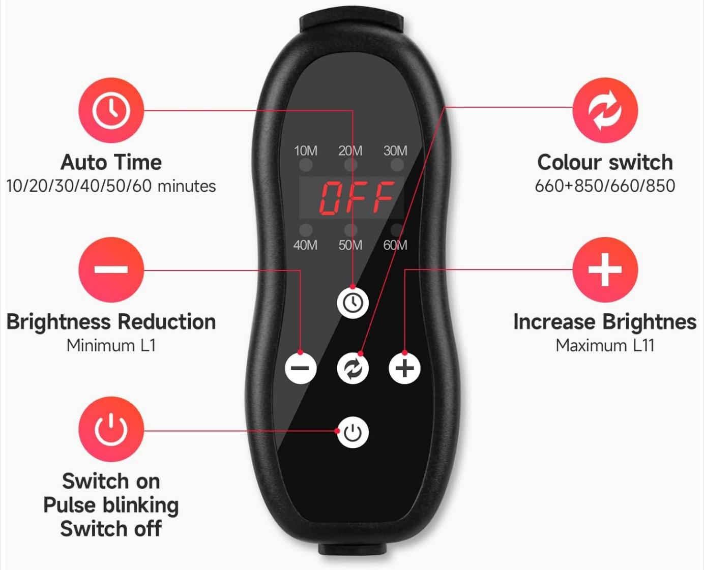
Image: A detailed view of the lamp's control switch, highlighting buttons for timer settings, color mode selection, brightness adjustment, and pulse mode activation.