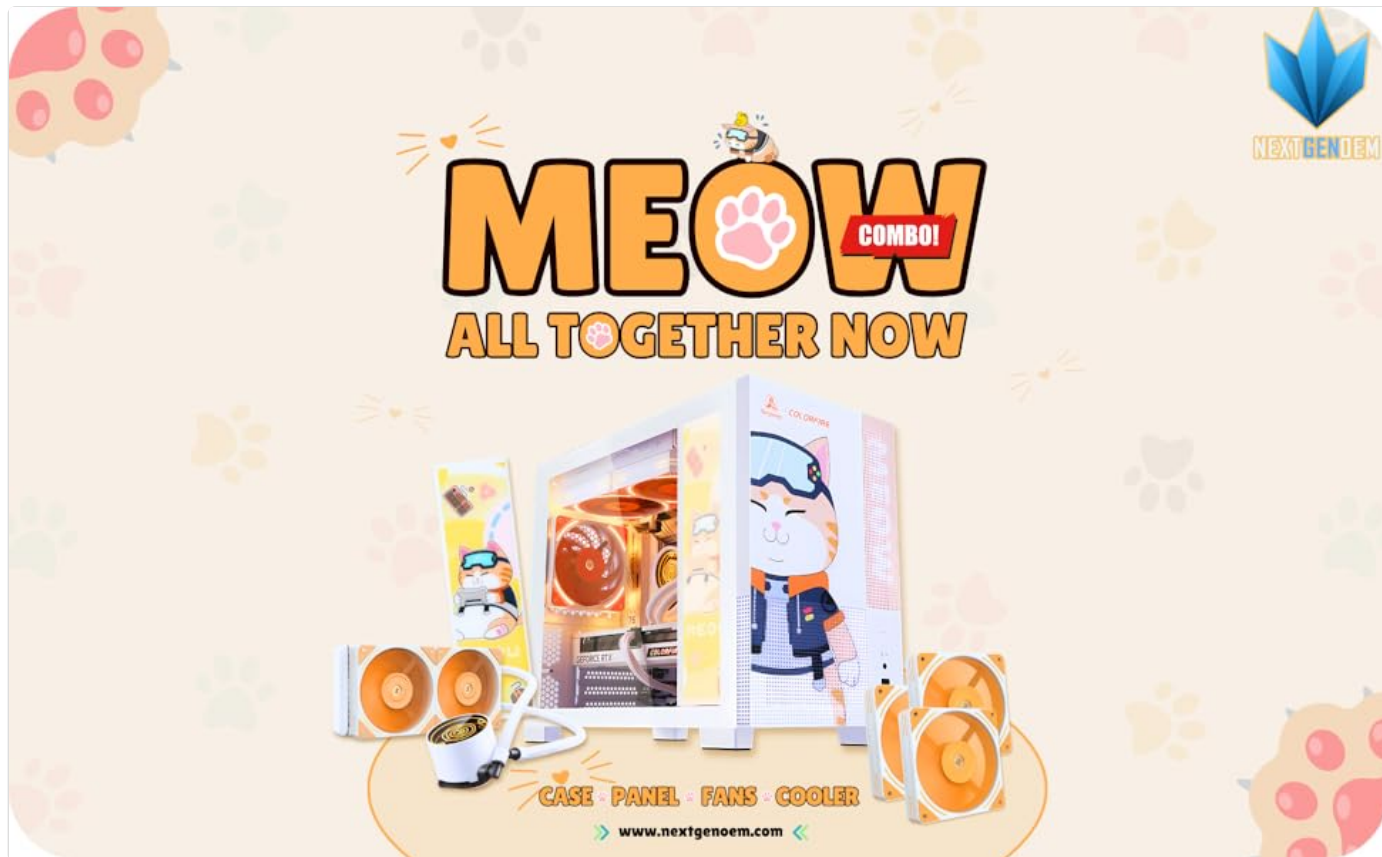
Figure 1: Segotep Memphis-S Meow Combo PC Case with included accessories (Lightning Panel, Fans, AIO Cooler).

This manual provides detailed instructions for the assembly, operation, and maintenance of your Segotep Memphis-S Meow Combo M-ATX Mini Tower PC Case. Please read this manual thoroughly before beginning installation to ensure proper setup and safe usage. This case is designed to support M-ATX and ITX motherboards, 40 Series GPUs, and features tempered glass panels along with a unique MEOW RGB lighting panel.