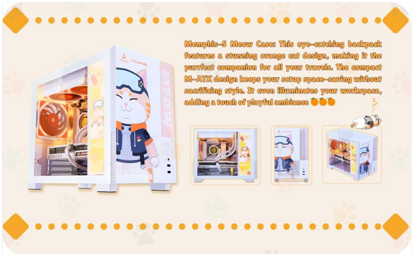
Figure 2: Internal view of the Memphis-S Meow Combo case, highlighting component placement.