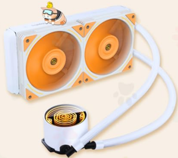
Figure 3: Belieed II 240 ARGB MEOW AIO CPU cooler, designed to complement the Meow setup.

HQ-12 Pro MEOW: Complete your MEOW symphony with the 3x 120mm HQ-12 Pro MEOW fans! These high-performance fans deliver exceptional cooling while maintaining the adorable cat theme. They'll keep your entire system purring along smoothly, even during intense journeys. ♥♥♥