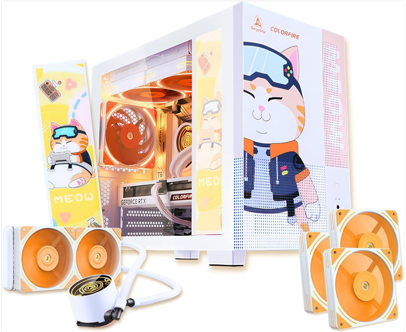
Figure 5: The Segotep Memphis-S Meow Combo PC Case fully assembled and powered on, displaying its integrated lighting.

After successful assembly, connect your peripherals and power cable. Press the power button on the front I/O panel to start your system. The MEOW RGB lighting panel will illuminate, adding a vibrant touch to your setup.