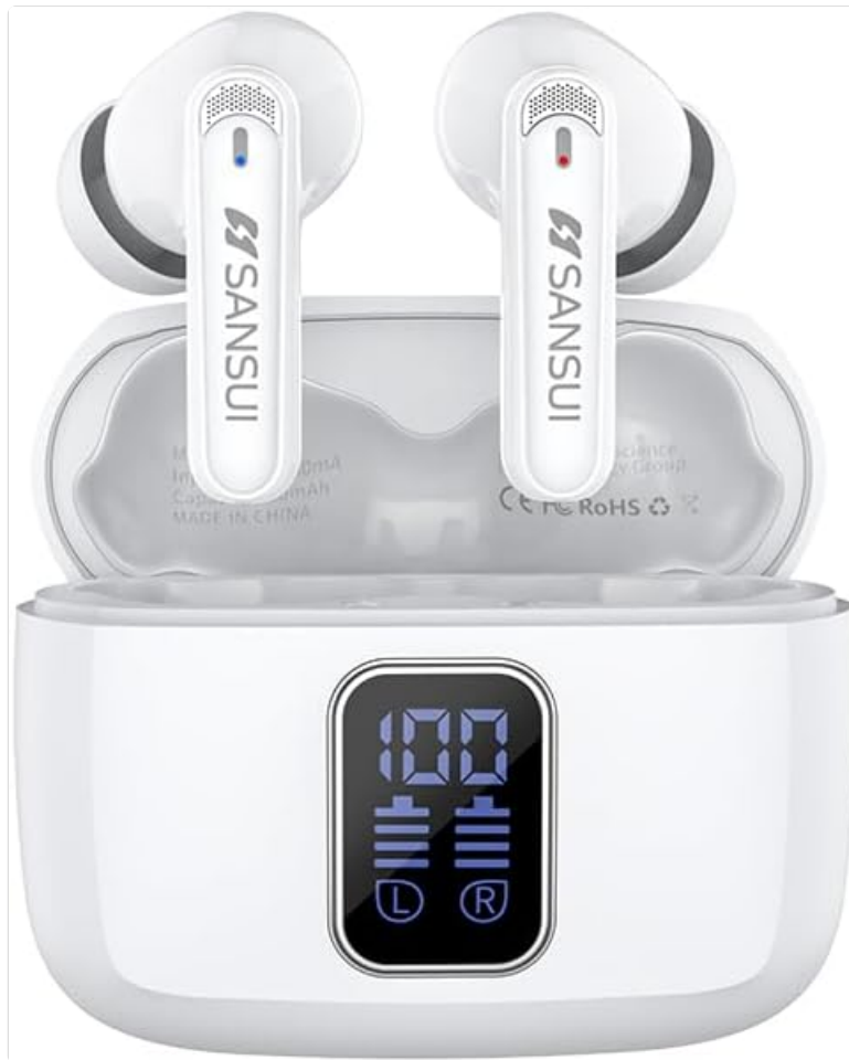
Image: SANSUI W9 TWS Earbuds inside their open charging case, displaying the digital battery indicator.