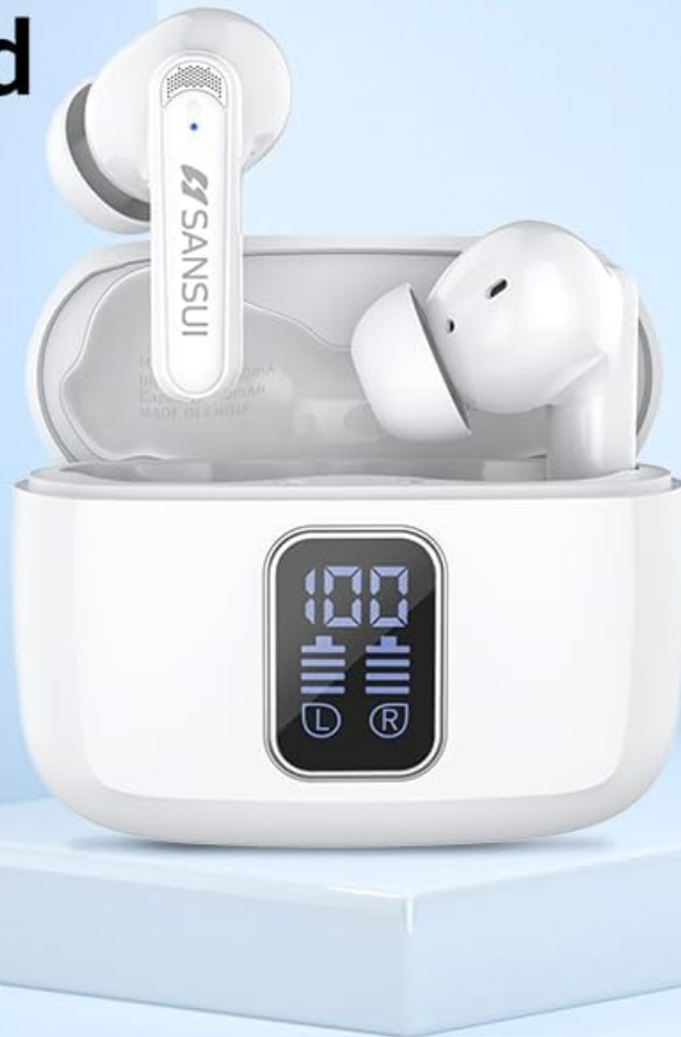
Image: The SANSUI W9 charging case with the earbuds inside, showing the illuminated LED digital display indicating battery percentage.