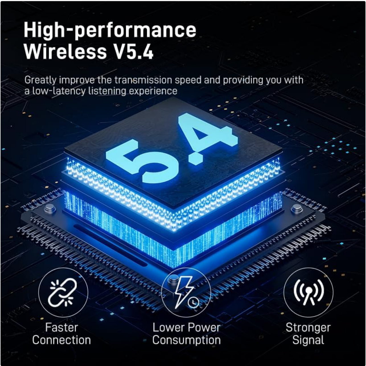
Image: A conceptual diagram illustrating the high-performance Wireless V5.4 chip, highlighting its benefits: Faster Connection, Lower Power Consumption, and Stronger Signal, all contributing to a low-latency listening experience.