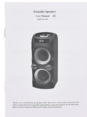
Image: The TYOTY A93 speaker along with its included accessories: USB charger cable, AUX cable, and user manual.