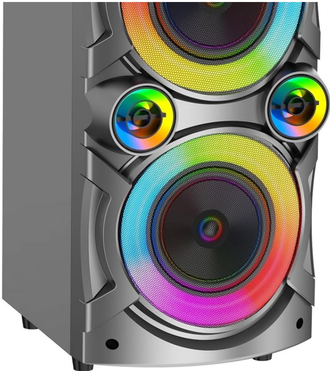
Image: Front view of the TYOTY A93 Portable Bluetooth Speaker, showcasing its dual speakers with vibrant, multi-colored LED lights.