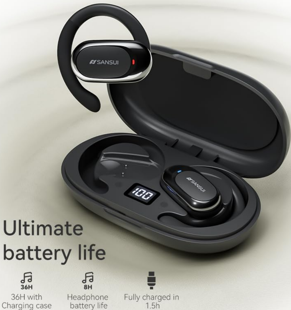
Figure 4: Battery Life Information