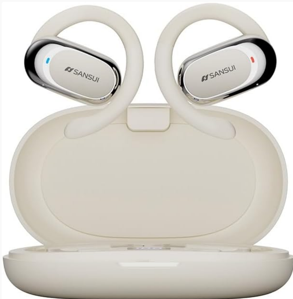
Figure 1: SANSUI W92 Headphones and Charging Case (Lvory)