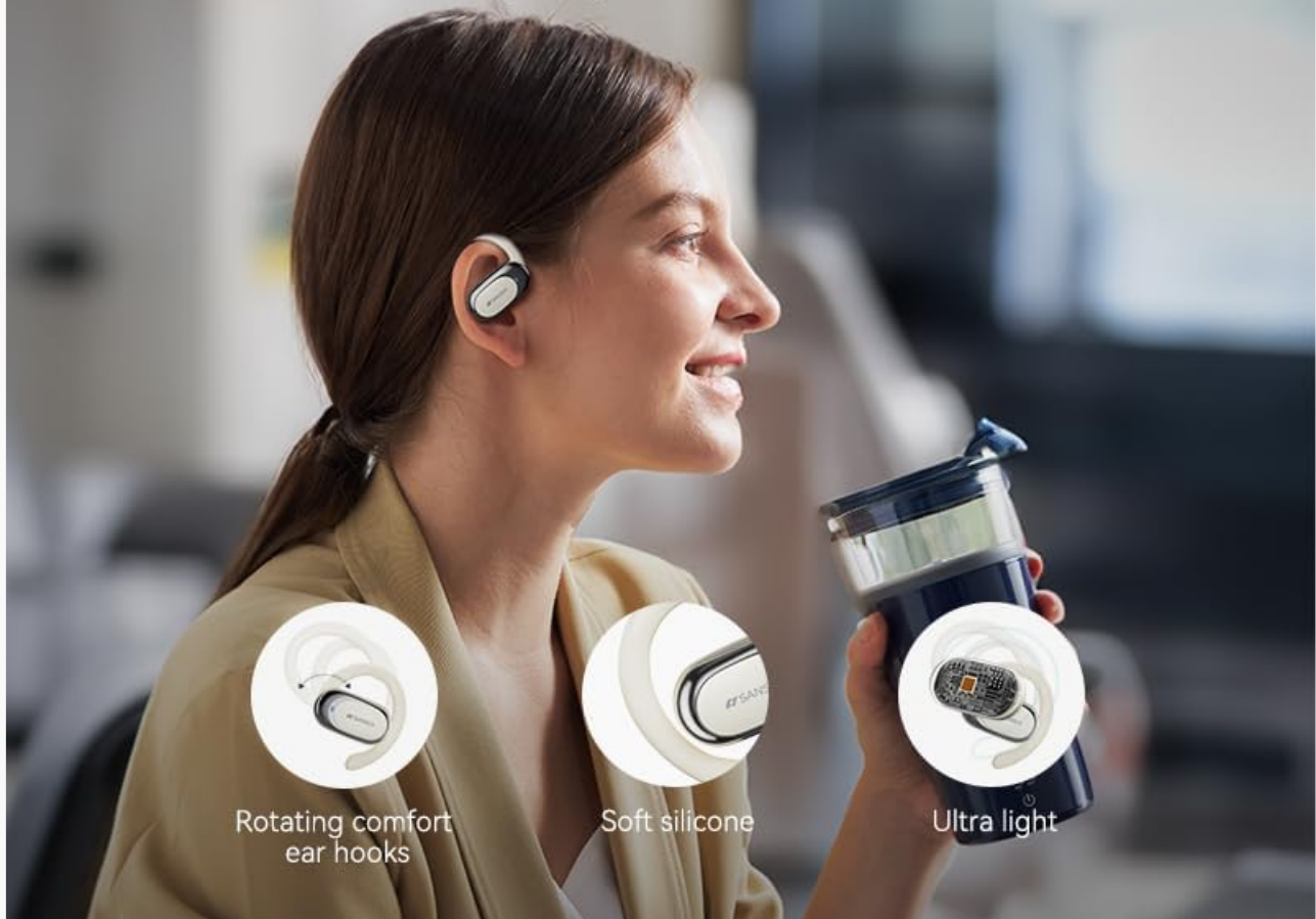
Figure 3: Ergonomic Ear Hook Design

Each earphone weighs 9.3g, making it light and comfortable to wear all day long.