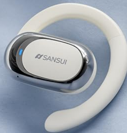
Figure 2: Key Features Overview