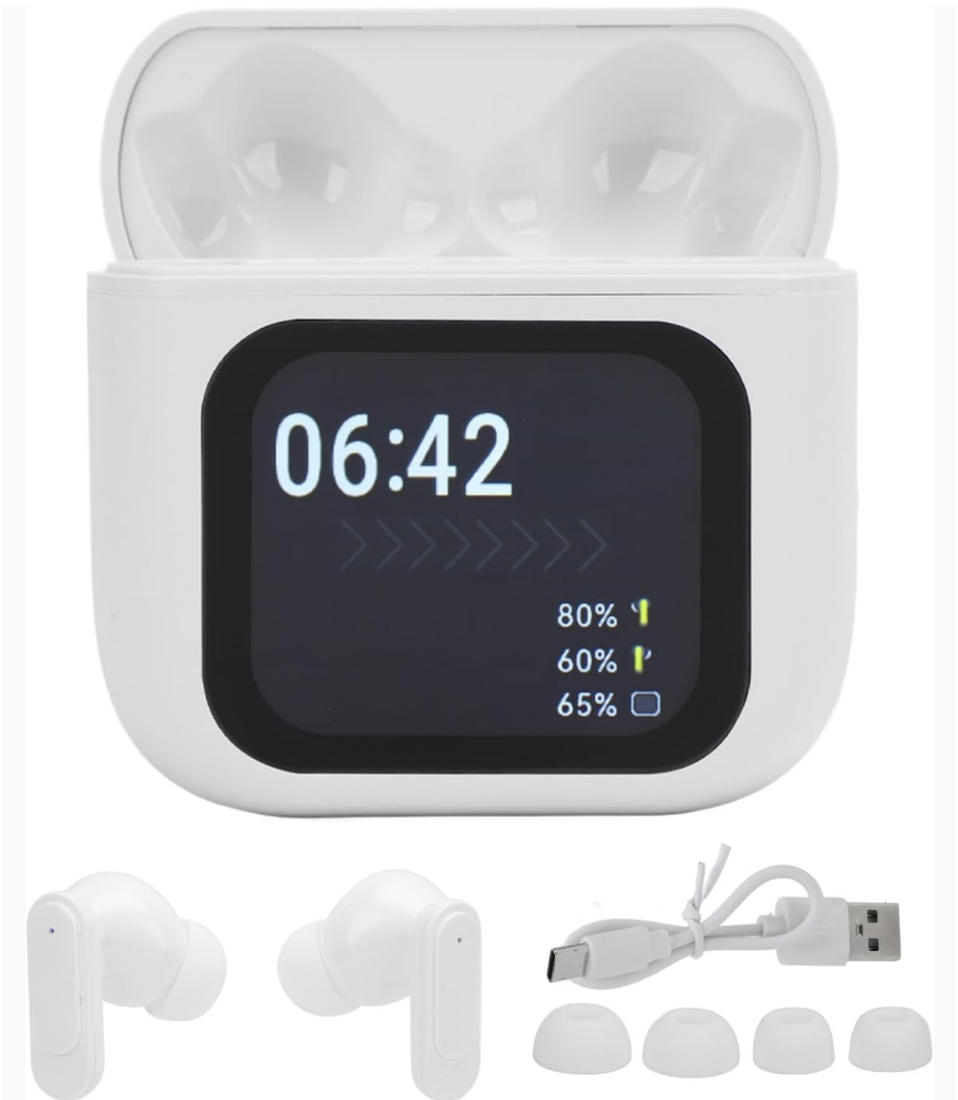
Image: Contents of the Wisoqu Earbuds package.