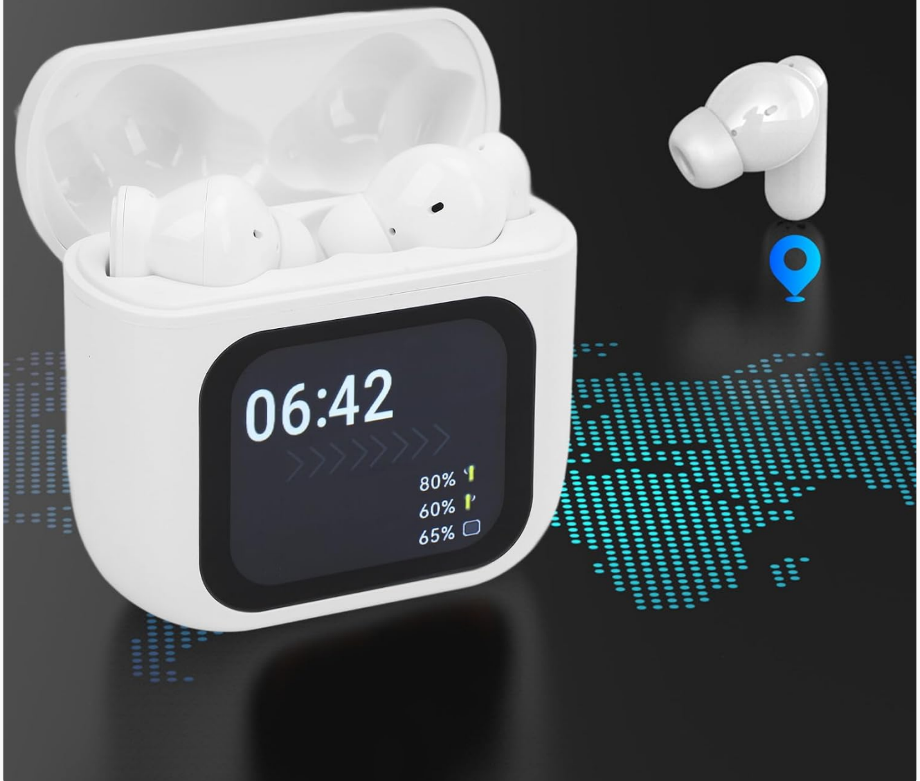
Image: Illustration of the 'Find your earbuds' feature.

Find your earbuds Never worry about dropping your earbuds again