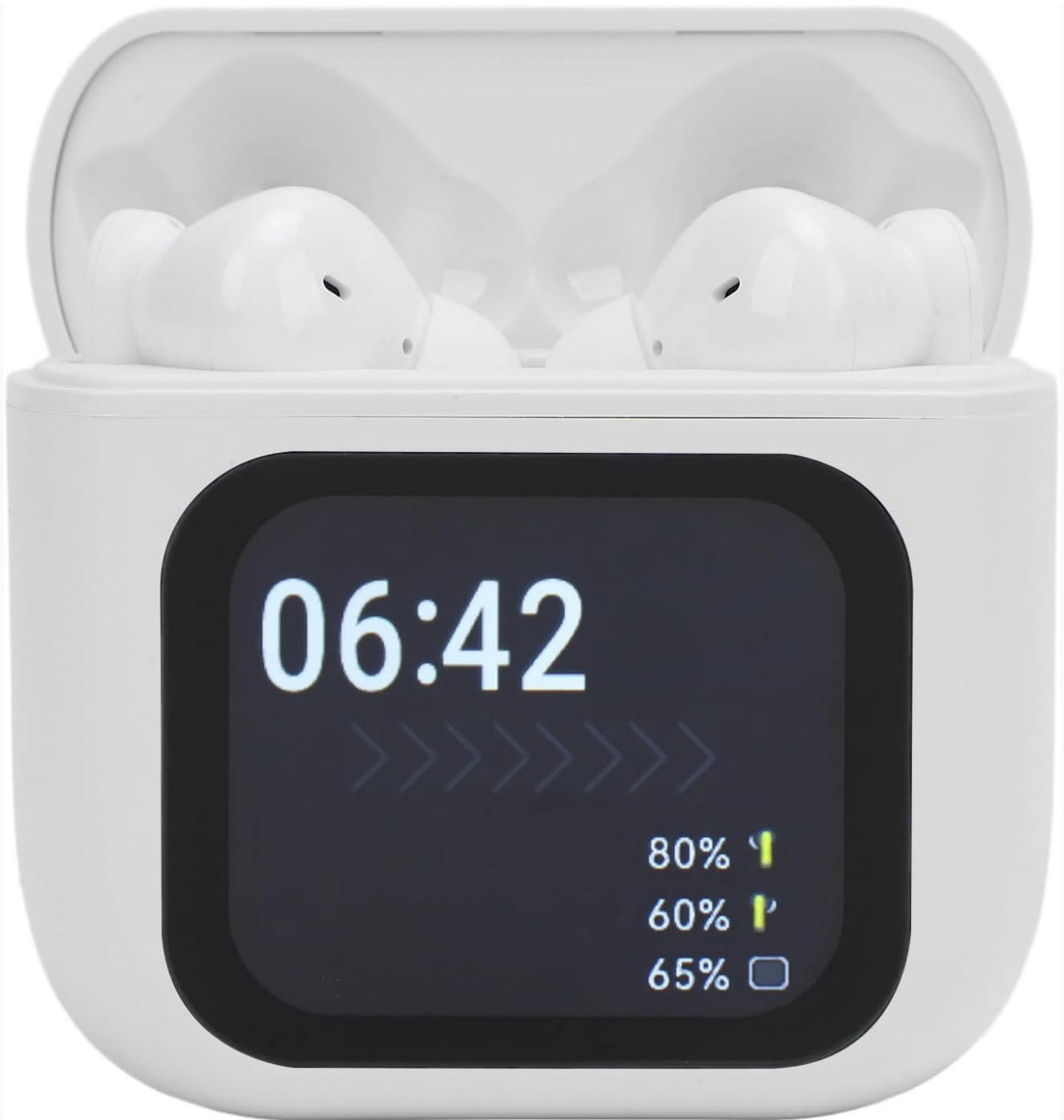
Image: Wisoqu earbuds in their LED touchscreen charging case.