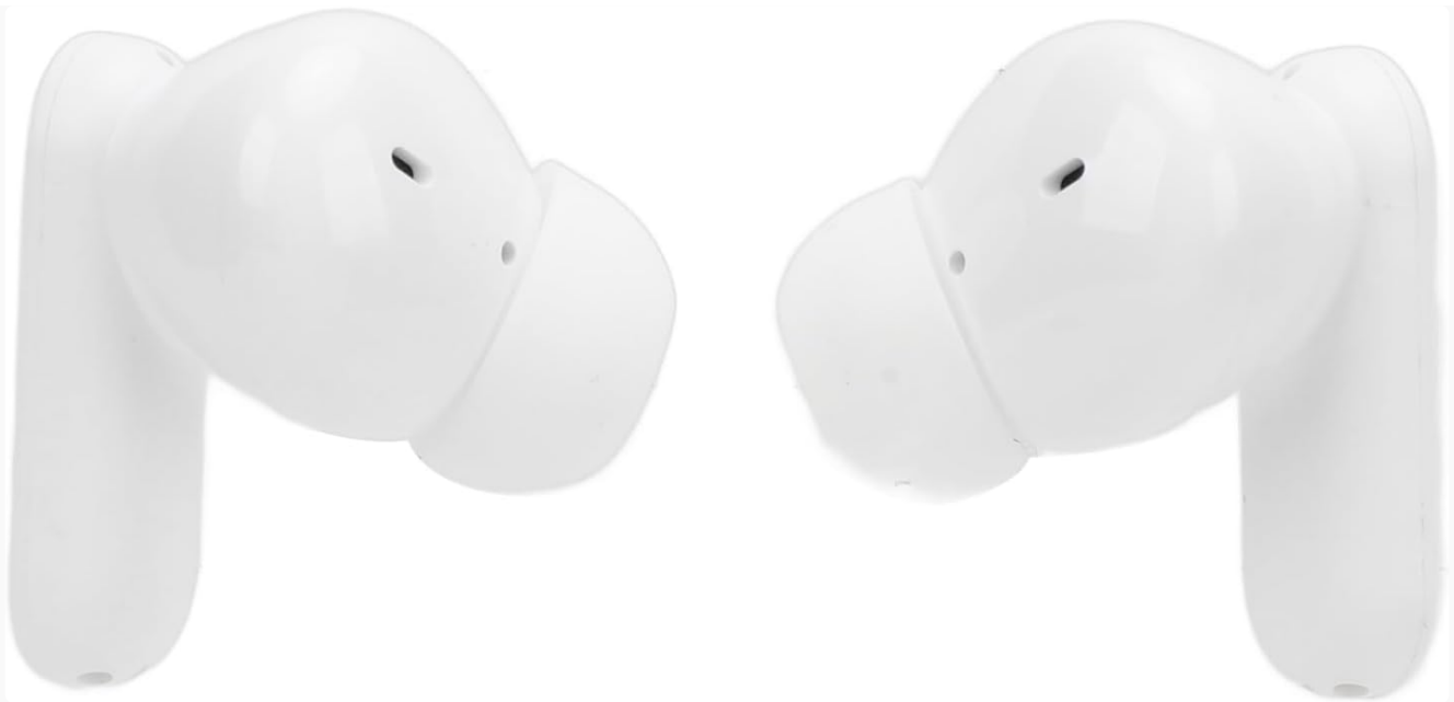
Image: Close-up of the Wisoqu earbuds.