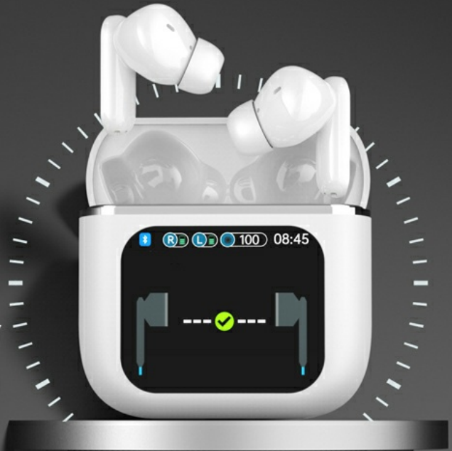
Image: Battery specifications and charging time.

Large capacity new energy lithium battery, charging time 1.5h, talk time 1.5h, lower power consumption