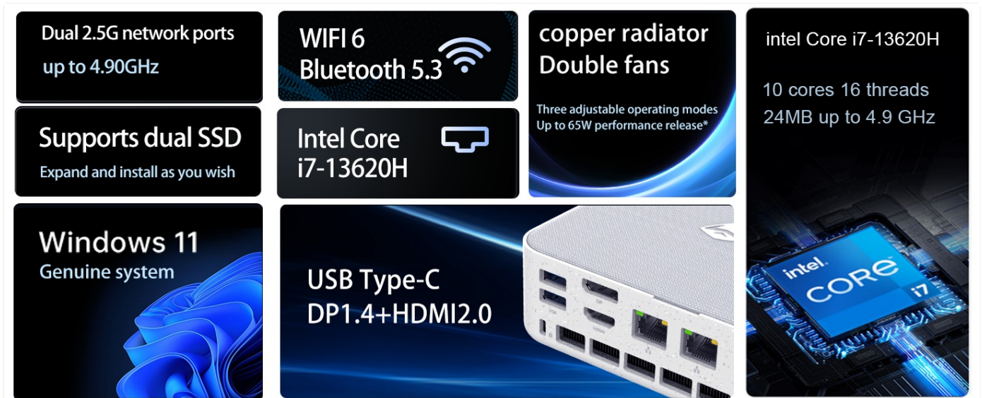
Image: Illustration of the twin turbine cooling fan and deluxe all-copper radiator, explaining how it prevents slowdowns due to overheating and offers silence, balance, and performance modes.

To change these settings, access the BIOS during startup (typically by pressing Del or F2 repeatedly after powering on) and navigate to the relevant power or performance settings.