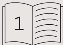
Quick start guide & regulation sheet