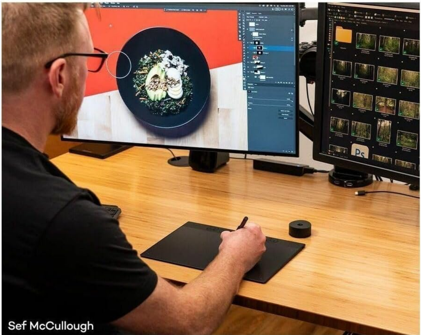
Image: A user demonstrating the Wacom Intuos Pro tablet in action, performing image editing tasks on a dual-monitor setup, showcasing its integration into a professional workflow.

Your browser does not support the video tag.