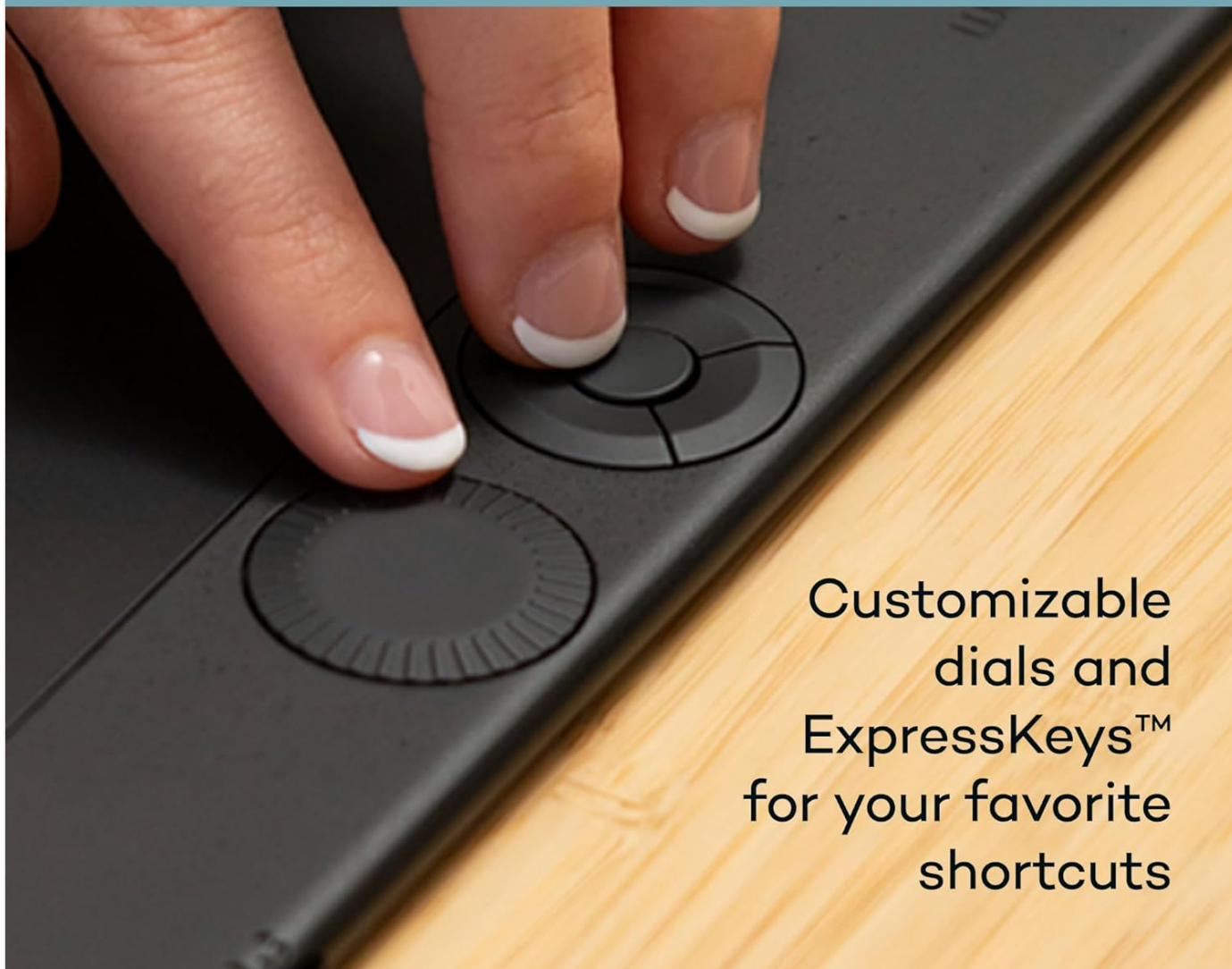
Image: A close-up of a hand interacting with the customizable dials and ExpressKeys on the Wacom Intuos Pro tablet, designed for quick shortcuts.