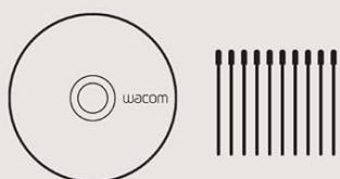
Pen stand and replacement nibs