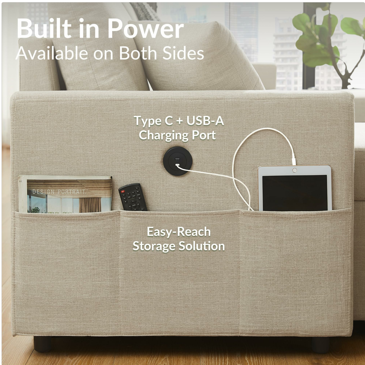
Image 4.2: A close-up view of the armrest, highlighting the integrated Type C and USB-A charging port and the convenient side storage pockets.