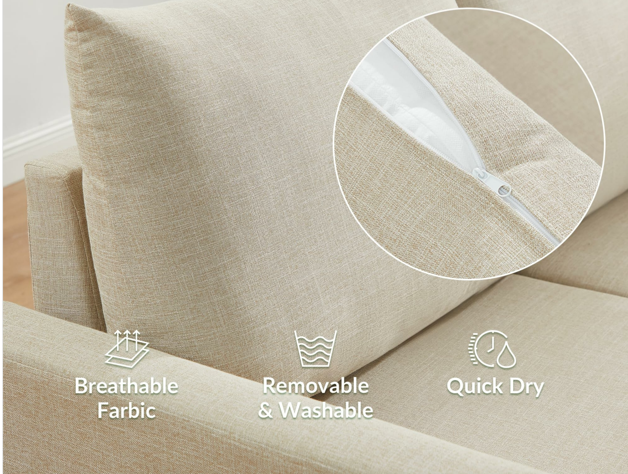
Image 5.1: A detailed view of a sofa cushion, showing the zipper for easy removal of the breathable, durable, and washable linen cover.