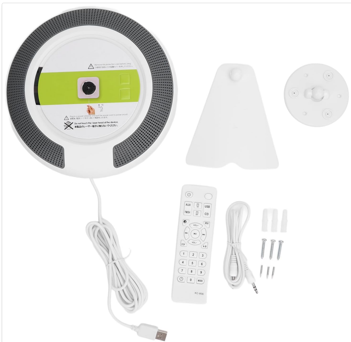
Figure 1: All items included in the GOWENIC Portable CD Player package, showing the player, remote, cables, and mounting hardware.