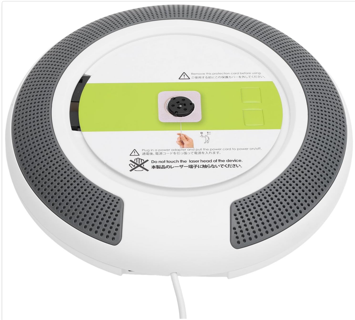
Figure 2: Front view of the GOWENIC CD Player, highlighting the CD compartment and safety warnings regarding the laser head.