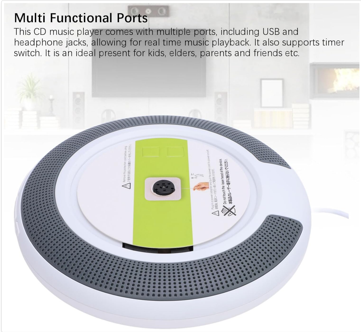
Figure 3: Detail of the multi-functional ports on the CD player, including the USB port and headphone jack.

This CD music player comes with multiple ports, including USB and headphone jacks, allowing for real time music playback. It also supports timer switch. It is an ideal present for kids, elders, parents and friends etc.