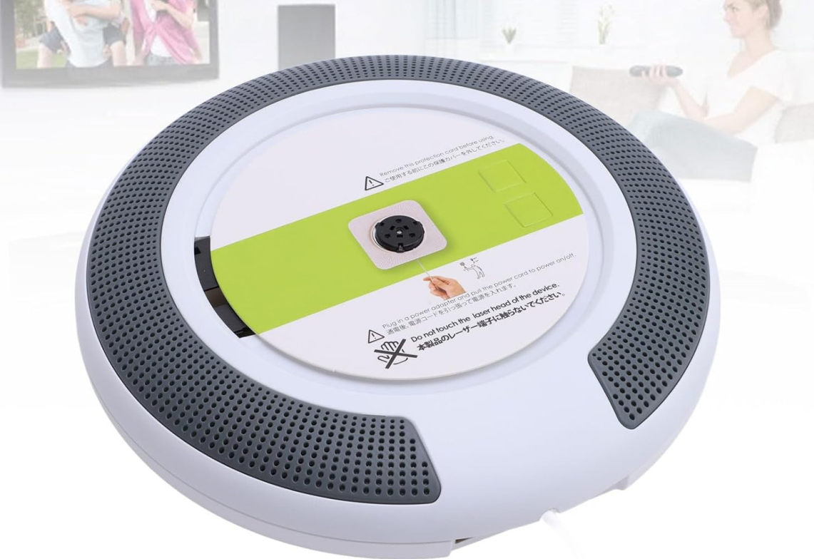
Figure 6: Detail of the intuitive button layout on the GOWENIC CD Player for easy control of playback and settings.

The portable CD player is equipped with simple and ergonomic buttons for easy operating and a clear interface. It also comes with a remote control for more convenience.