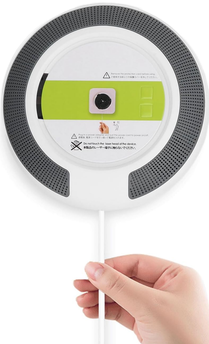
Figure 5: Visual guide demonstrating how to remove the protective card from the CD player's laser head and how to use the pull cord switch for power.

You can turn on the device and start playing by pulling the power cord. Pulling the cord again will switch off the device.