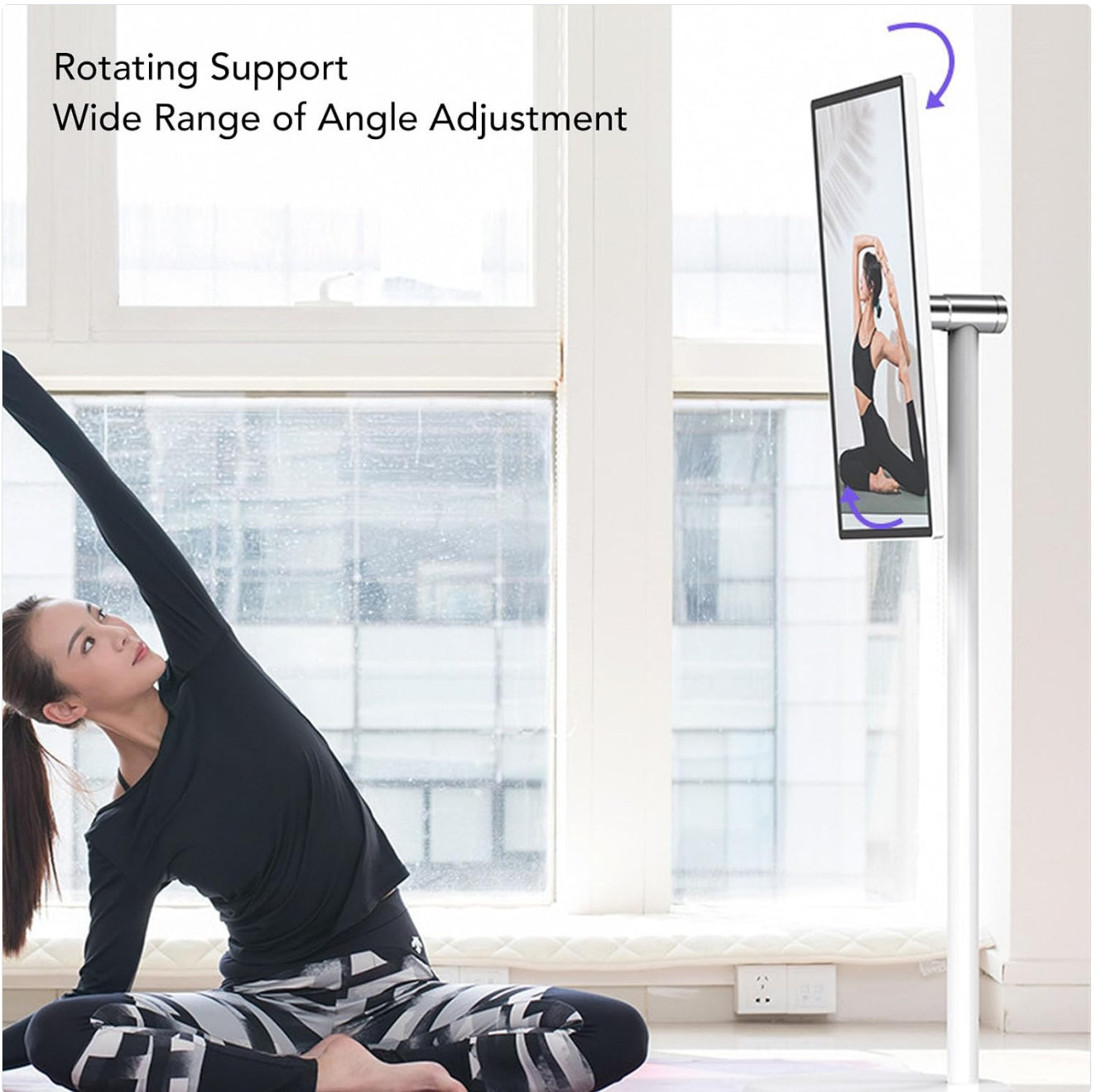
Figure 4.1: The screen can be rotated for various viewing angles and applications.