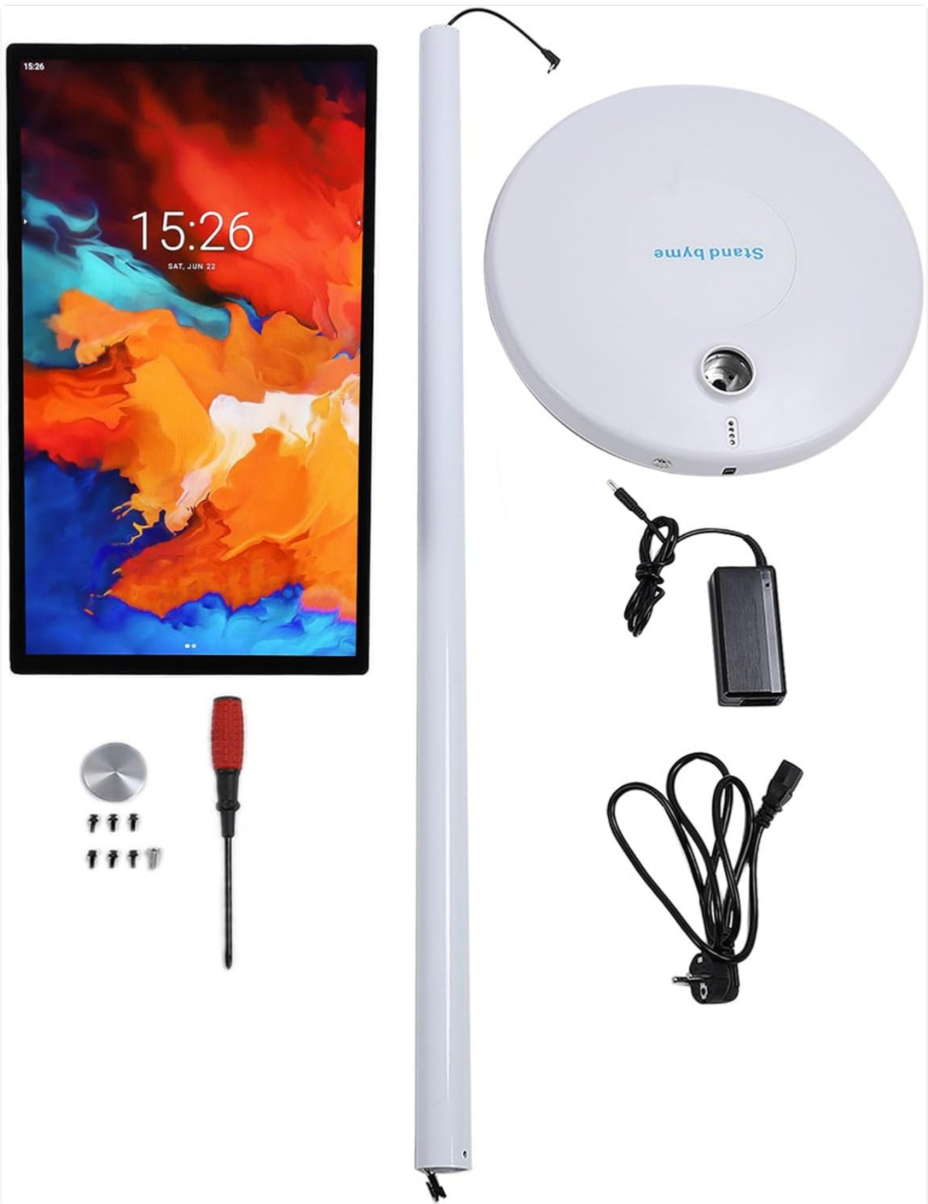
Figure 2.1: All components included in the package for the Bewinner Smart Screen.