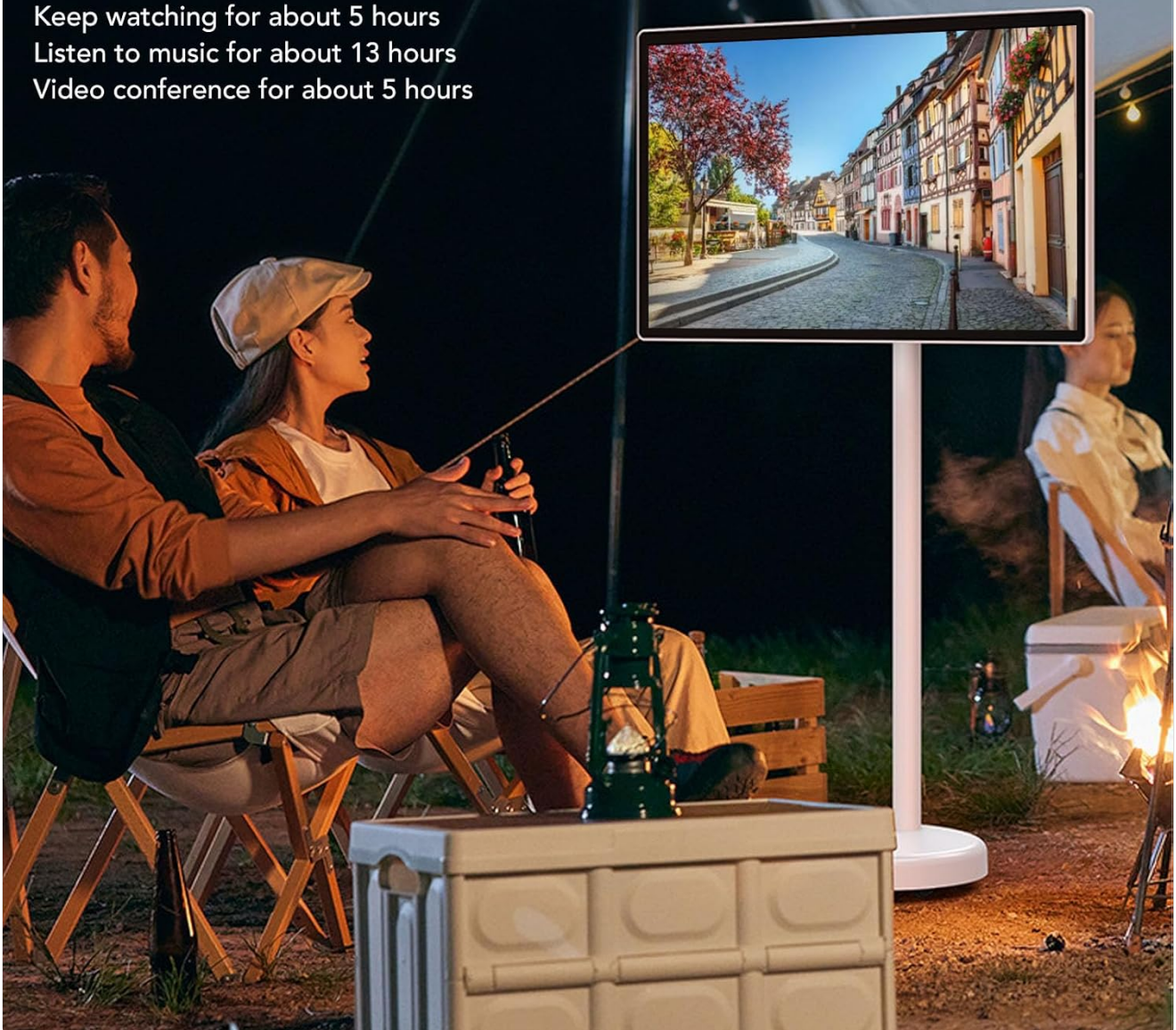
Figure 4.4: Enjoy immersive audio with the integrated sound system.

Built in Battery 7800MAH large capacity, 5-13 hours endurance, suitable for outdoor camping Keep watching for about 5 hours Listen to music for about 13 hours Video conference for about 5 hours