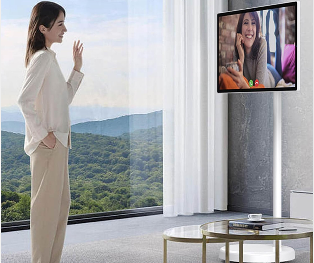
Figure 4.3: The integrated camera and microphone facilitate video communication.

Built in Camera and Microphone 5MP HD camera, noise reduction microphone, no need for external connection, more convenient for video chat, online course teaching, video conferencing