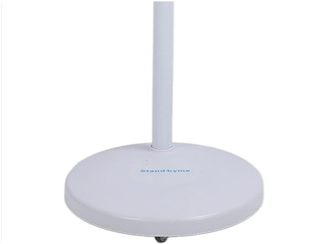
Figure 3.1: The Bewinner Smart Screen fully assembled and ready for use.