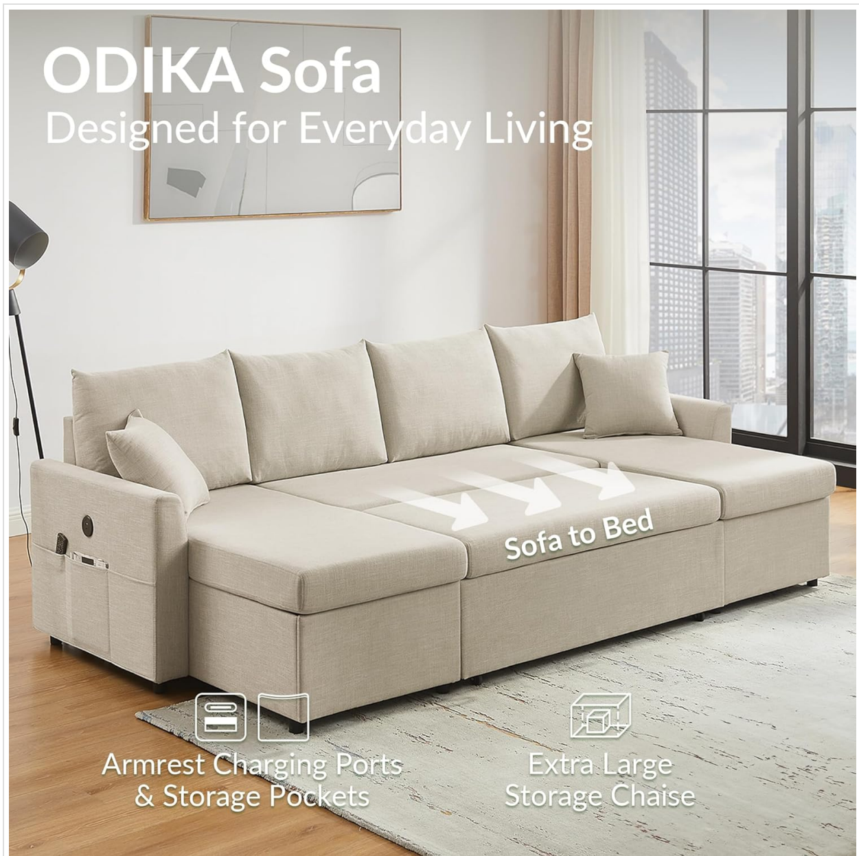
Figure 2: Visual guide for converting the sofa into a bed. Arrows indicate the pull-out motion.

Video 2: Demonstration of the sofa bed conversion feature, showing how to easily pull out the bed for guest use.