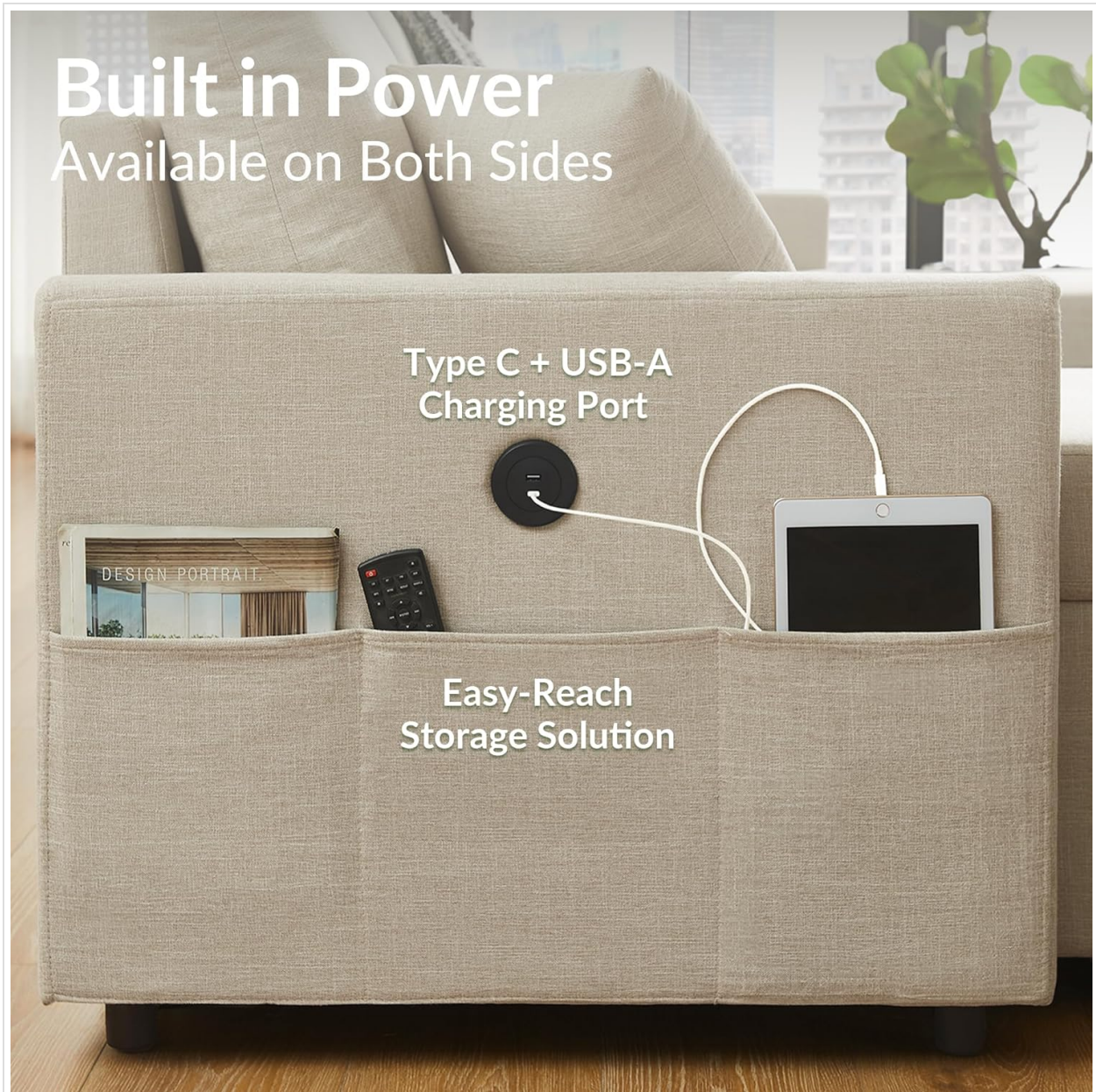
Figure 4: Close-up of the armrest showing the USB-C and USB-A charging ports, along with convenient storage pockets.