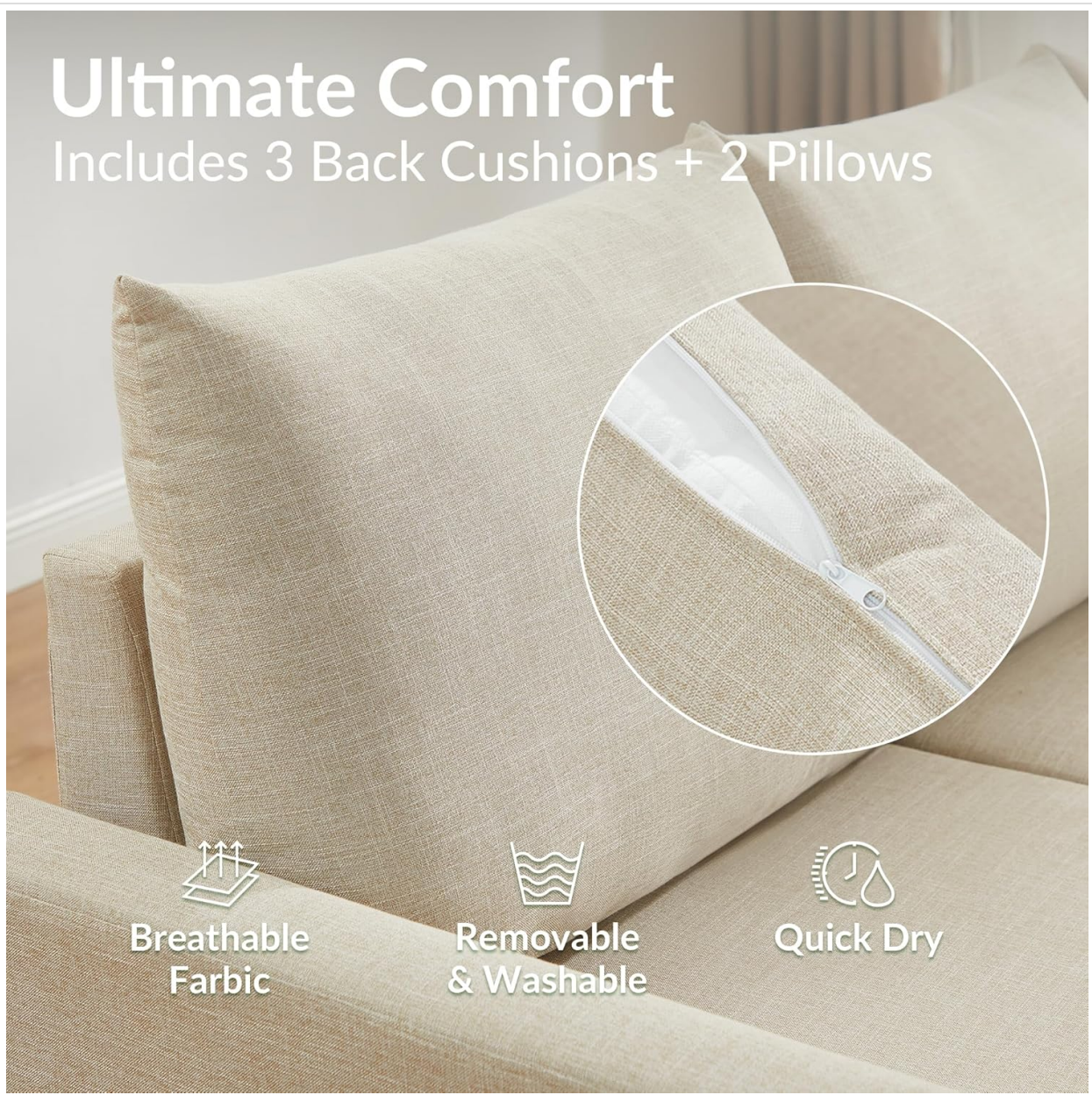
Figure 5: Detail of a cushion showing the zipper, highlighting the removable and washable linen covers.