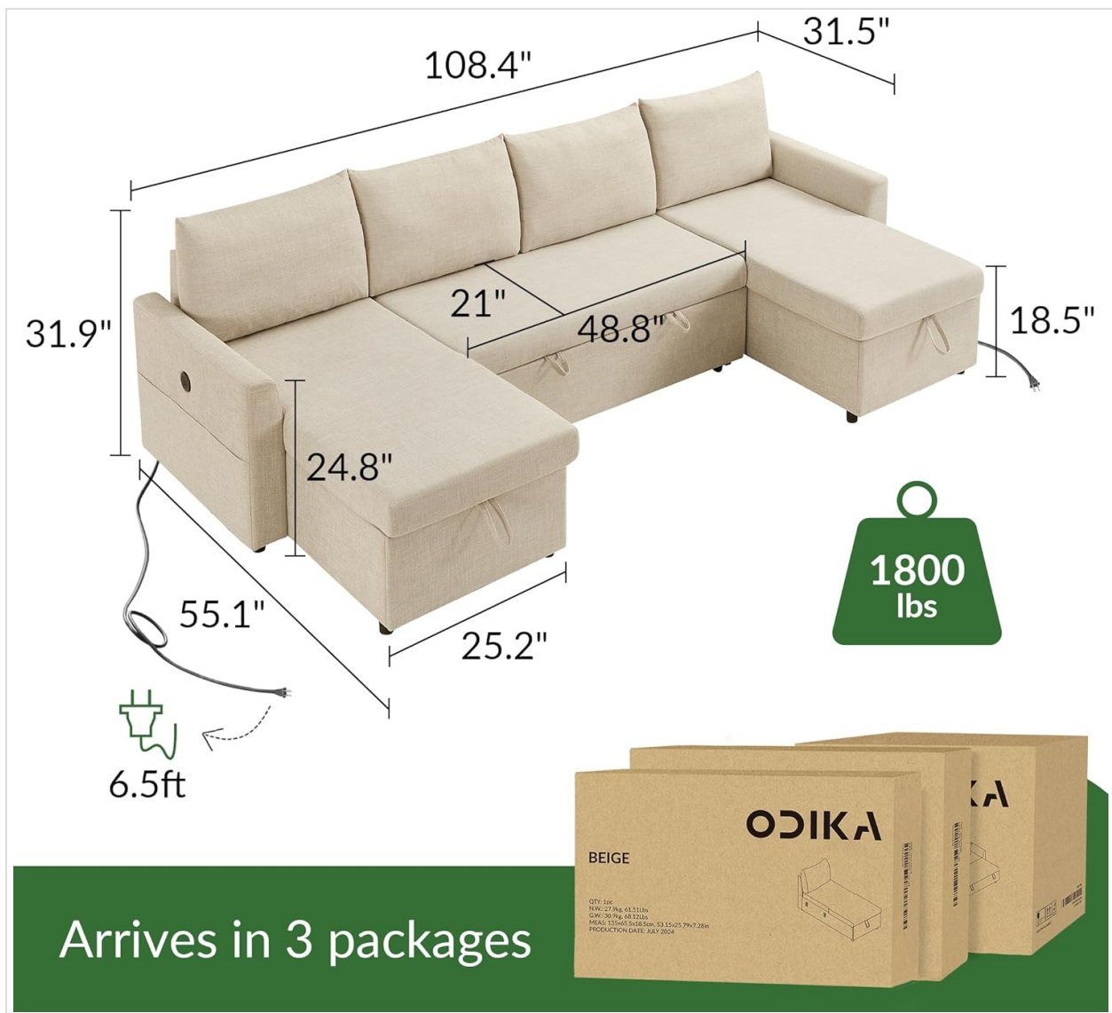
Figure 1: Sofa dimensions and packaging details. The sofa arrives in 3 packages.