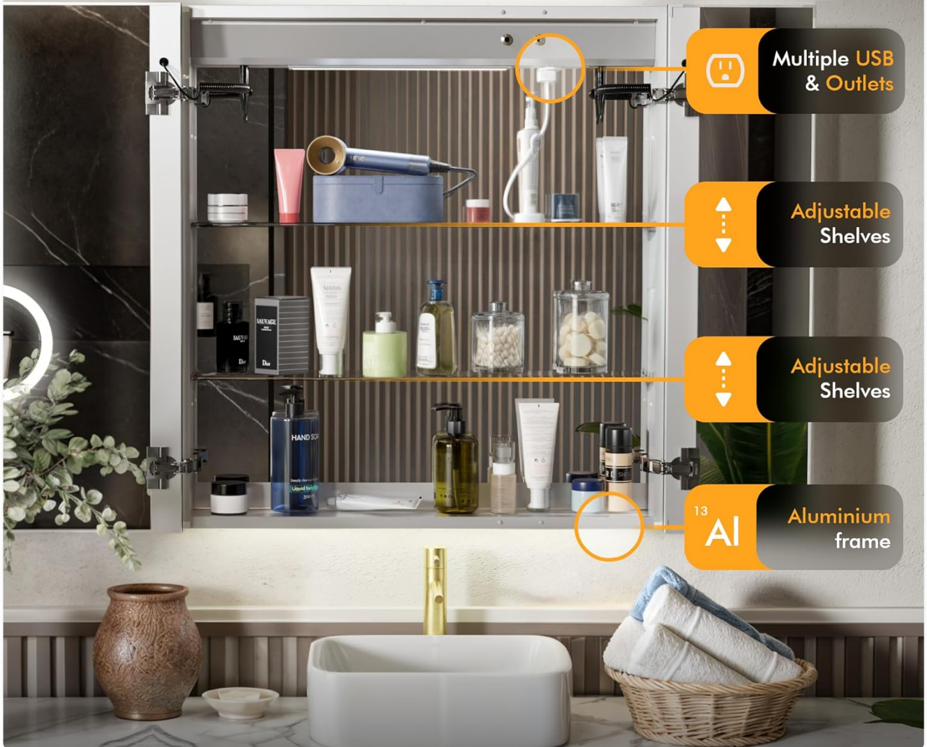
Image: Smart Organizing features, including adjustable shelves and built-in outlets.