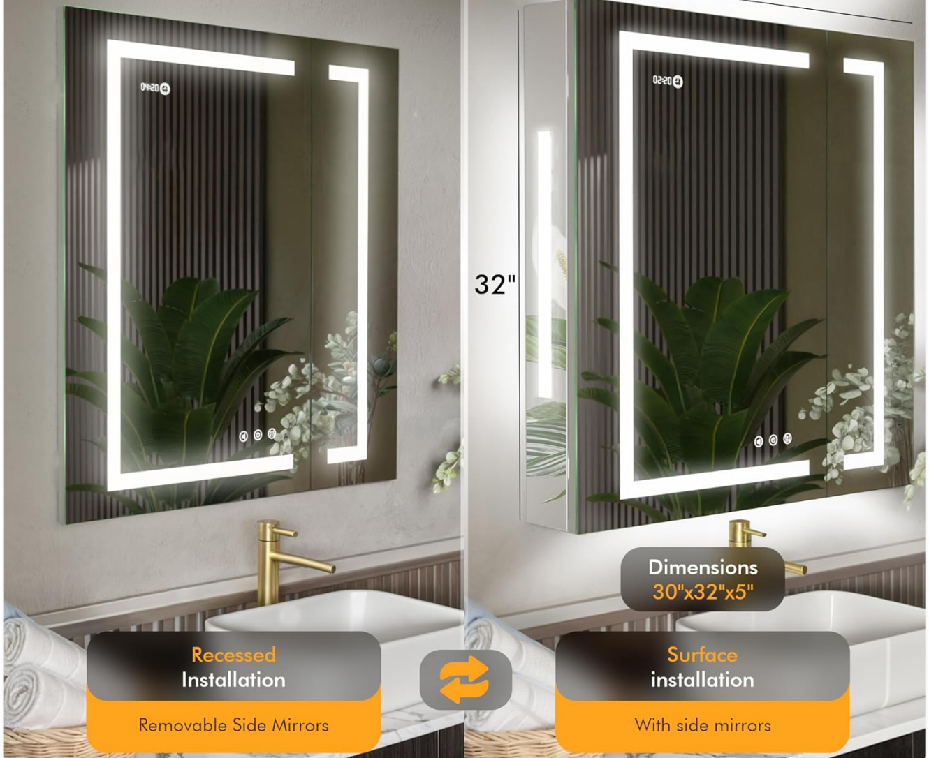
Image: Recessed vs. Surface Installation options.