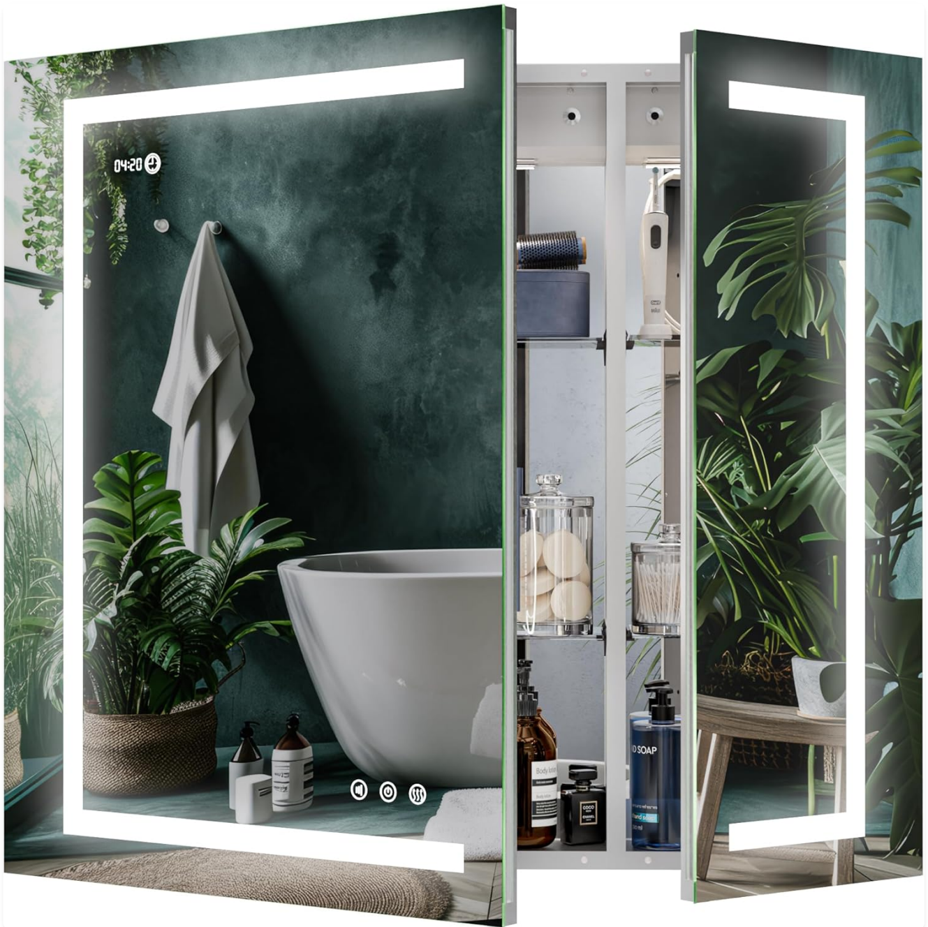
Image: KRISTALLUM LED Lighted Medicine Cabinet, showcasing its sleek design and interior storage.