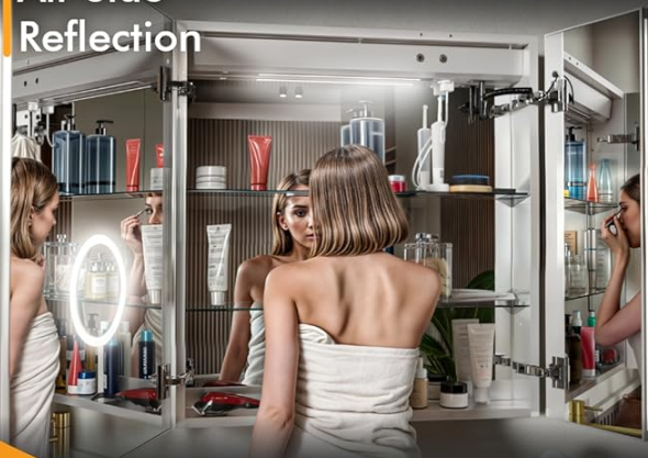
Image: All-side reflection capability for comprehensive viewing.