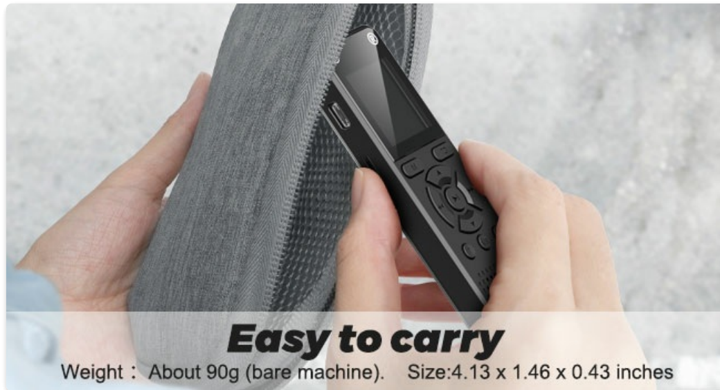
Figure 8: The compact design allows for easy portability and storage.

When not in use, store the recorder in a cool, dry place away from direct sunlight and moisture. The compact size makes it easy to carry.