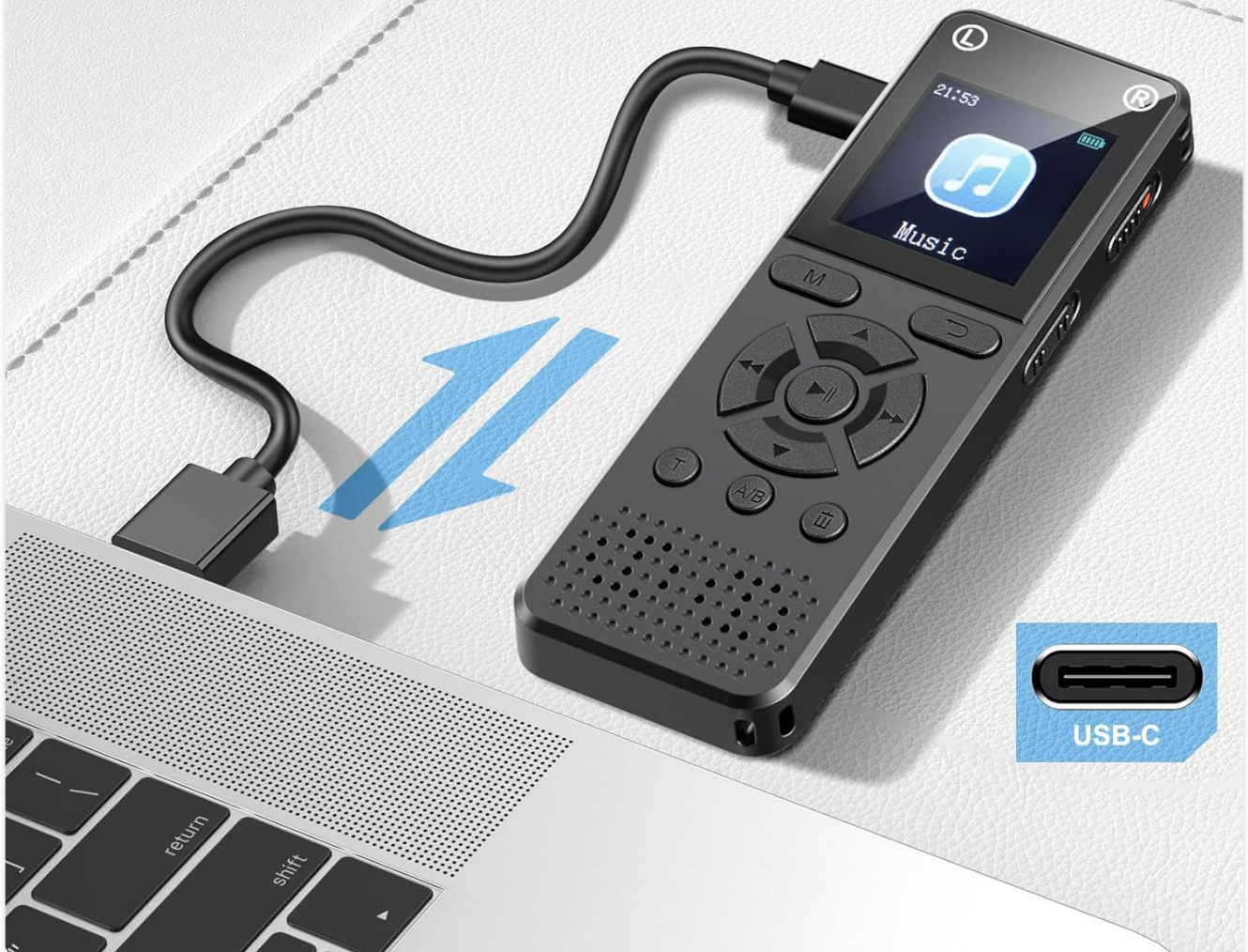
Figure 2: Connecting the device for charging or data transfer using the USB-C cable.

Either charge or use the USB-C cable to transfer recordings to any device. Hassle-free and convenient