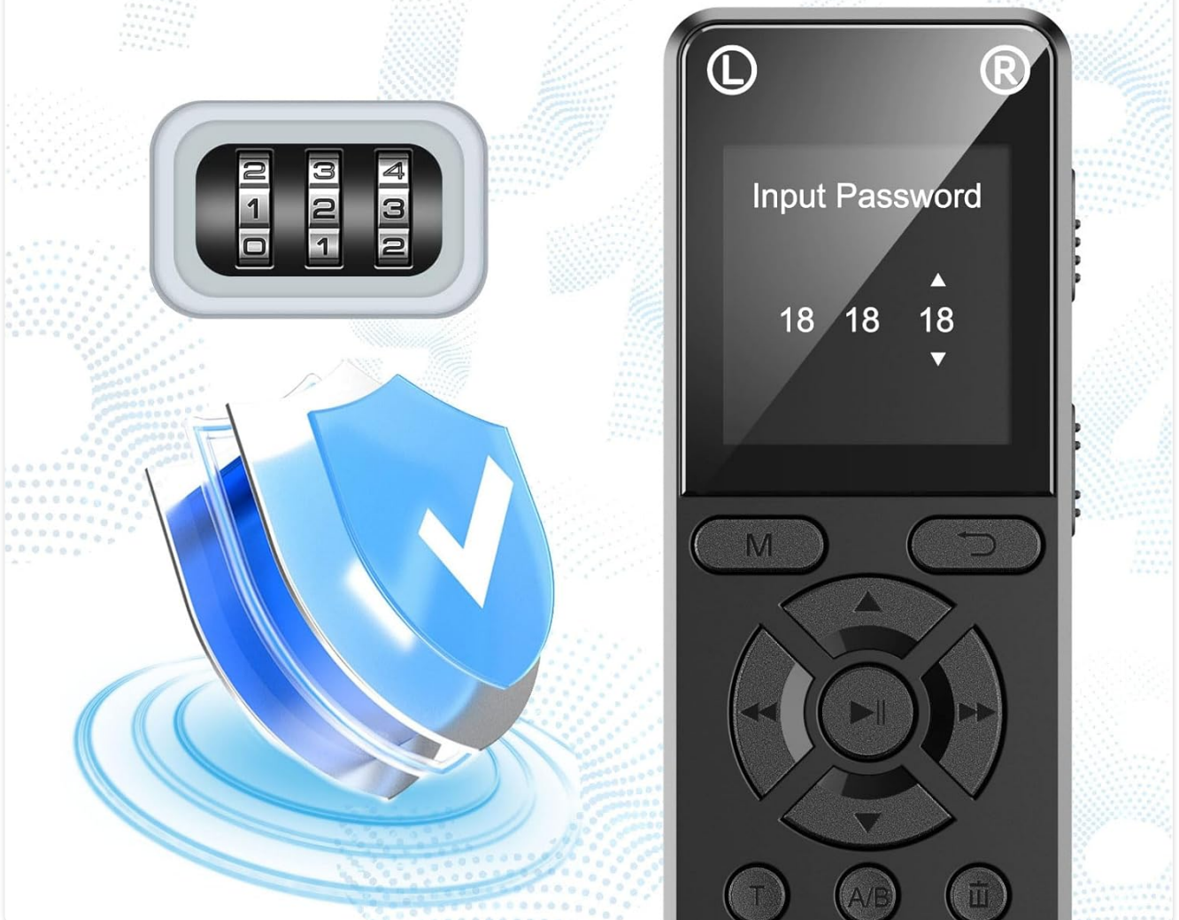
Figure 7: Password protection feature.

No one can open the device without the correct password. Save recording files in a safe place to protect your privacy