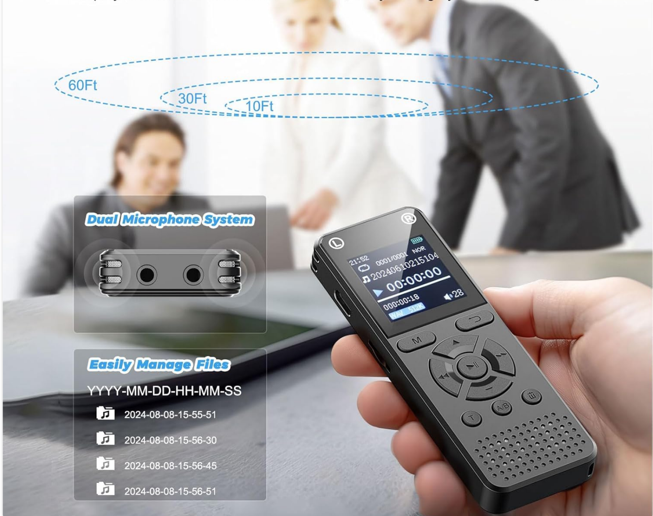
Figure 4: High-quality PCM recording with dual microphones.

Dual Microphone system, let you enjoy the superior recording quality, Display file names in date and time format, easily manage your recording files.