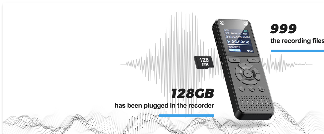
Figure 3: Labeled diagram of the recorder's buttons and ports.