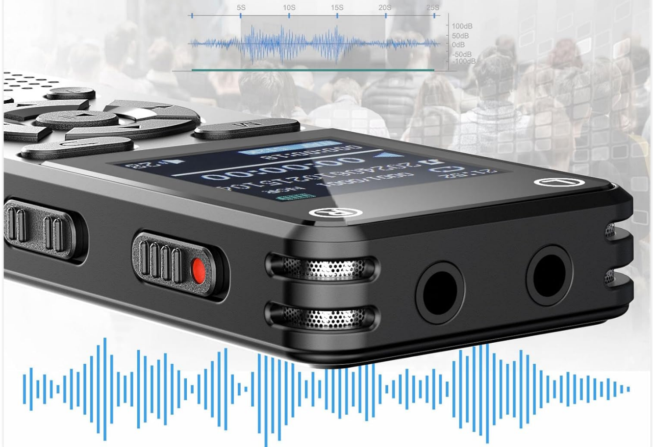
Figure 5: Voice-activated recording feature.

Utilizes the latest in audio technology, the recorder's superior acoustic sensor fine-tunes its sensitivity to sound. When there is sound (above 60dB), recording will start automatically.