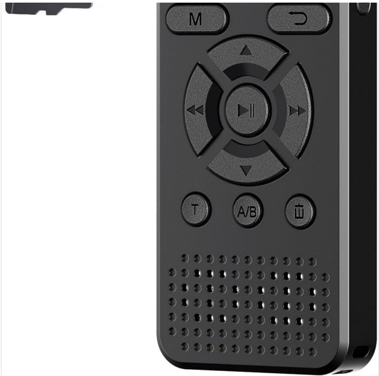
Figure 1: Holyask VV-128GB Digital Voice Recorder and included 128GB Micro SD card.