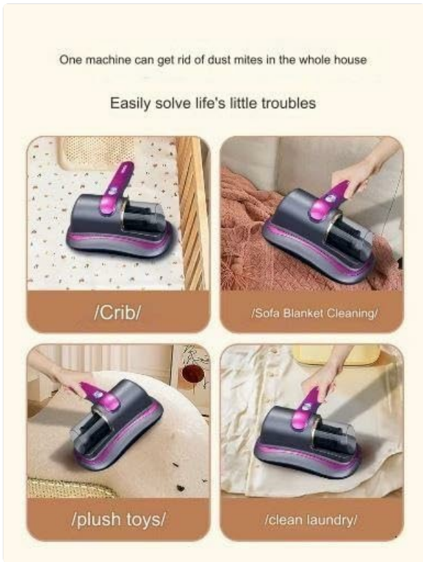
Figure 5: Versatile Application. This image demonstrates the mite remover's ability to clean various items around the house, including cribs, sofa blankets, plush toys, and clean laundry, highlighting its multi-purpose functionality.