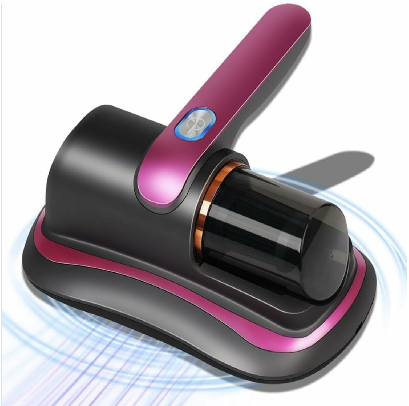
Figure 1: Overview of the Dratal Dust Suction Mite Remover. This image displays the main unit of the cordless vacuum, highlighting its ergonomic handle and transparent dust collection bin.