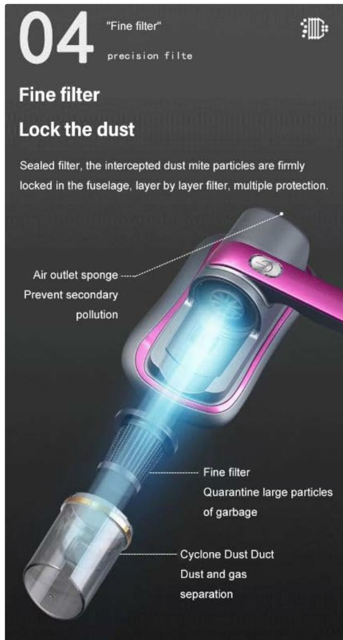
Figure 3: Fine Filter and Airflow System. This diagram shows the internal structure, including the fine filter that locks intercepted dust and mite particles, the air outlet sponge to prevent secondary pollution, and the cyclone dust duct for dust and gas separation.