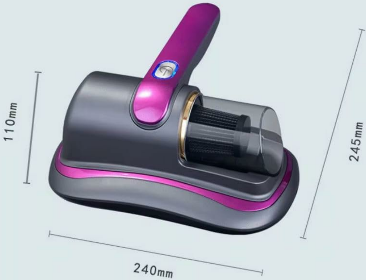
Figure 2: Product Dimensions. This image illustrates the compact dimensions of the mite remover, showing its length, width, and height for easy storage and handling.