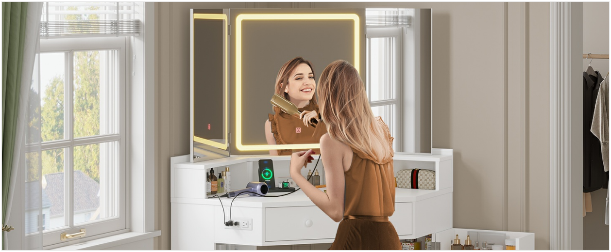
Image demonstrating the hidden rotating shelves on the bottom right side of the vanity, providing additional storage for various items.