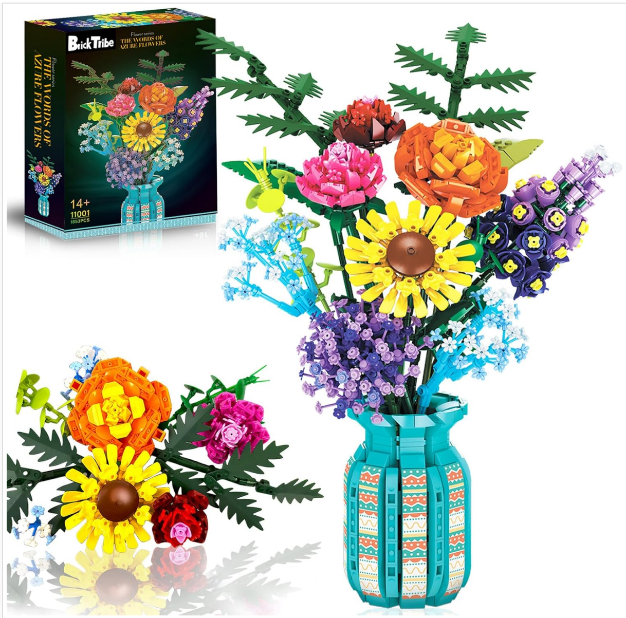
Image 1.1: The BrickTribe Botanical Collection Flower Bouquet Building Set, showing the assembled flowers in a vase and the product packaging.