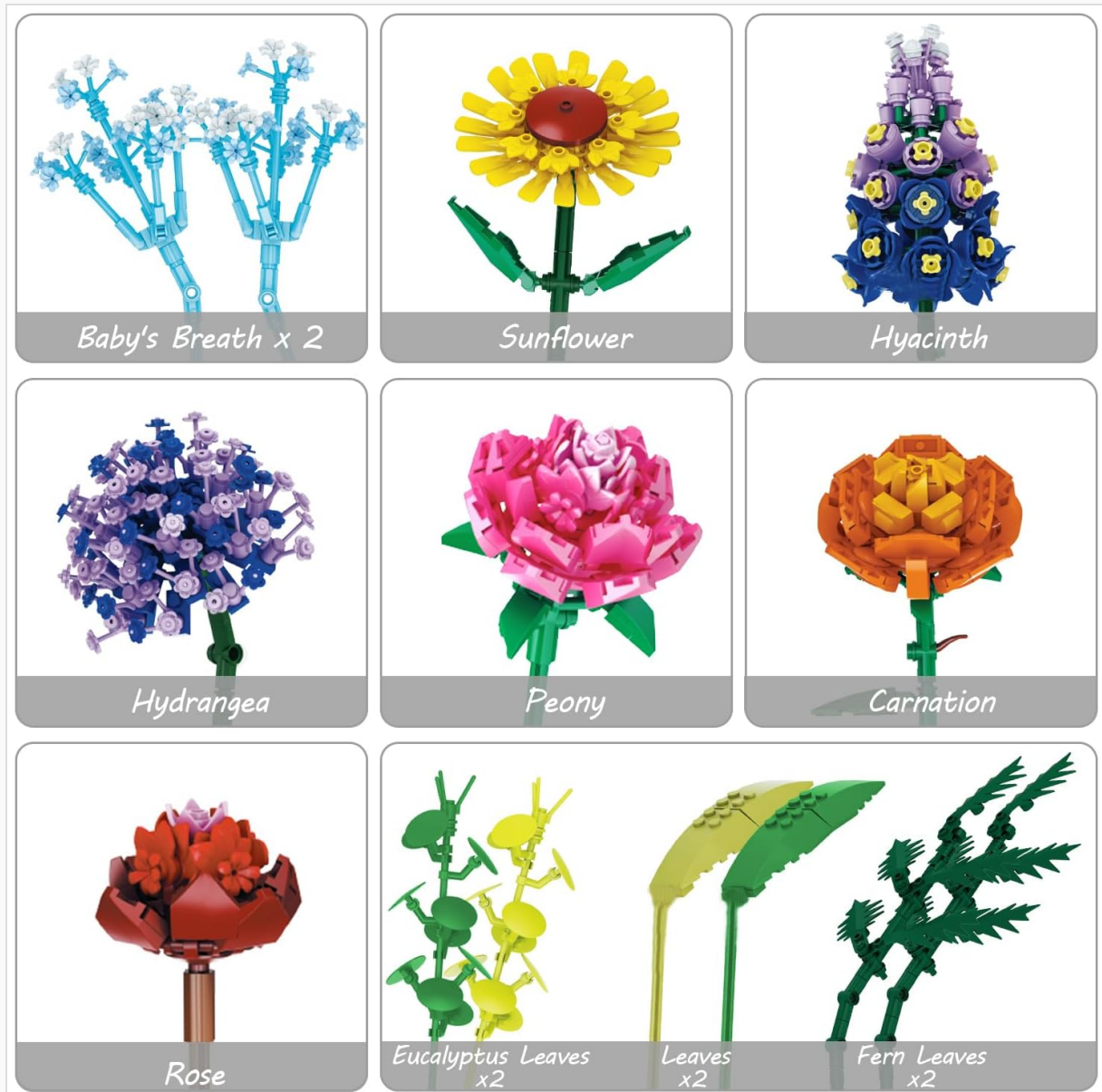
Image 4.1: Visual guide to the various flower and leaf types included in the set.