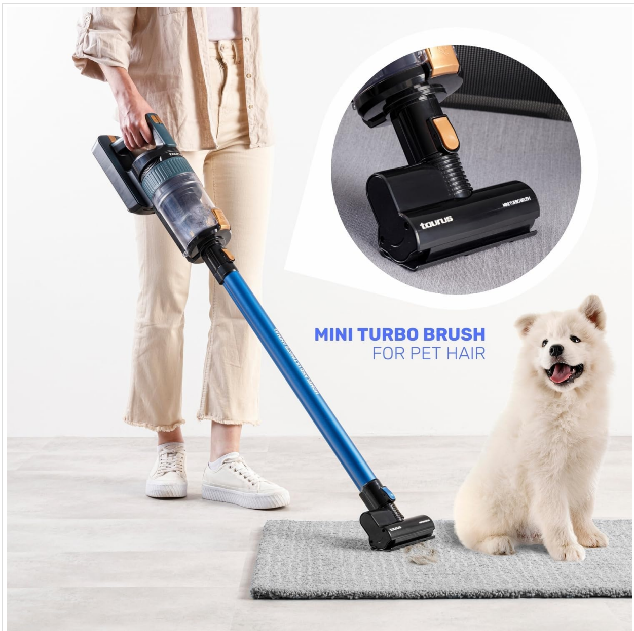
Figure 6.1: Using the Mini Turbo Brush for pet hair.