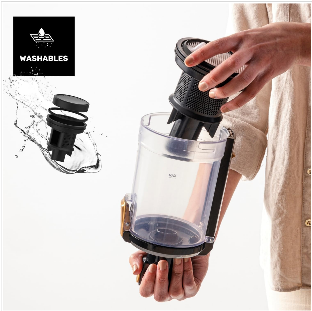
Figure 7.2: Triple advanced filtration system components.