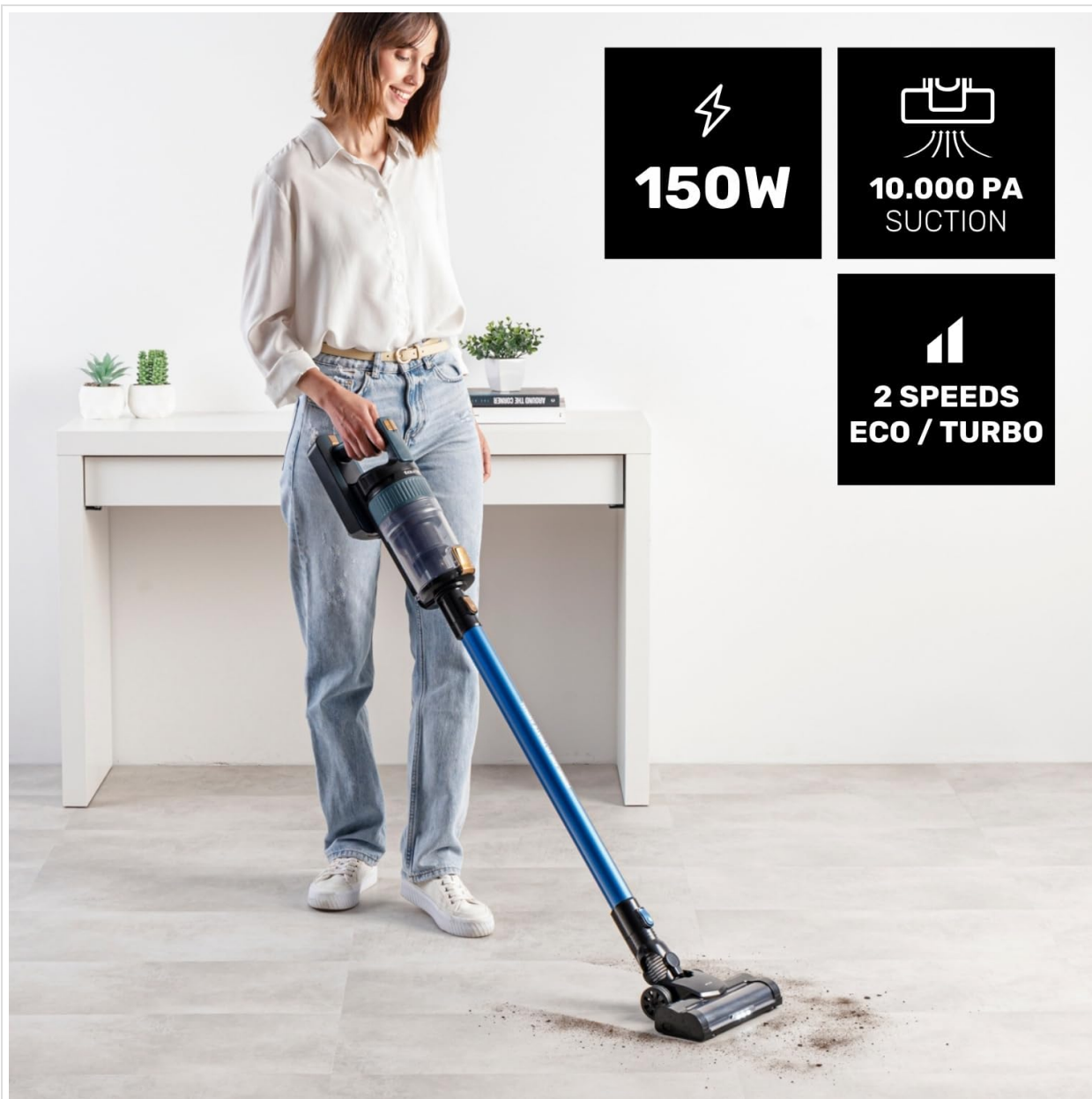
Figure 4.1: Vacuum in use, highlighting power and suction.