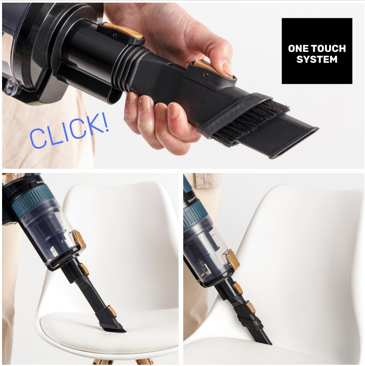
Figure 5.1: The 'One Touch System' for attaching accessories.