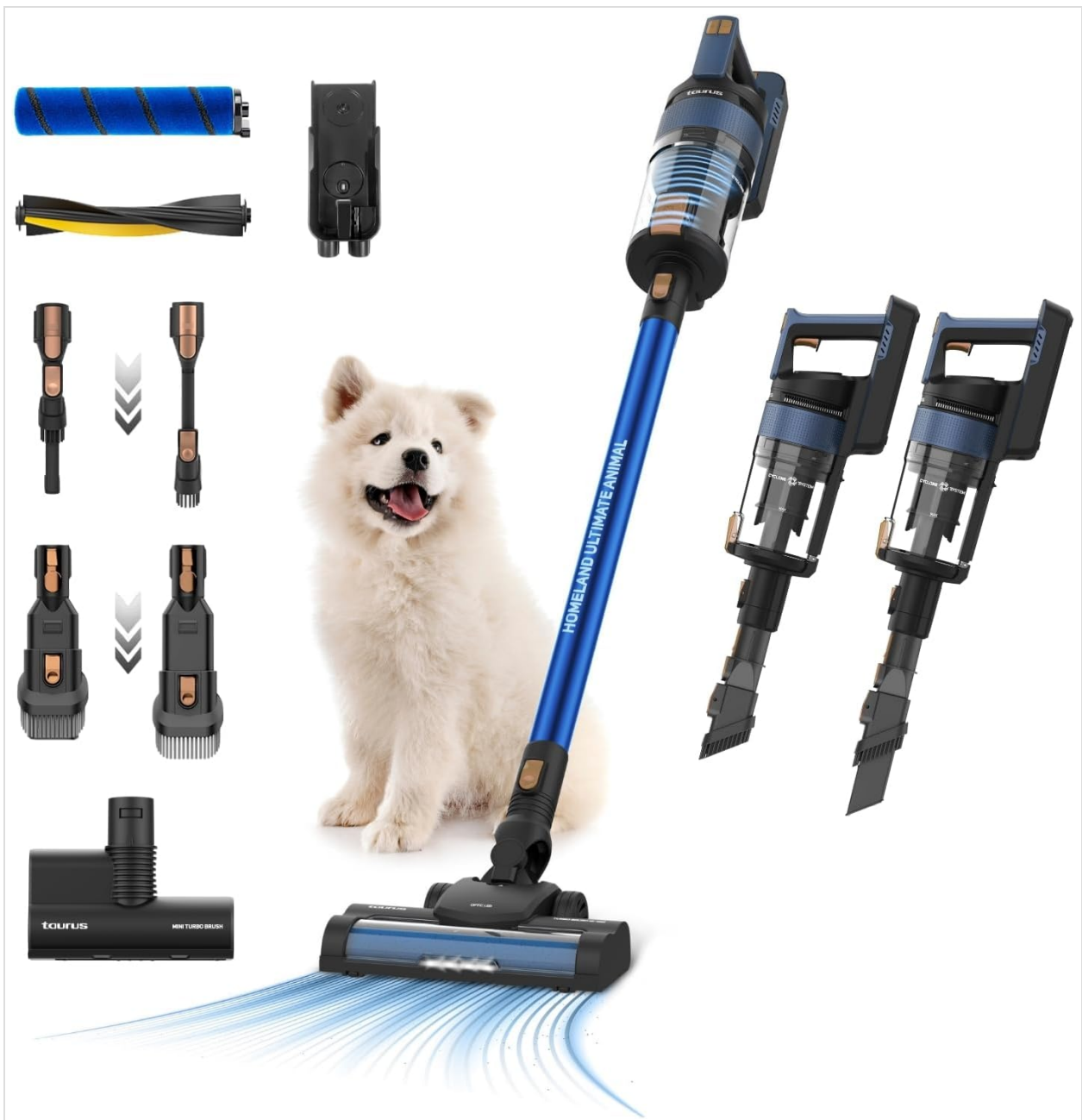
Figure 3.1: Taurus Homeland Ultimate Animal Cordless Stick Vacuum Cleaner with included accessories.