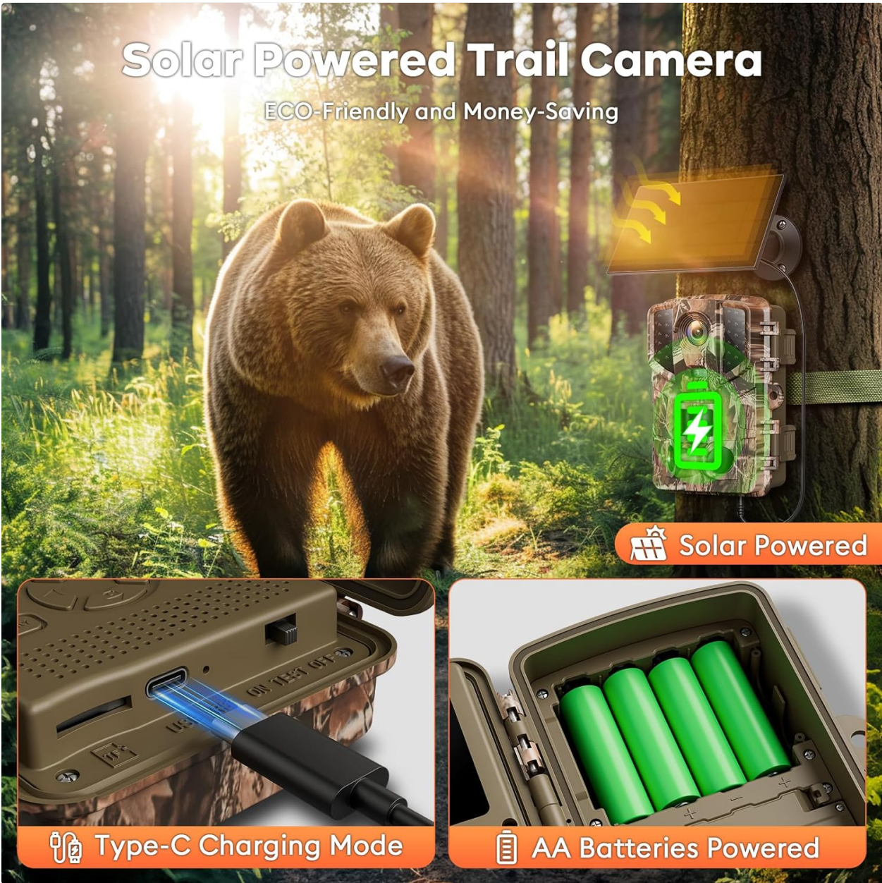
Image: Various power options for the Solareye Trail Camera, including solar, Type-C charging, and AA batteries.