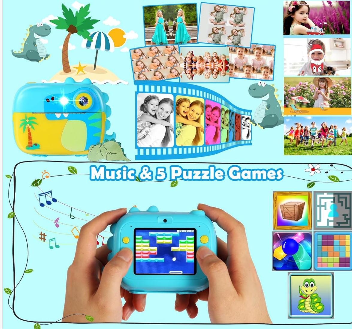
Figure 4: Explore various photo frames and filters for creative shots.

Your browser does not support the video tag.