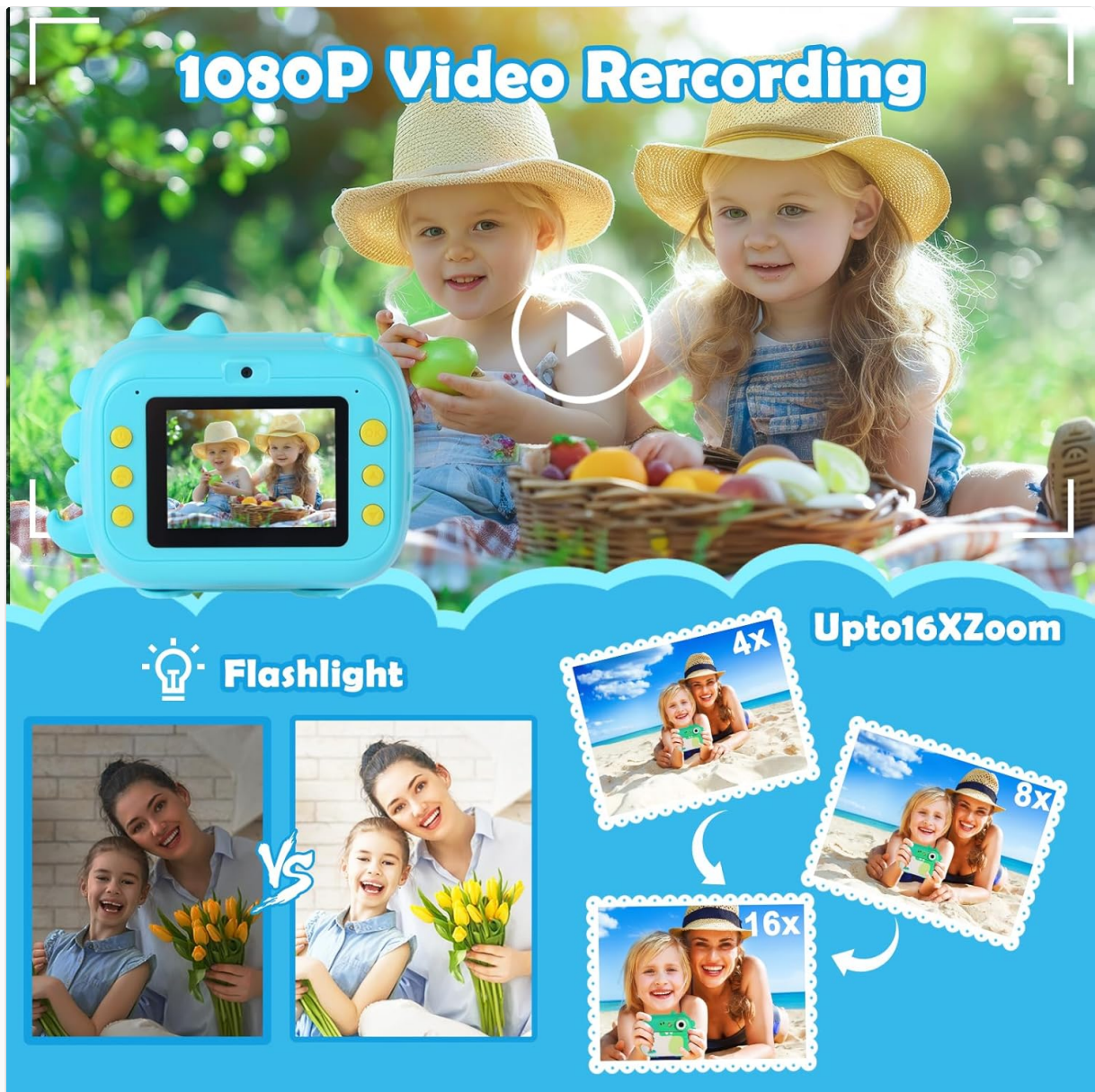
Figure 5: Key video recording features and digital zoom.