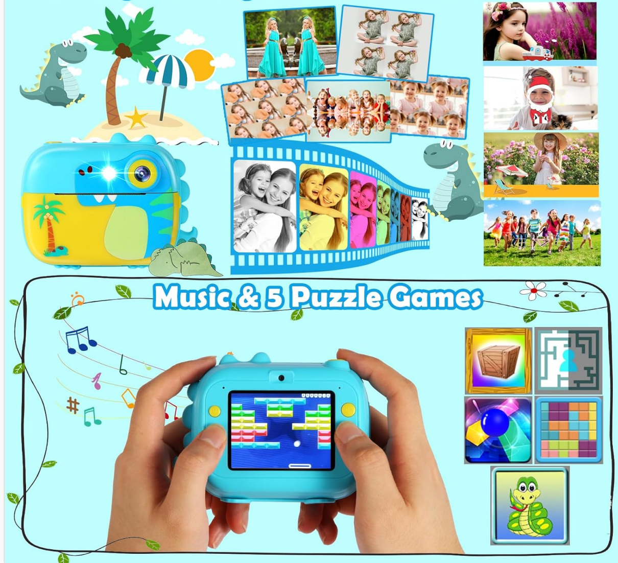
Figure 7: Accessing games and music playback features.

Your browser does not support the video tag.