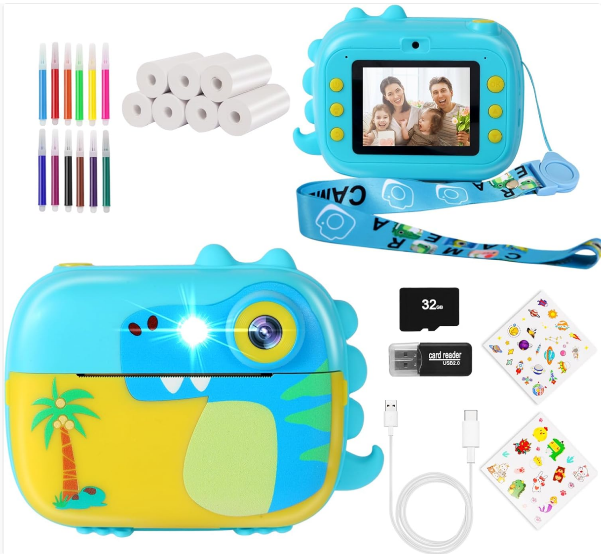
Figure 1: All components included in the ARNSSIEN M3 Kids Instant Print Camera package.

Your browser does not support the video tag.