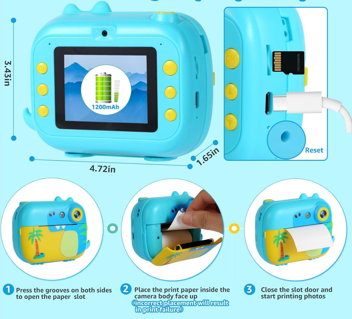
Figure 3: Step-by-step guide for loading print paper.

Your browser does not support the video tag.