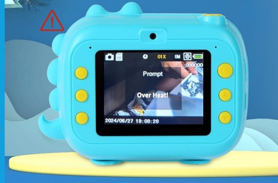
Figure 8: Overheat protection feature for child safety.

Intelligent overheating protection reminder More durable camera, safer for kids