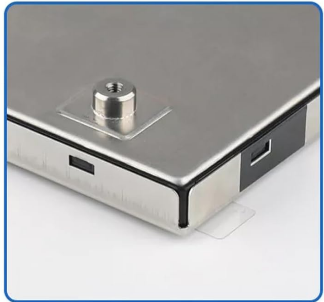
Figure 2: Detailed view of the display's partial components, including the intricate ribbon cable connections and secure mounting points. Proper connection of these elements is vital for display operation.