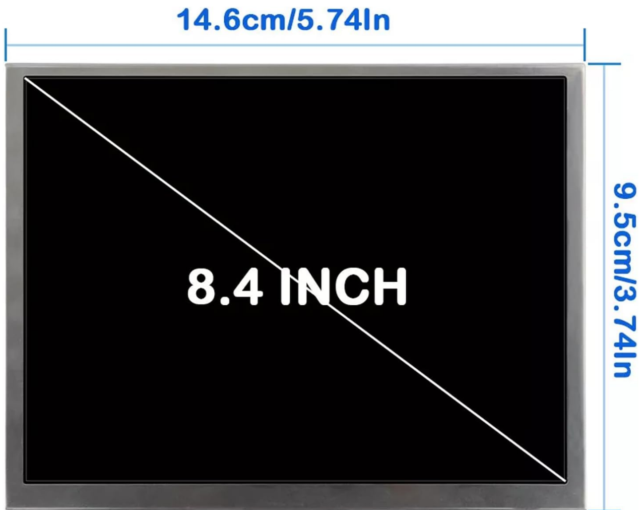
Figure 4: Dimensional overview of the 8.4-inch display, indicating its physical measurements for accurate fitment.