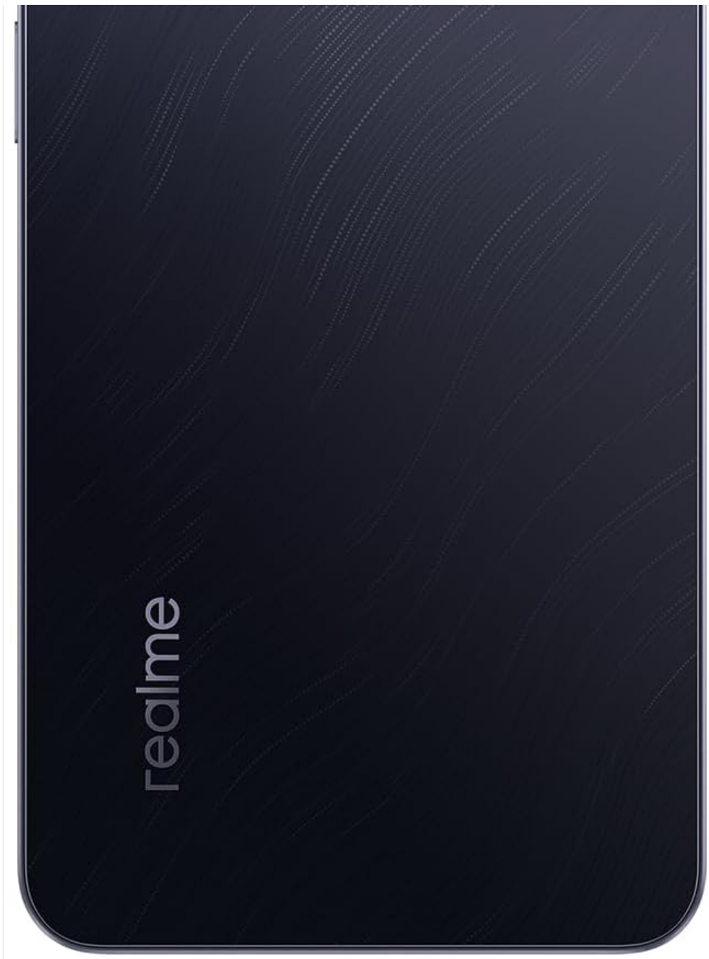
Figure 5.1: Back view of the realme Note 60 smartphone. This image displays the rear camera setup and the device's finish.