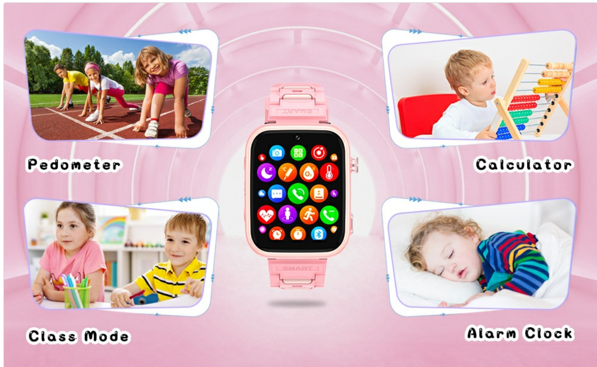
Image: Highlights utility features such as pedometer, calculator, class mode, and alarm clock.