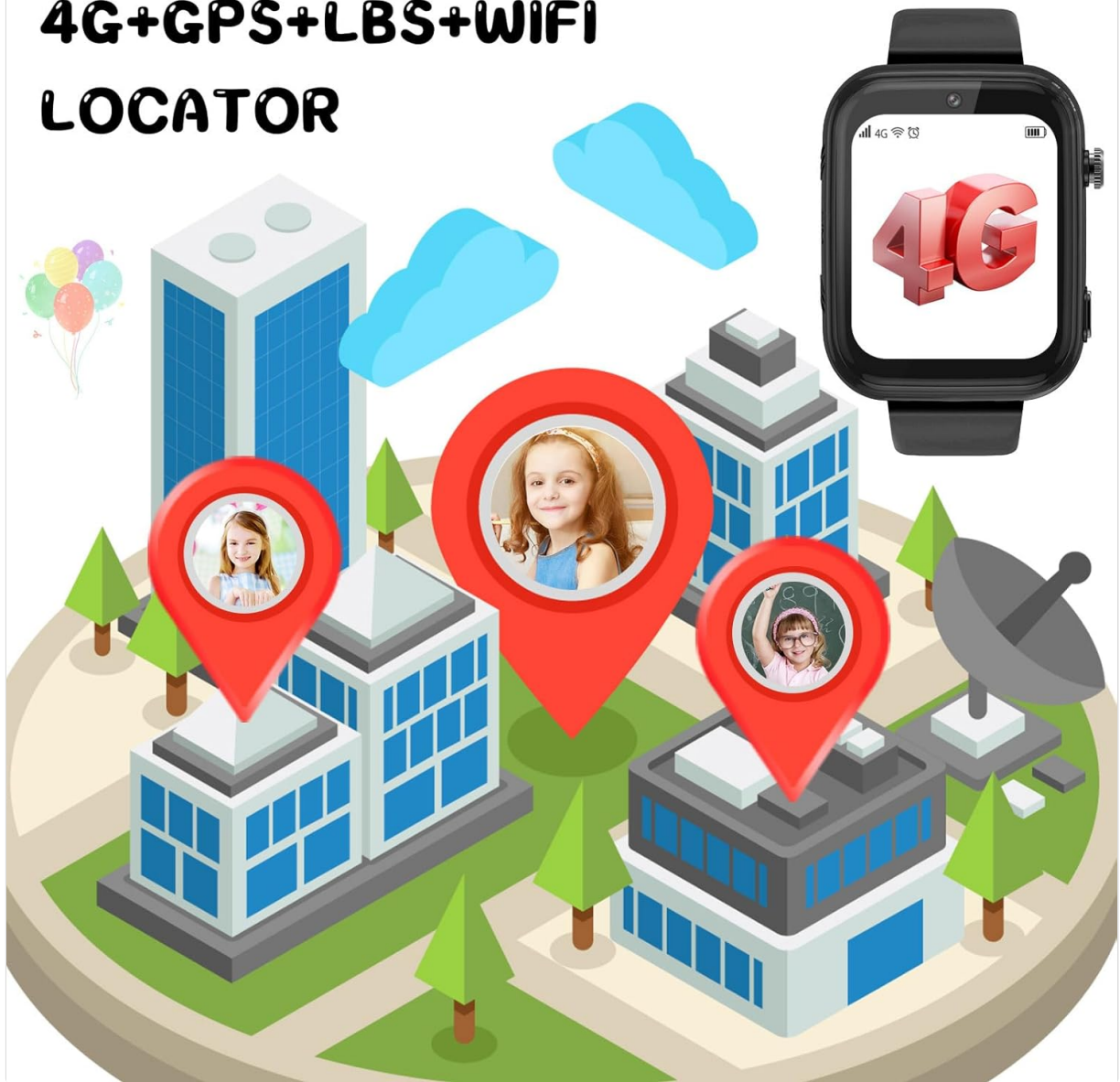
Image: Illustration of 4G, GPS, LBS, and Wi-Fi locator capabilities.