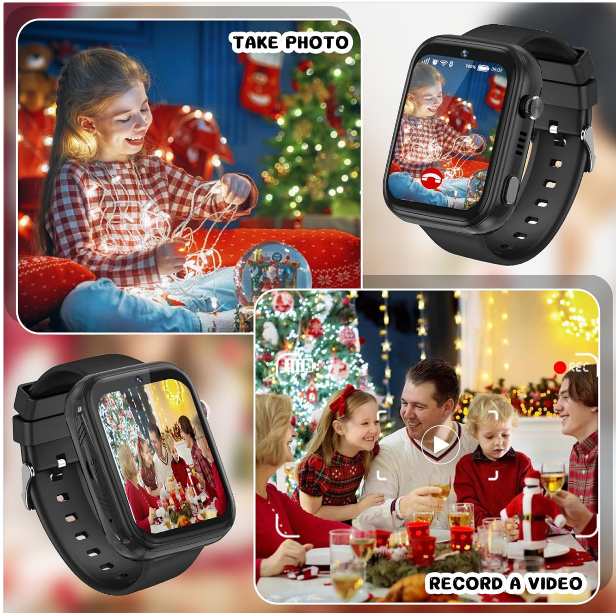
Image: Illustrates the photo and video recording capabilities.