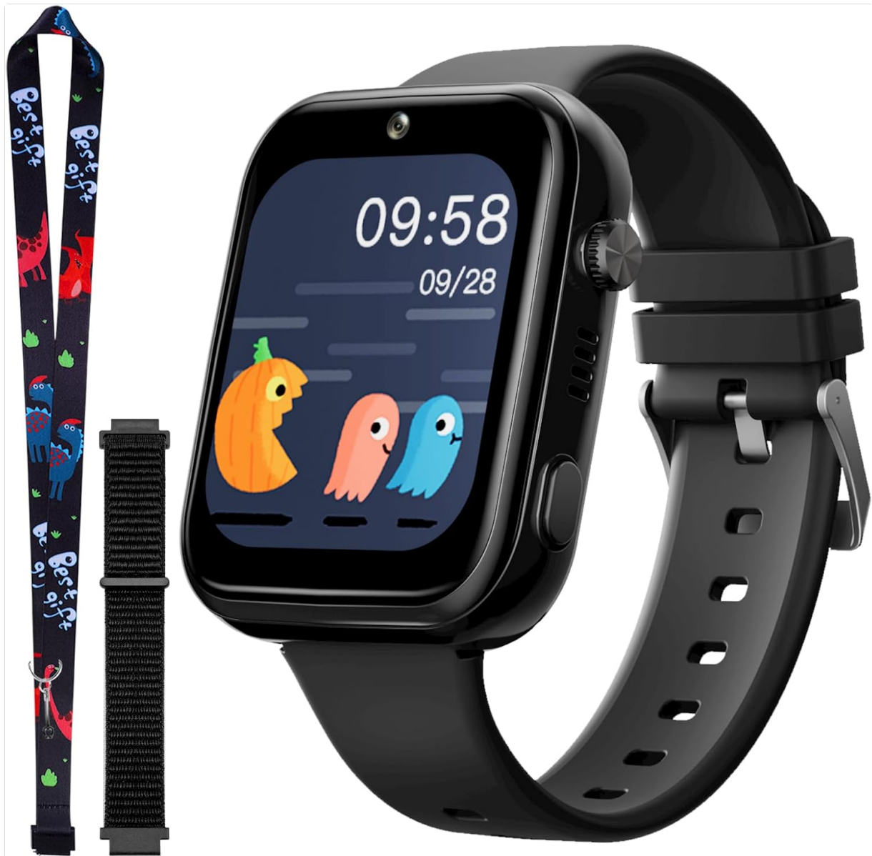
Image: The OKYUK T45 4G Kids Smartwatch, showcasing its design and included accessories.