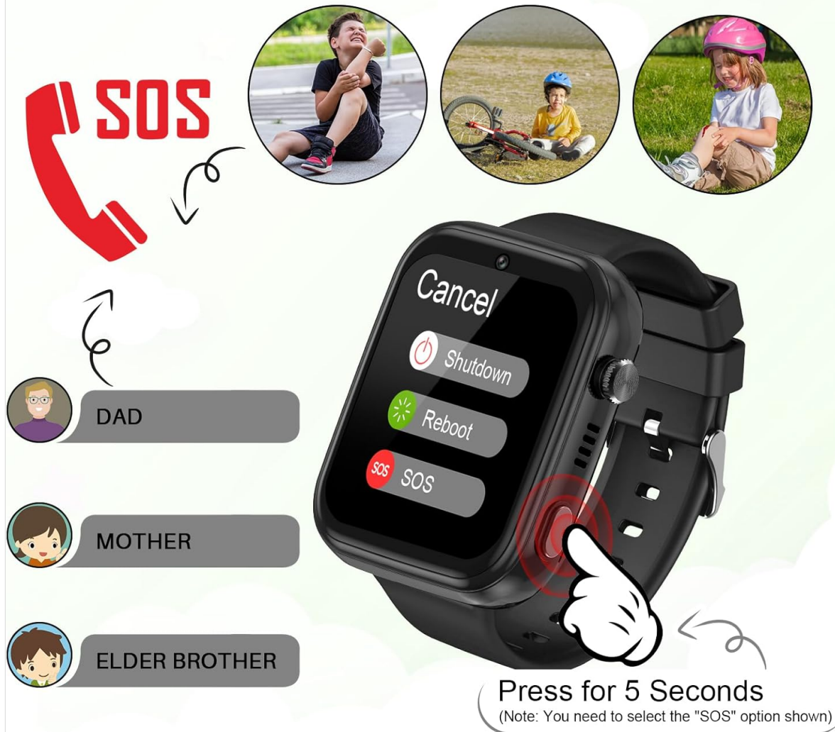
Image: Visual representation of the SOS emergency call feature.