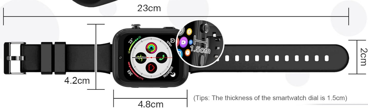
Image: Smartwatch dimensions and controls, including the rotating button and SIM card slot.