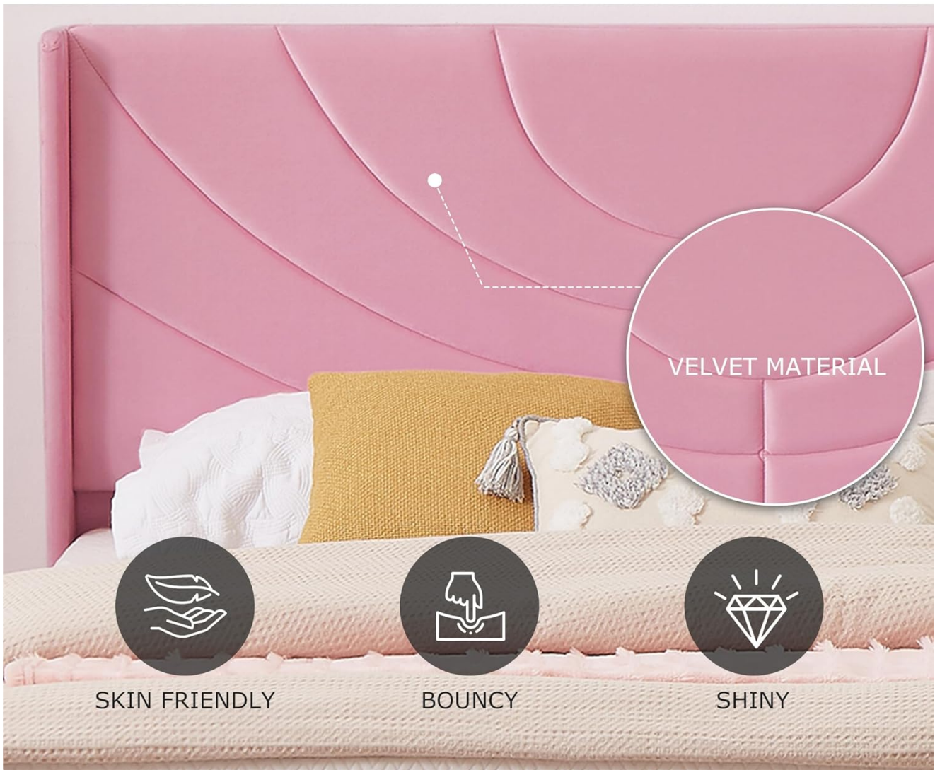
Image: A detailed view of the pink velvet upholstered headboard, highlighting its soft texture, skin-friendly quality, and elegant design.