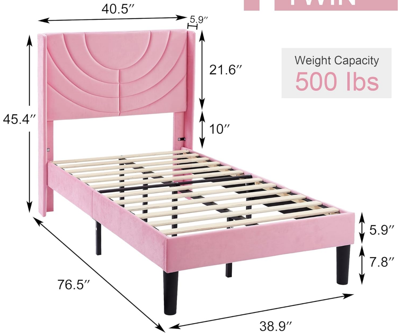
Image: A detailed diagram illustrating the dimensions of the VECELO Twin Upholstered Platform Bed Frame, including length, width, headboard height, and under-bed clearance.