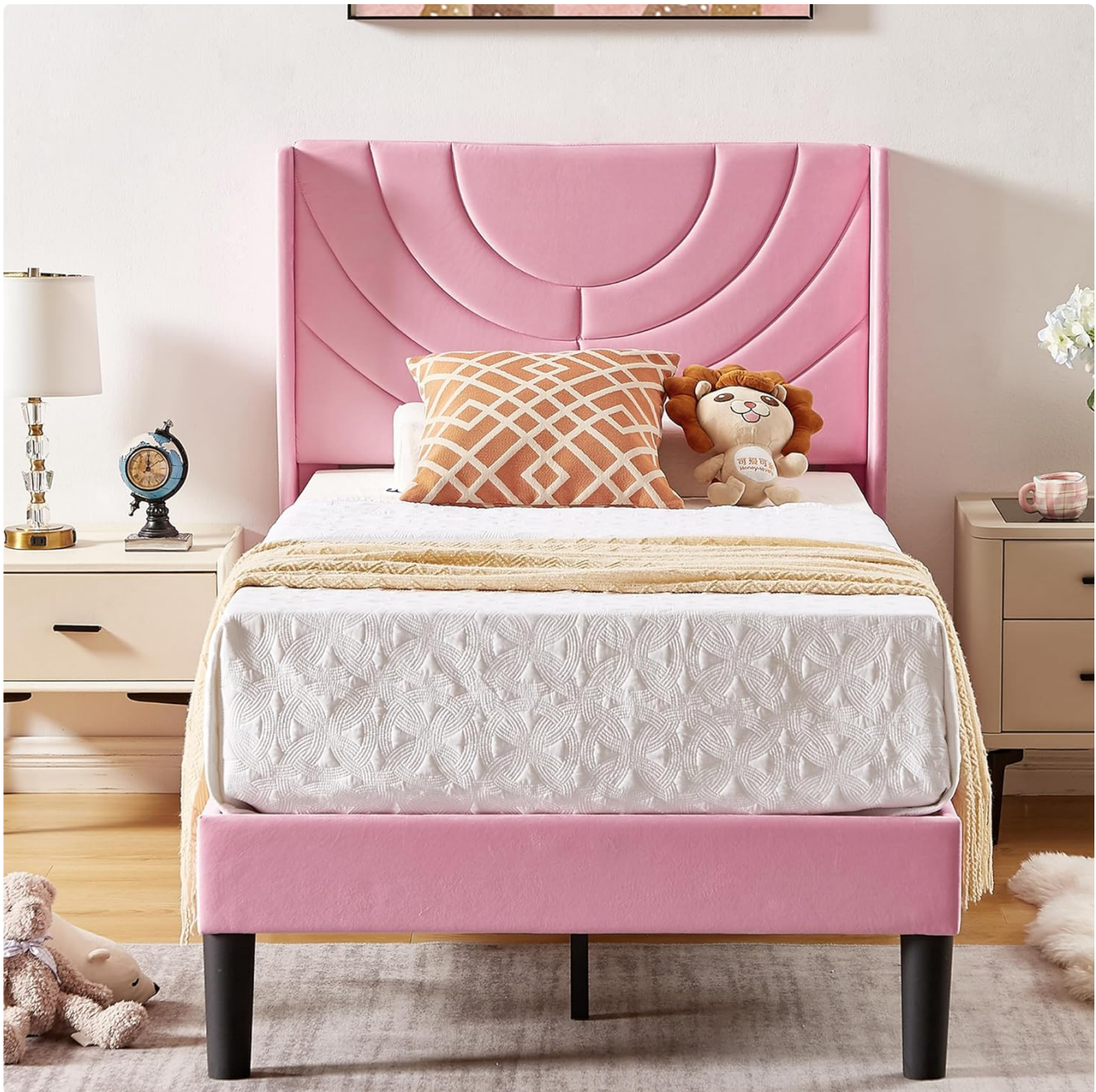
Image: The VECELO Twin Upholstered Platform Bed Frame, featuring a pink velvet headboard and frame, with a mattress and decorative pillows. The bed is set in a room with light-colored furniture.