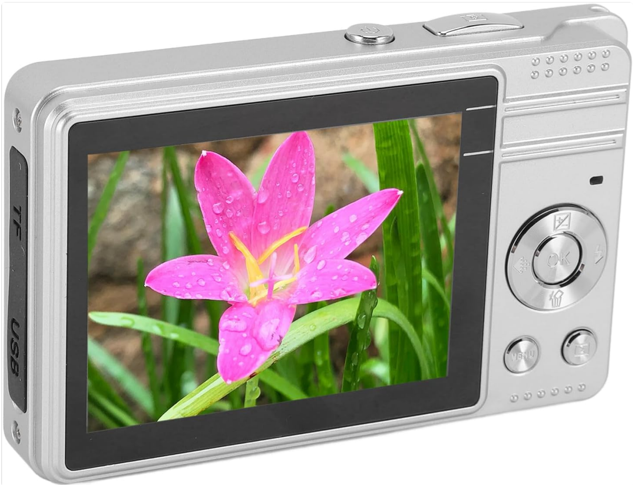
Image: The Zopsc Digital Camera in silver, showcasing its compact design and front lens. This camera is capable of capturing 50MP images.