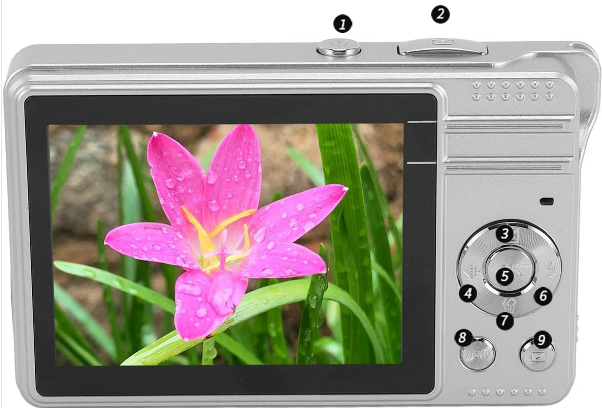
Image: A diagram illustrating the camera's buttons and their corresponding functions. Keyed numbers point to: 1. Open key, 2. Shutter key, 3. Continuous Shooting/T key/Upper key, 4. Time lapse/left key, 5. Confirmation key, 6. Fill Light/Right key, 7. Delete/Down key, 8. Menu Key, 9. Mode Switch.