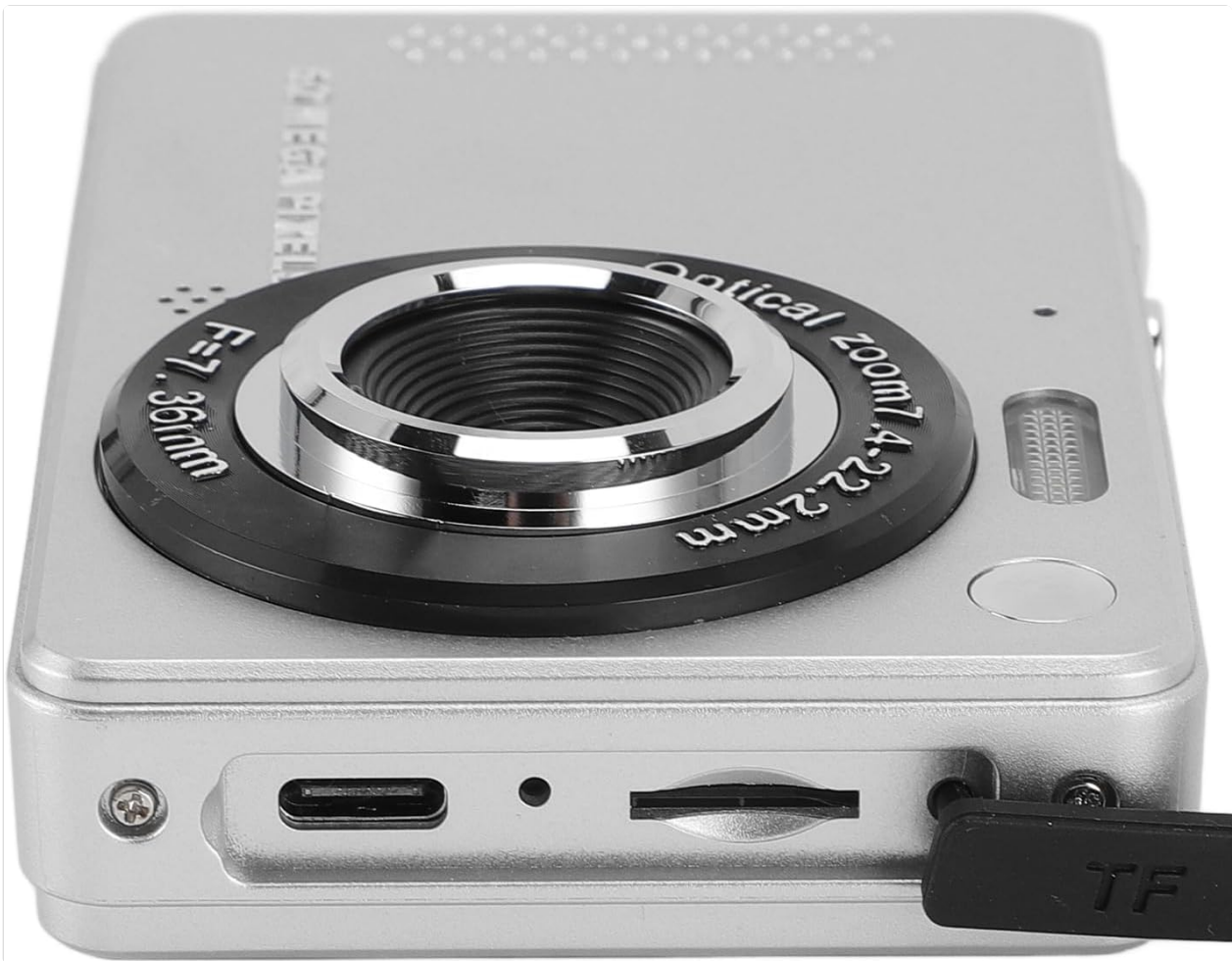
Image: A close-up side view of the Zopsc Digital Camera, highlighting the USB port and the memory card slot (labeled TF for TransFlash/microSD).

9. Mode Switch: Changes between photo, video, and playback modes.