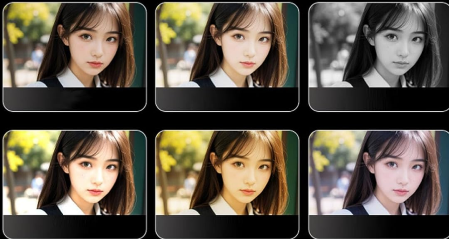
Image: The Zopsc Digital Camera's screen showing a grid of six different filter effects applied to an image, demonstrating the camera's ability to shoot in various styles.