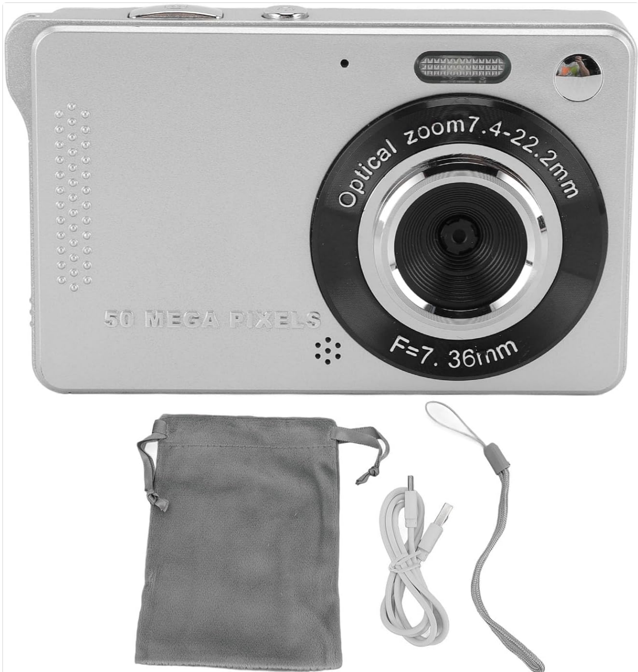
Image: The Zopsc Digital Camera shown with its included accessories: a gray carrying pouch, a white USB charging cable, and a gray hand strap.