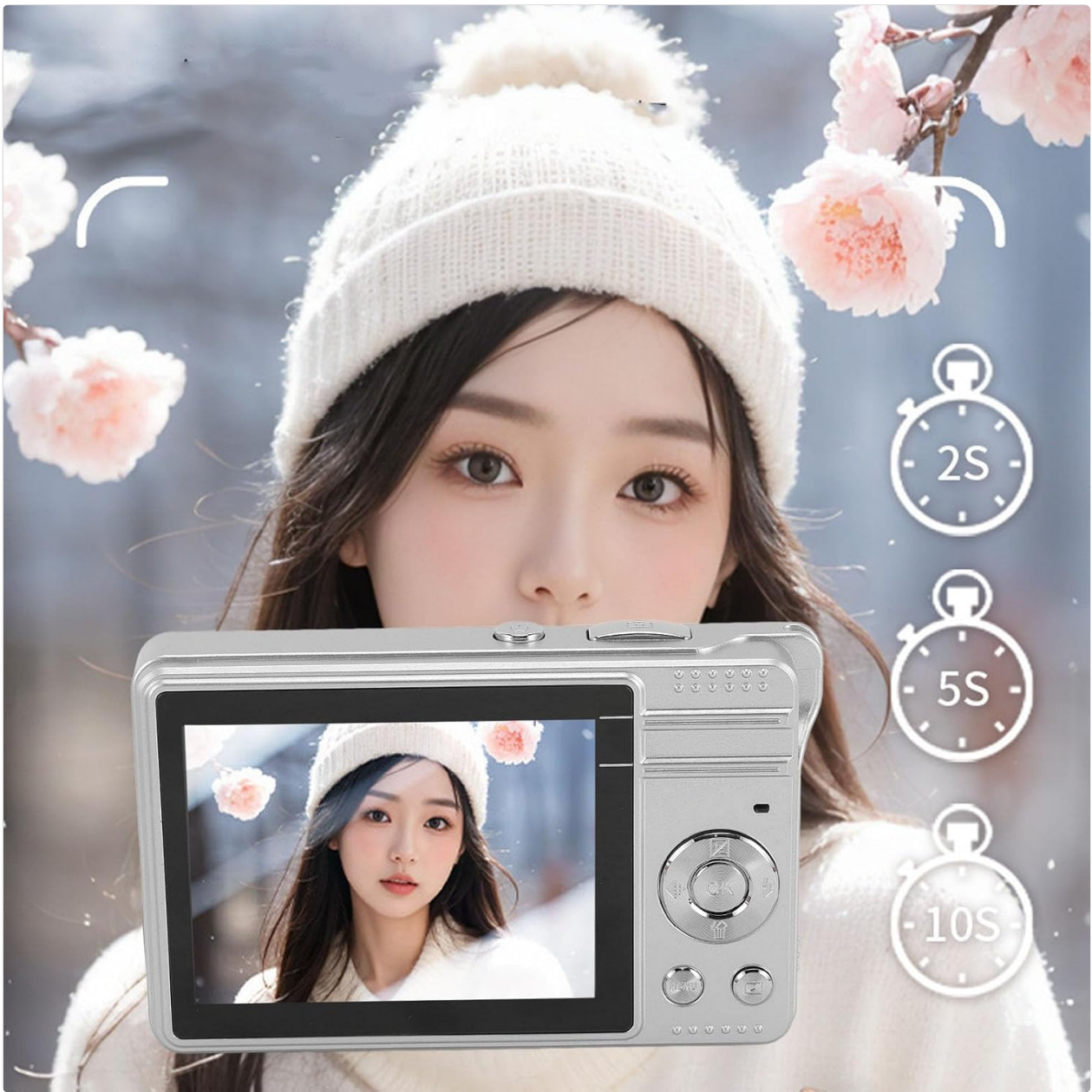
Image: The Zopsc Digital Camera held up, with the screen showing options for a 2-second, 5-second, or 10-second self-timer, indicating the camera's auto-timer functionality.