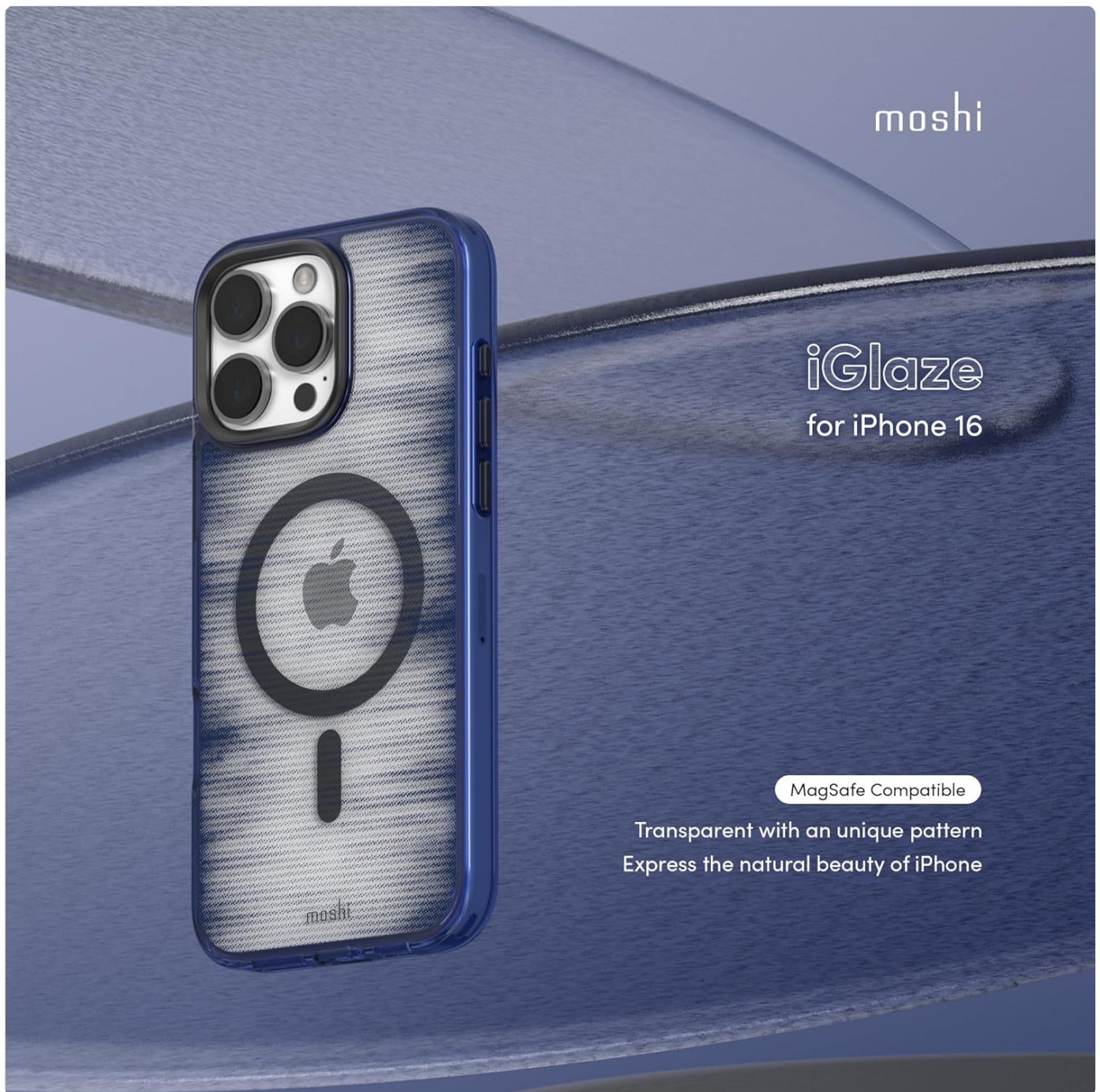
Figure 2: The Moshi iGlaze case securely fitted onto an iPhone 16 Pro Max, demonstrating its precise cutouts and slim profile.