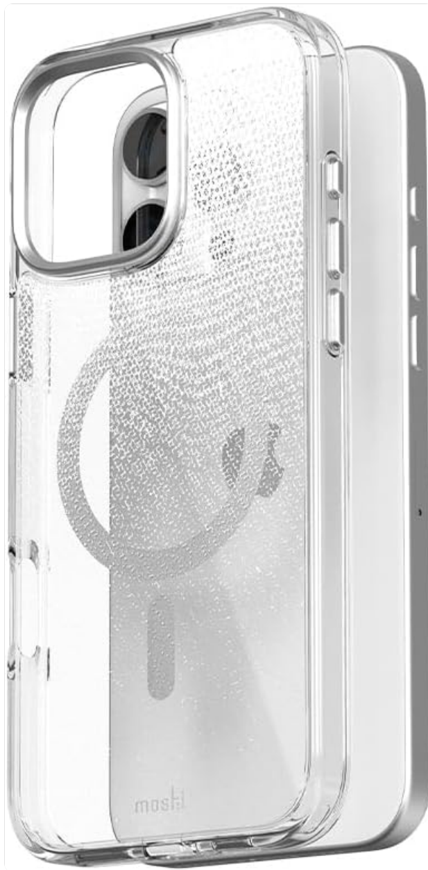
Figure 1: Moshi iGlaze case for iPhone 16 Pro Max in Mist White, showcasing its sleek design and MagSafe compatibility.