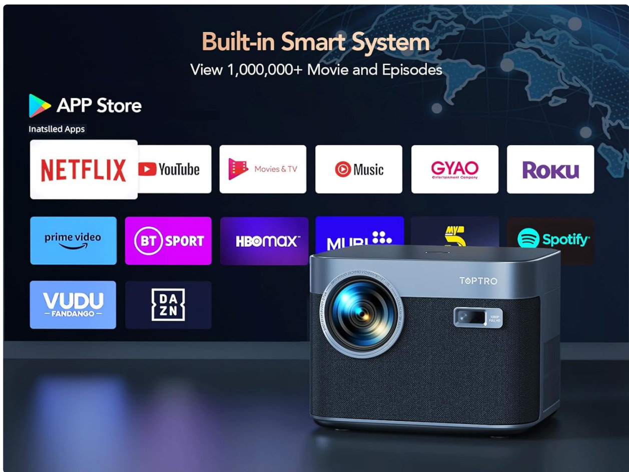
Image 5.1: The projector's interface showing available streaming applications.