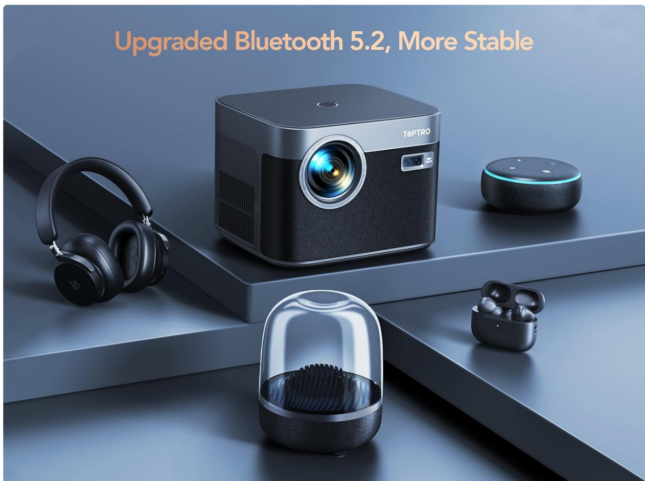
Image 3.4: Demonstrates the projector's Bluetooth 5.2 connectivity with external audio devices.