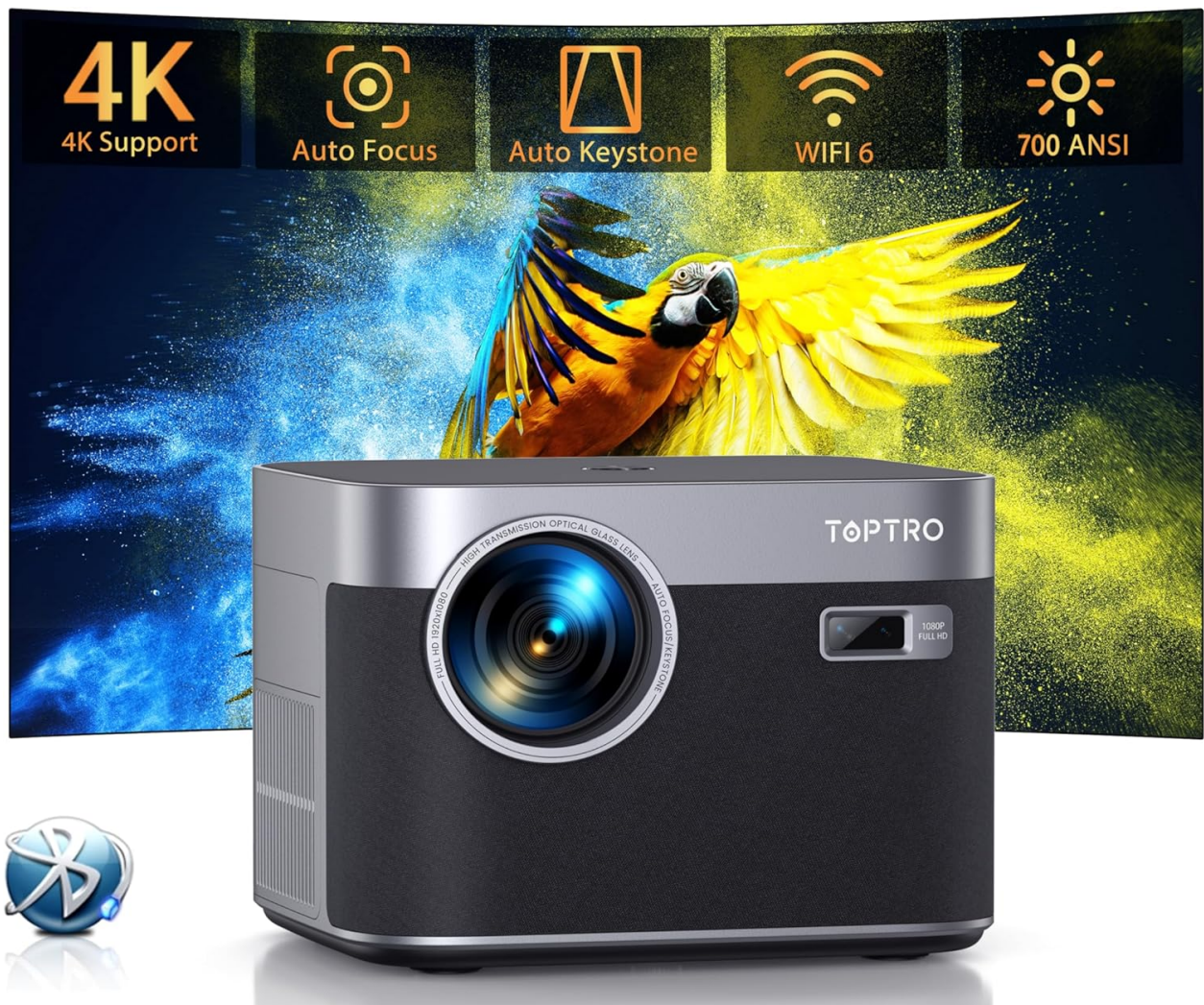
Image 1.1: Front view of the TOPTRO X7 Smart Projector highlighting key features.