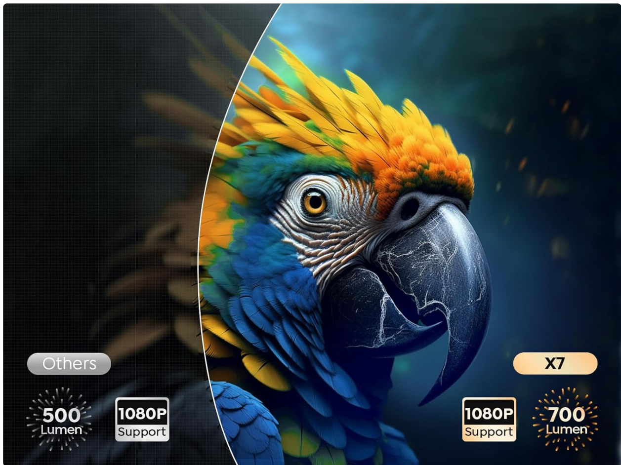
Image 3.2: Illustrates the superior brightness and resolution of the TOPTRO X7 compared to other projectors.