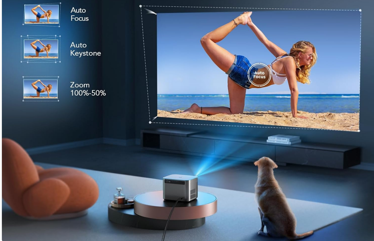
Image 3.1: Visual representation of the projector's auto focus, auto keystone, and zoom capabilities.

Video 3.1: Demonstration of how to operate the auto focus feature on the TOPTRO X7 projector.