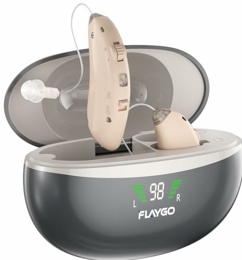
Flaygo Rechargeable Hearing Aids with their charging case.