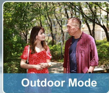
Multi-mode functionality for various environments.